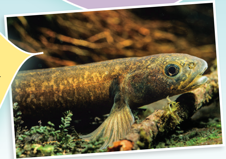
© Wild Things Issue 141, November 2018. Produced by Forest & Bird