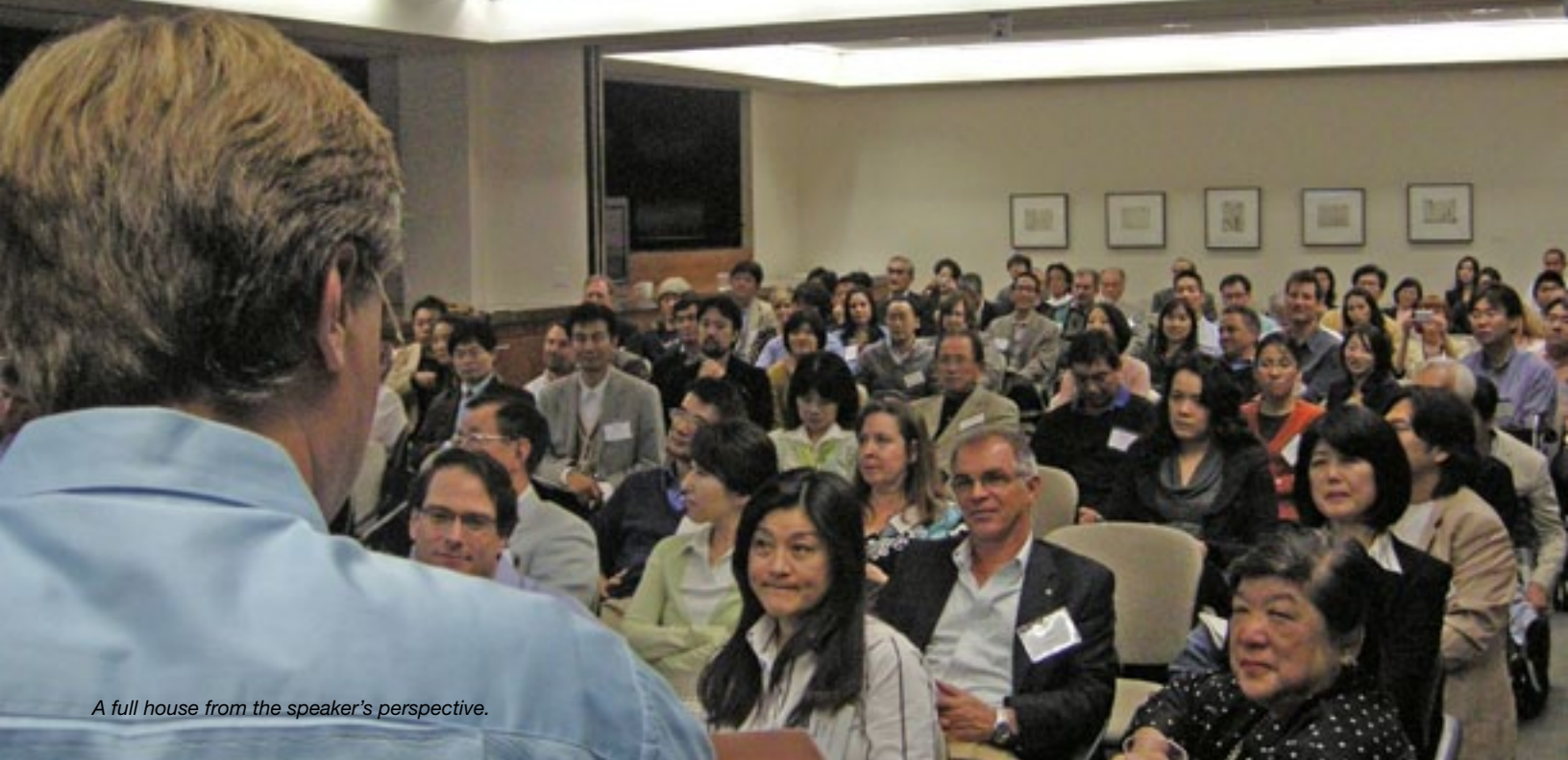
A full house from the speaker's perspective.