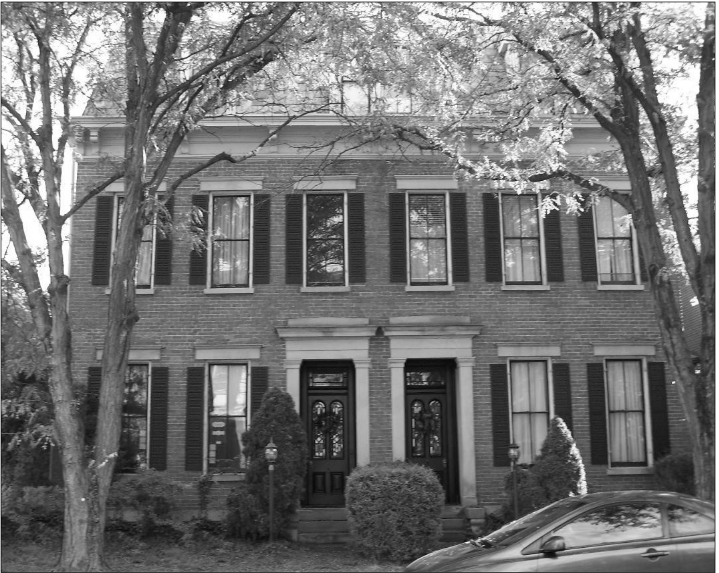
Grant House, 518-520 Greenup Street, Covington