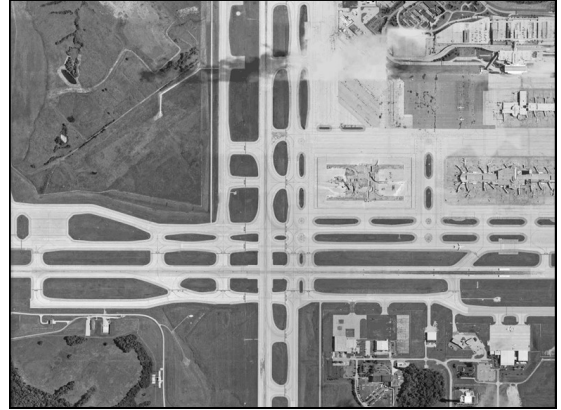
Left: Boone County Airlines in approximately 1945. Right: Just a small portion of the tremendous acreage of the Cincinnati Northern Kentucky International Airport in 2019.