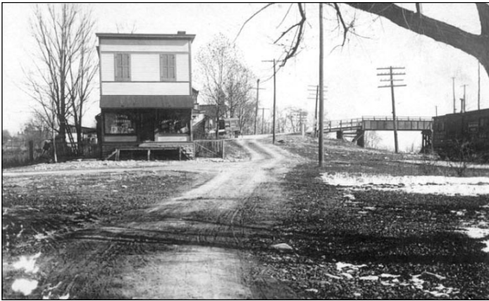
J. A. Smith Store at Western Reserve and Annison Streets