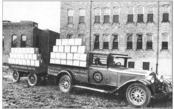
Shipments of Carlsbad mineral water, circa 1930