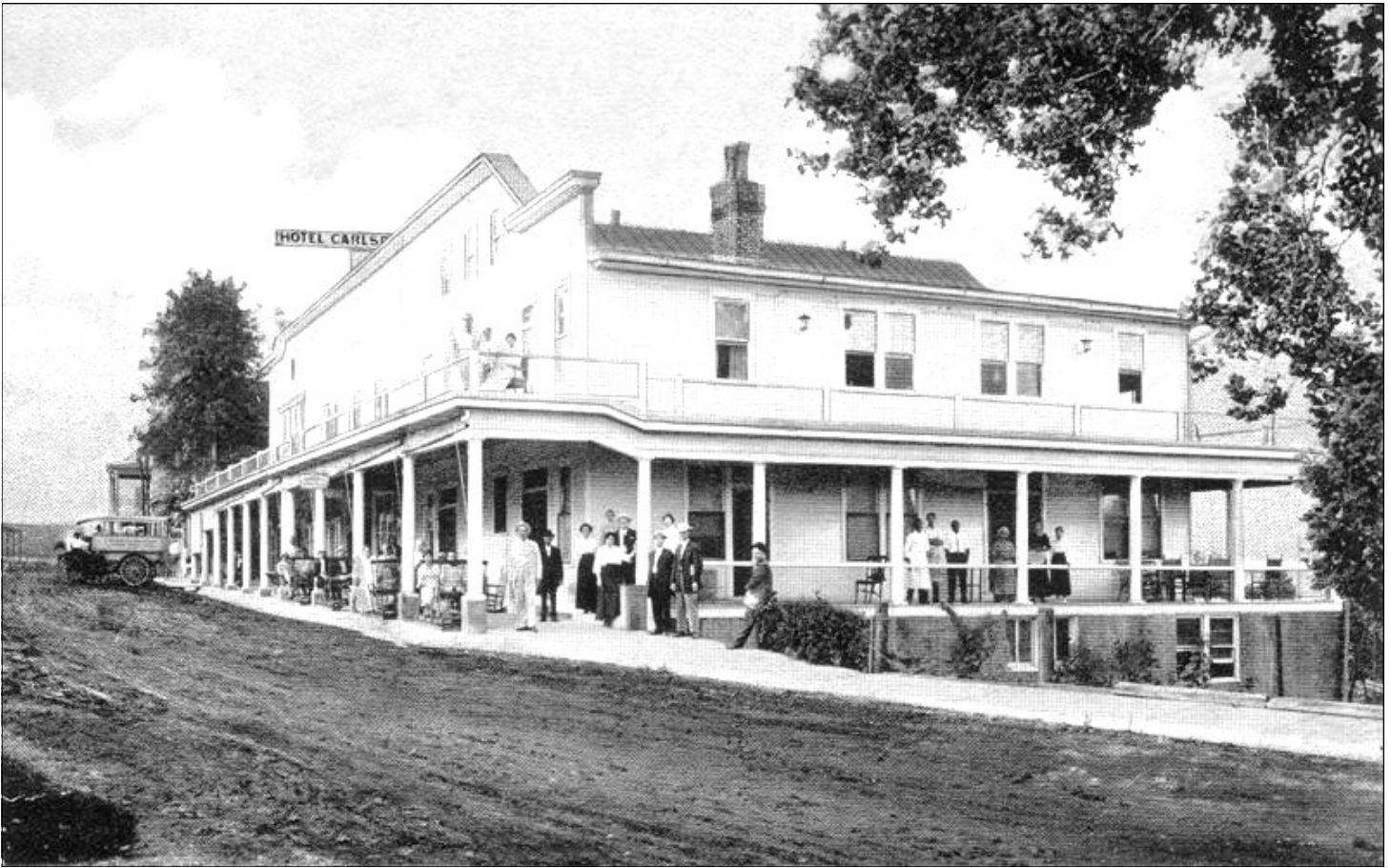
Above: Dry Ridge's famous Carlsbad Springs Hotel—circa 1915.