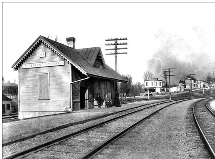
Crescent Springs Depot, circa 1913

In 1898, Crescent Spring Presbyterian Church opened at its present site, 710 Western Reserve, as did in 1913 the Baptist Church at 627 Buttermilk; and in 1916 St. Joseph Catholic Church at