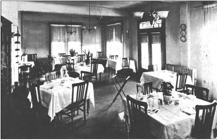
Dinning Room of the Carlsbad