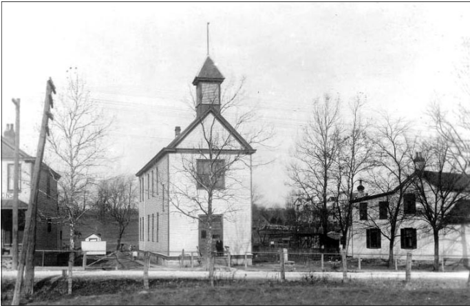
Early Crescent Springs Public School

the Red School House, 805 Buttermilk; and on the other side of the road, Community Park.