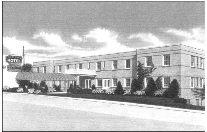
Left: Advertisement postcard for the Carlsbad Mineral Water and Hotel, Circa 1946. Above: The Carlsbad Hotel, circa 1952.