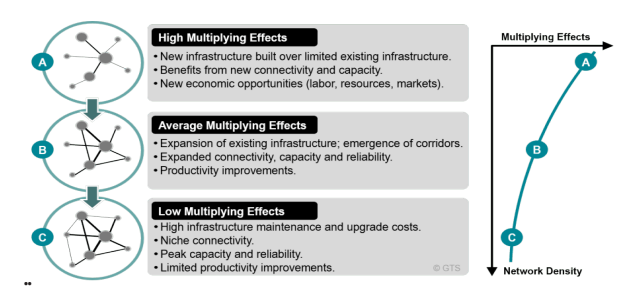
Figure 2. Interdependence of the multiplier effect of investments in the transport and logistics systems of the regions in the context of their impact on GRP

According to Figure 2, the multiplier effect of investments in the transport and logistics systems of the regions in the context of their impact on GRP is divided into high dependence, medium, and low.