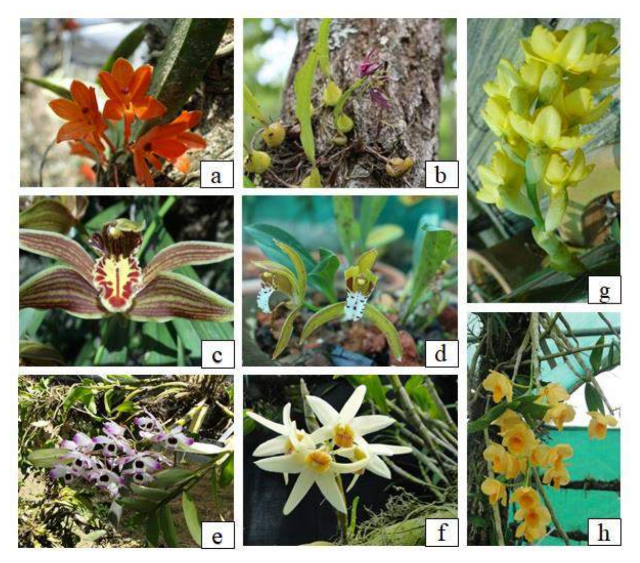
Fig.3. Orchid species from study area:(a) Ascocentrumampullaceum, (b) Ione kipgenii, (c) Cymbidium iridioides, (d) Cymbidium tigrinum, (e) Dendrobium nobile, (f) Dendrobium heterocarpum, (g) Dendrobium densiflorum, (h) Dendrobium fimbriatum