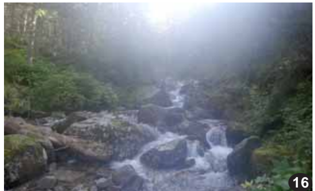
Figs. 10-16. Tardoki-Yani Mt., vegetation at various elevations: 10: southern spurs of the range (1600 m); 11: valley with Betula lanata forest in its bottom (1700 m); 12: Pinus pumila thickets (1700 m); 13 & 15: Betula lanata forest in mountain cirque (1500 m); 14 & 16: coniferous forest ( Abies nephrolepis prevalis) in foothills (600 m); photographs by Dr. V. Barkalov (12-13, 15) and by Mr. A. Ermolenko (10-11, 14, 16).