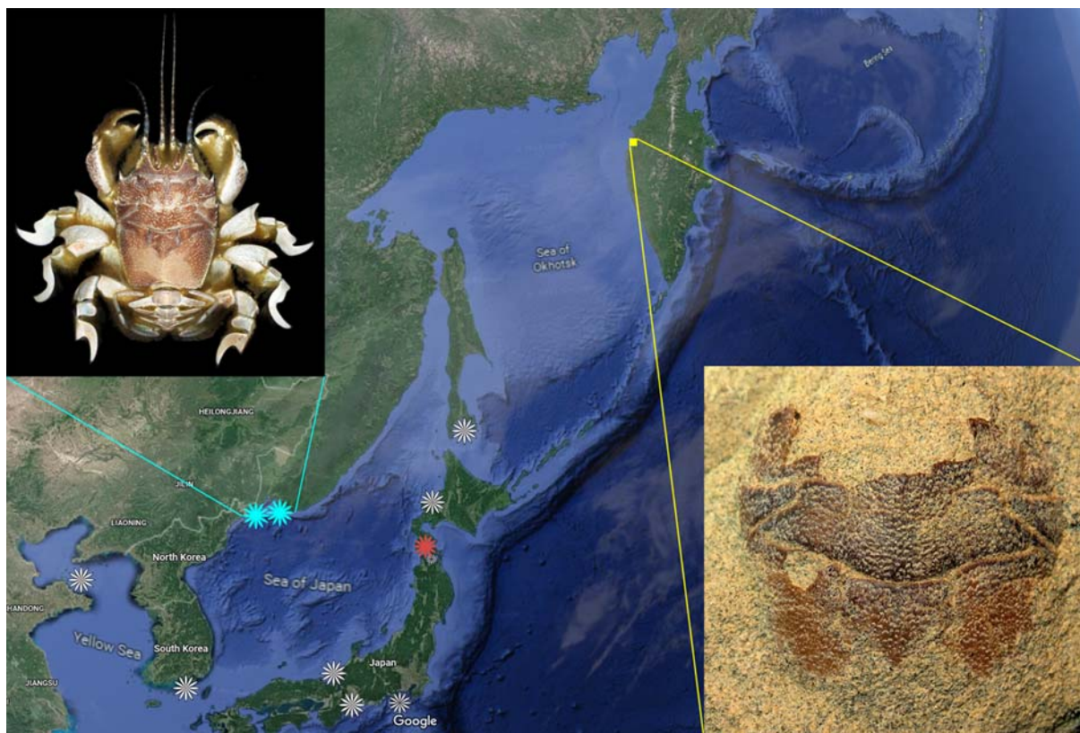
Fig. 1. Map of the modern distribution of the Lophomastix japonica (Duruflé, 1889) and the fossil record of carapace Lophomastix sp. Рис. 1. Карта современного распространения Lophomastix japonica (Duruflé, 1889) и палеонтологическая находка карапакса Lophomastix sp.

the maximum values of biomass for any other group of benthic animals in this area [Selin, 2015a], or approximately 33% of the average total biomass of the entire macrozoobenthos in some biotopes [Selin, 2013]. At the same time, mature individuals of burrowing mud shrimp Upogebia major (De Haan, 1841) (Gebiidea: Upogebiidae) can reach a body length of 118 mm in Peter the Great Bay [Selin, 2017]. Quite often these large and numerous organisms obviously affecting the ecosystem and nearby communities [Hong, 2013]. Accordingly, the search for and study of such animals is extremely important for ecological research of any level of complexity. In the Russian seas, one such cryptobenthic group, which has been well described only recently, are burrowing ghost shrimp ( Nihonotrypaea spp., Gilvossius spp. and Necallianassa truncata (Giard et Bonnier, 1890)) and mud shrimps ( Upogebia spp.), which are numerous in warm regions, such as the Black Sea [Marin, 2021] and the Sea of Japan [Marin, 2010, 2013b; Marin et al. , 2013; Selin, 2013, 2014, 2015a–c, 2017; Marin, Kornienko, 2014; Marin, Antokhina, 2020]. However, other burrowing crustaceans have not been well studied.