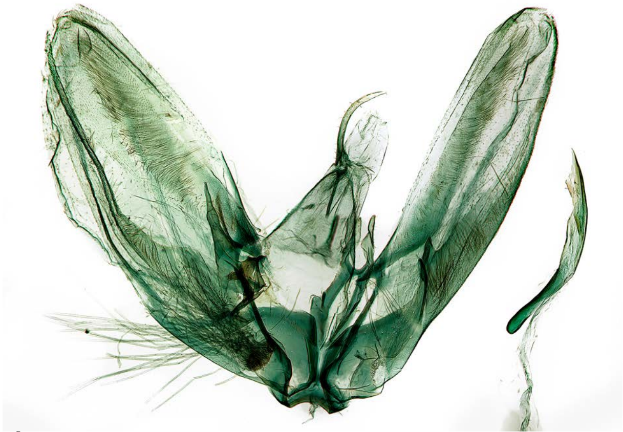
Figs 7–8. Hellinsia vasnetsovi Kovtunovich, Ustjuzhanin et Sinyaev sp.n.: 7 — male, holotype; 8 — male genitalia, holotype (ZISP, gen.pr. Nr.1907).

Рис. 7–8. Hellinsia vasnetsovi Kovtunovich, Ustjuzhanin et Sinyaev sp.n.: 7 — самец, голотип; 8 — гениталии самца, голотип (ZISP, gen.pr. Nr.1907).