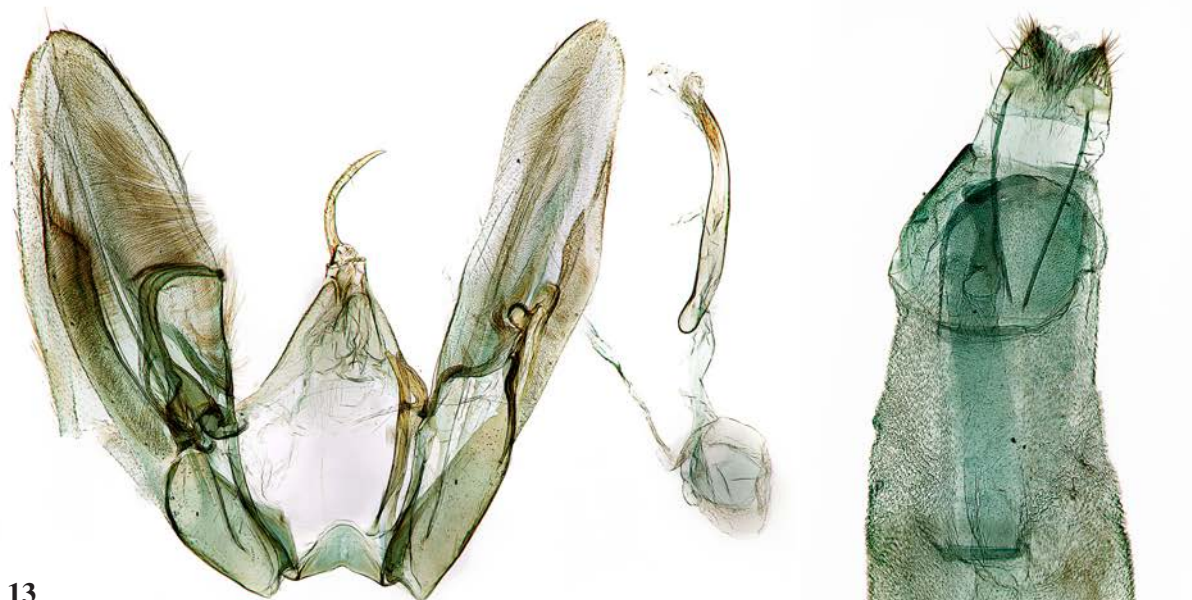
Figs 12–14. Hellinsia repini Kovtunovich, Ustjuzhanin et Sinyaev sp.n. : 12 — male, paratype; 13 — male genitalia, holotype (ZISP, gen.pr. Nr.1910); 14 — female genitalia, paratype (ZISP, gen.pr. Nr.1911).

Рис. 12–14. Hellinsia repini Kovtunovich, Ustjuzhanin et Sinyaev sp.n. : 12 — самец, голотип; 13 — гениталии самца, голотип (ZISP, gen.pr. Nr.1910); 14 — гениталии самки, паратип (ZISP, gen.pr. Nr.1911).