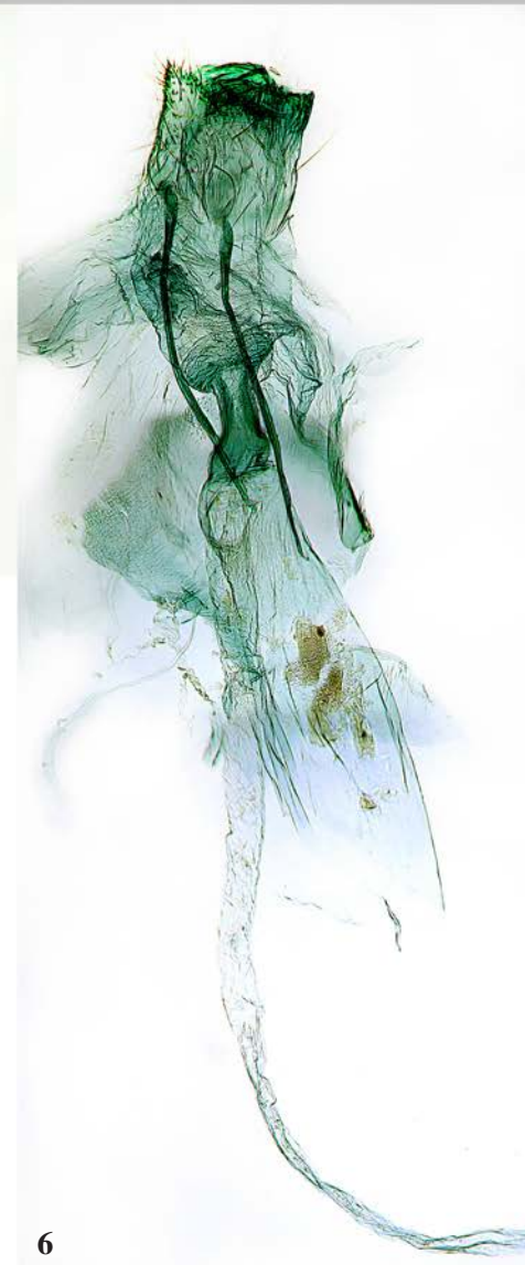
Figs 4–6. Hellinsia shishkini Kovtunovich, Ustjuzhanin et Sinyayev sp.n. : 4 — male, holotype; 5 — male genitalia, holotype (ZISP, gen.pr. Nr.1916); 6 — female genitalia, paratype (ZISP, gen.pr. Nr.1906).

Рис. 4–6. Hellinsia shishkini Kovtunovich, Ustjuzhanin et Sinyayev sp.n. : 4 — самец, голотип; 5 — гениталии самца, голотип (ZISP, gen.pr. Nr.1916); 6 — гениталии самки, паратип (ZISP, gen.pr. Nr.1906).