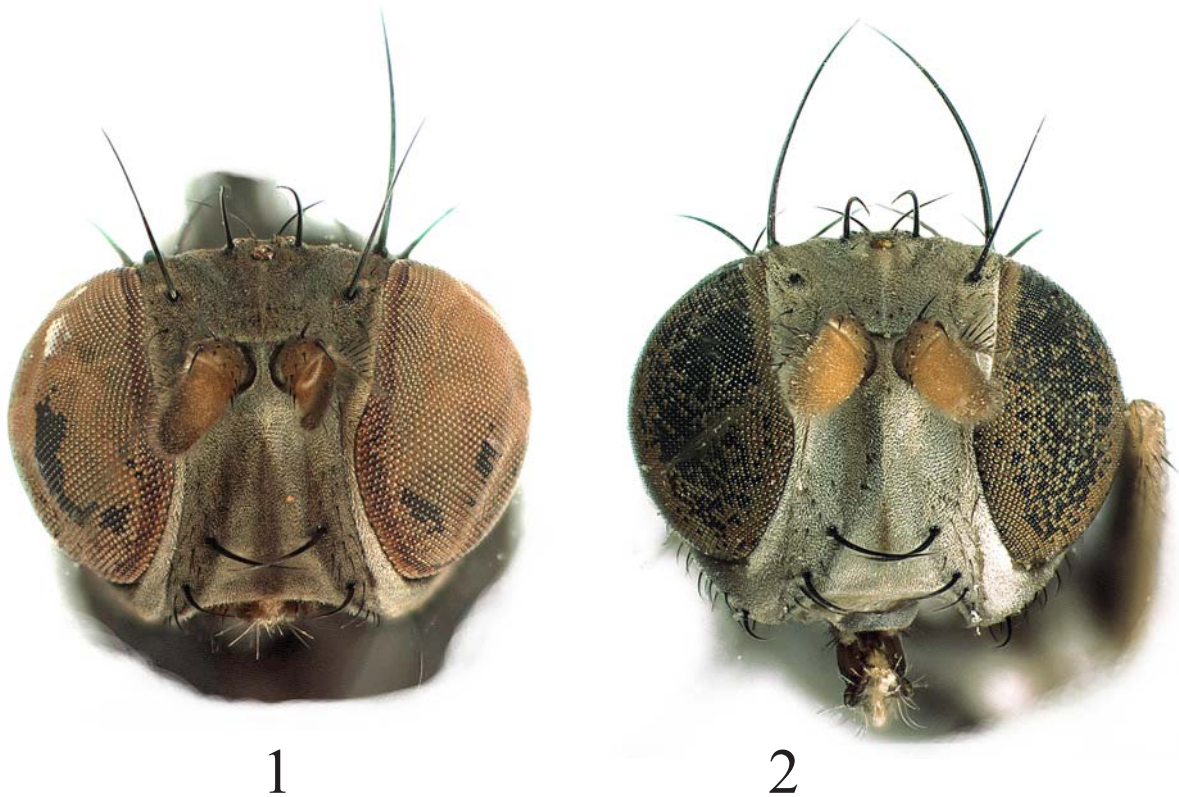
Figs 1–2. Notiphila (Notiphila) obscuripennis sp.n. (1) and N. indistincta Krivosheina, 2001 (2), head, anterior view. Рис. 1–2. Notiphila (Notiphila) obscuripennis sp.n. (1) и N. indistincta Krivosheina, 2001 (2), голова, спереди.