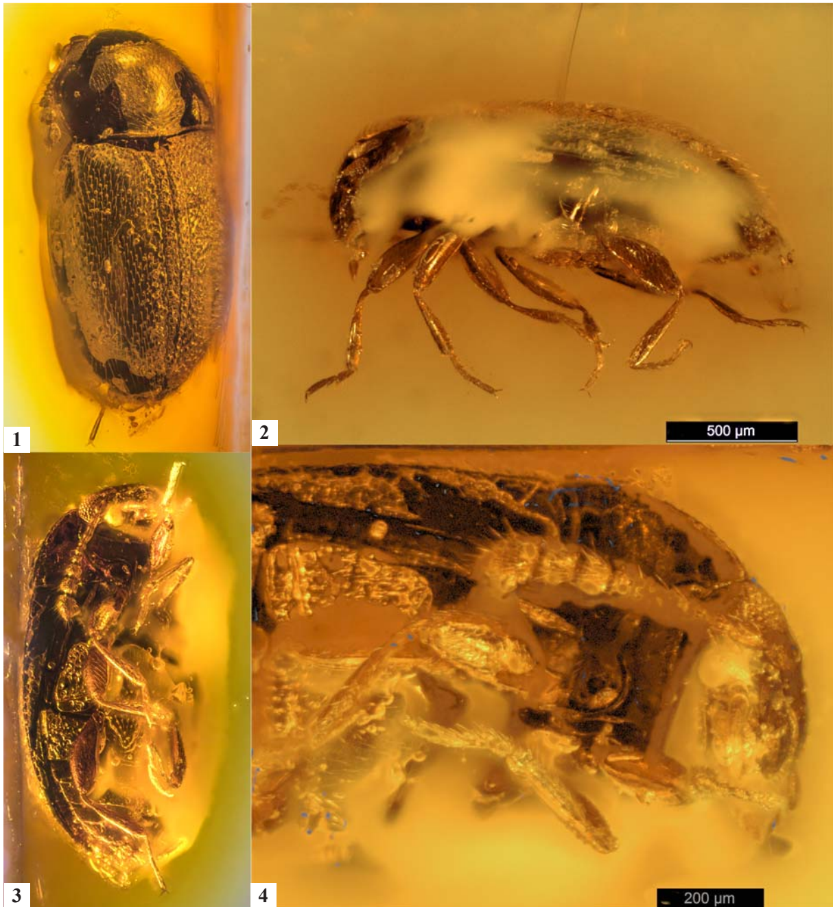
Figs 1–4. Photo of a new specimen of M. sarnensis from Baltic amber: 1 — dorsal view; 2 — lateral view; 3 — ventral view; 4 — head and pronotum, ventrolateral view.

Pronotum convex, not narrowed basally, slightly transverse, 1.2–1.5 times broader than long, broadest before the middle, moderately strongly and very densely punctured (distance between punctures equal to their diameter), a single puncture smaller than the diameter of the eye facet. Pubescence long and elevated. Sides finely margined, anterior edge