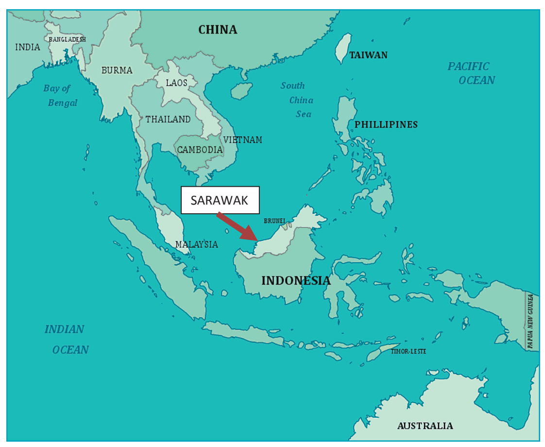
Fig. 1: Map shows the location of Sarawak, Malaysia

talang Islands are recorded as areas for marine turtle nests.