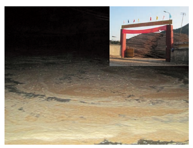
Fig. 3. Waste water releasing directly to the Ba Che River at station 2 (see Fig. 1) from Ba Che Paper Factory (smaller picture). Photos by Tran, at 9 pm, 19 February 2011.

Forest coverage is still high in the present area, but a greater area is covered by artificial forest as in other