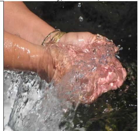
Waters of 'Āao, Maui...