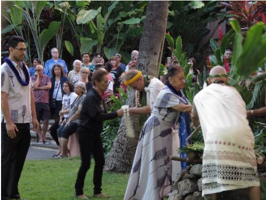
A special sharing of Ho'okupu at the Royal Hawaiian Coconut Grove as the Hawaiian Civic Clubs began celebration of the 2019 Makahiki...