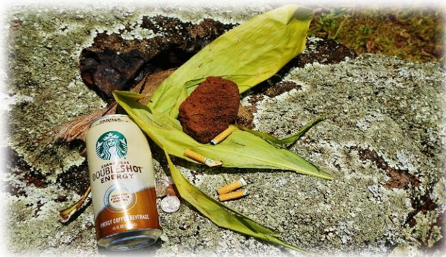
Auwē! Auwē, Auwē!

butts, soft drink cans, and coins are often left behind. Every so often, inappropriately, small pohaku of unknown origins are wrapped in ti - leaf and left hidden in places within the areas of posted "No Public Access" signs.