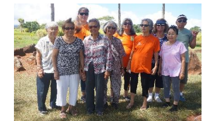
Wahiawā Lanakila Seniors 2k19