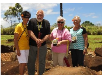
Maui Kūpuna Makua 2k15