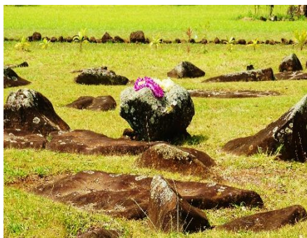
Mahalo Kūpuna for your visit with us today!