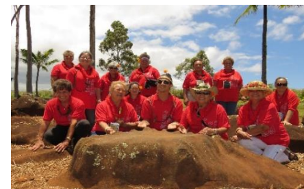
Moku o Keawe Kūpuna Makua 2k15