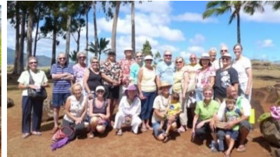
Hale'iwa Seniors 2k12