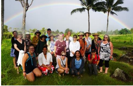
Mokulē'ia Writers Retreat 2k18