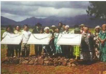
HCCW Y2K Kukaniloko Sign Installation