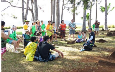
Waialua-Wahiawā Hawaiian Civic Clubs 2k13