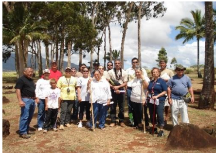
OHA Kūpuna Council 2k10