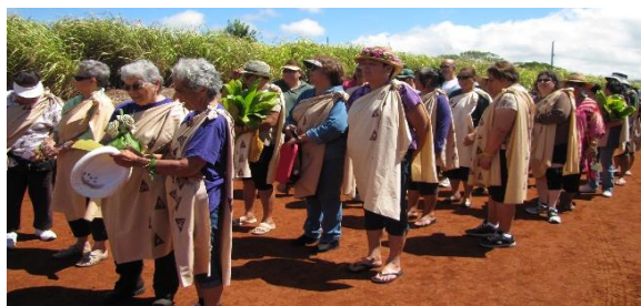
Kūpuna Makua at Kūkaniloko 2k13