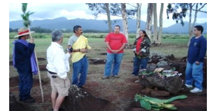
Waianae Kai Kūpuna 2k9