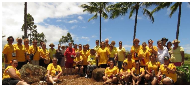
O'ahu Kūpuna Makua 2k15