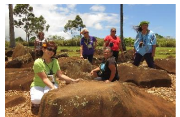
Kauai Kūpuna Makua 2k15