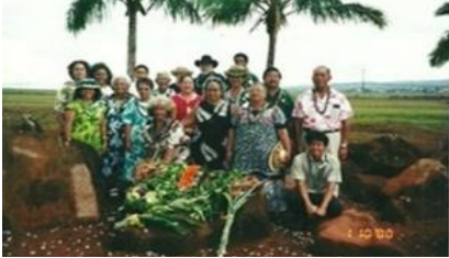
HCCW Kūpuna Y2K

Honoring our Kūpuna for their wisdom and knowledge passed down to us . . .