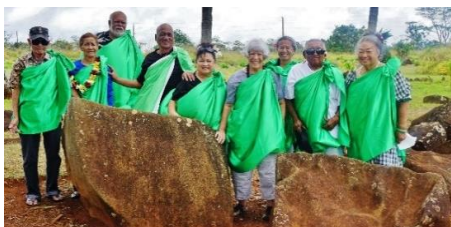
HCCW Kūpuna at Kūkaniloko 2k15