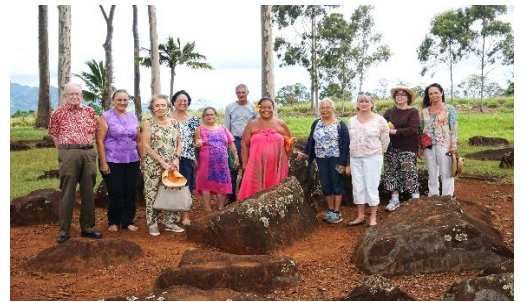
Daughters of Hawaii 06.21.2k16 Summer Solstice