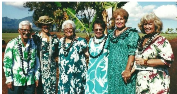
Hawaiian Civic Club of Wahiawā Kūpuna Y2K