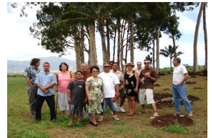
Ewa Beach Kūpuna 2k8