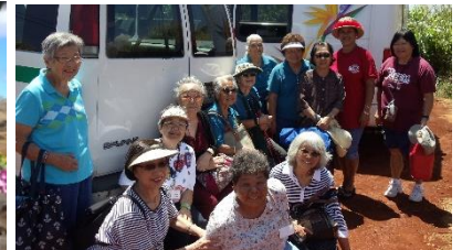
Whitmore Seniors 2k12