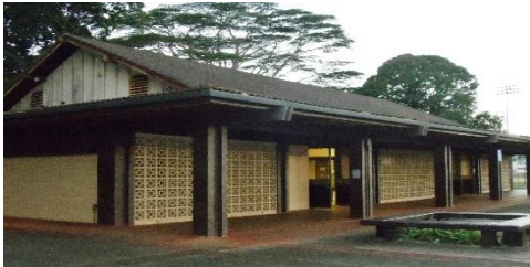
Hale Ho‘okipa - Wahiawā District Park