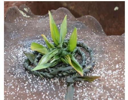
E pule kākou... Healing begins.