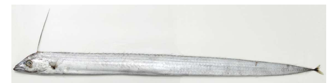
Figure 1. Fresh specimen of Evoxymetopon poeyi collected from Sagami Bay, Kanagawa Prefecture, Japan (NSMT-P 143553, 1460 mm standard length).

Japan); Nakabo and Doiuchi 2013: 1645, unnumbered fig. [Japan (Omaezaki, Shizuoka Prefecture; Miwasaki, Wakayama Prefecture; Cape Muroto, Kochi Prefecture; Okinawa-jima Island; upper part of continental slope in East China Sea; Kyushu-Palau Ridge); Taiwan; Mauritius]; Fricke et al. 2014: 296, table 1 (Ryukyu Islands, Japan and Donggang, Taiwan); Chiang et al. 2014: 292, unnumbered fig. (eastern coast of Taiwan); Ikeda and Nakabo 2015: 506, pl. 223-2 (Shirahama and Kii Channel, Wakayama Prefecture, Japan); Hata et al. 2016: 321, fig. 1 (Yoron-jima Island, north of Tanega-shima Island, and mouth of Kagoshima Bay, Kagoshima Prefecture, Japan); Izawa 2016: 826 (off Cape Muroto, Kochi Prefecture, Japan); Hata 2017: 260, unnumbered fig. (Kagoshima Bay, Kagoshima Prefecture, Japan); Koeda and Ho 2017: 97, figs. 1, 2 (upper) (Kenting, southwestern part of Taiwan); Nakae et al. 2018: 334 (Naze, Amamioshima Island, Amami Islands, Japan); Okamoto 2019: 397, unnumbered fig. (Amami-oshima Island, Amami Islands, Japan); Nokamoto 2019: 397, unnumbered fig. (Amami-oshima Island, Amami Islands, Japan); Koeda 2019: 1166, unnumbered figs. (Kenting, southwestern part of Taiwan); Fabres 2020: 160 (Rapa Nui); Shimose 2021: 157, fig. E (Yaeyama Islands, Ryukyu Archipelago, Japan).