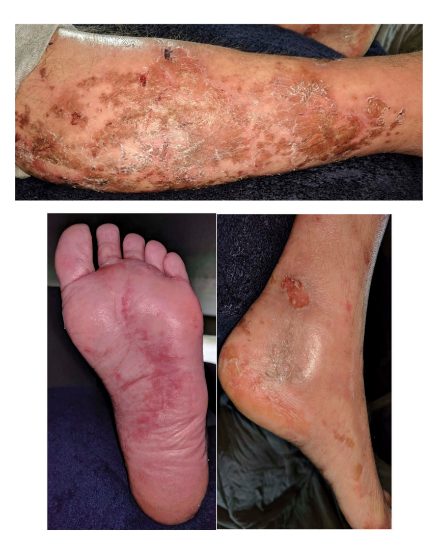
Figure 1. Affected area of the skin showed desquamation, erythema, and ulceration in lower extremities and sole.

showed a large, heterogenously enhancing mid to distal pancreatic mass measuring 9.4 \times 3.8 cm with surrounding low-attenuation soft tissue thickening (Figure 2). Tumor marker, CA 19–9 was 2.0 (reference range < 35 U/ml); however, glucagon was elevated to 2,178 (normal < 80 pg/dl). Prolactin, T4, and TSH levels were within normal range. Hemoglobin and hematocrit were low at 12.2 (reference range 13.5–16.5 gm/dl) and 36.1 (reference range 40–50%), respectively. Liver enzymes were within normal limit. There was no leukocytosis or fever, indicating cellulitis less likely.