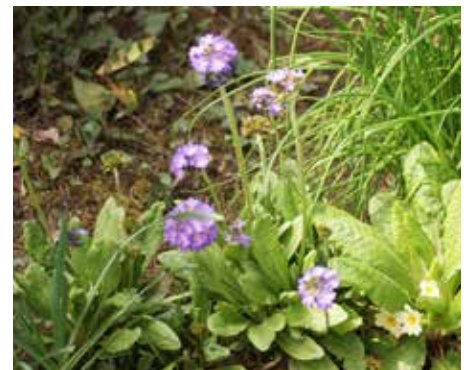
Primula denticulata Drumstick Primrose