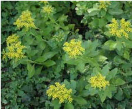
Sedum takesimense Stonecrop