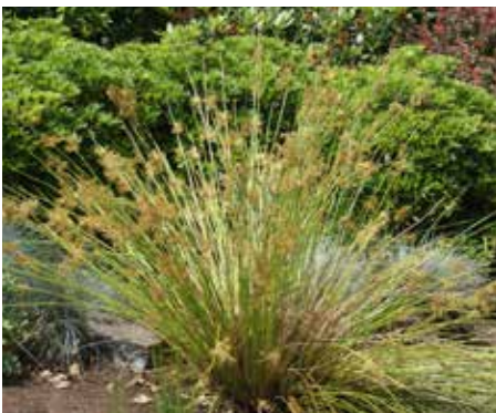
Juncus effusus Common Rush