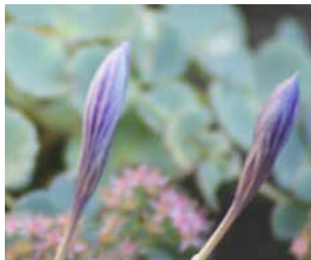
Crocus cartwrightianus Wild Safron