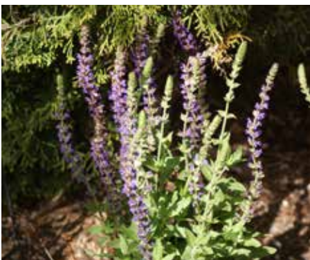
Salvia nemorosa Woodland Sage