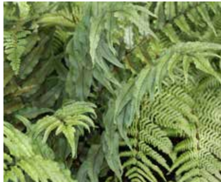
Cyrtomium fortunei Japanese Holly Fern