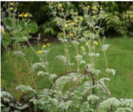
Potentilla gelida Caucasian Cinquefoil