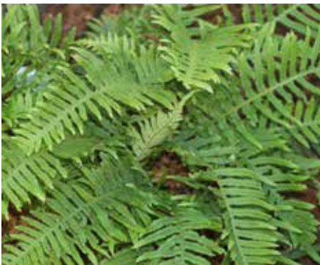
Polypodium glycyrrhiza Licorice Fern