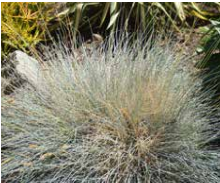
Festuca glauca 'Elijah Blue' Blue Fescue