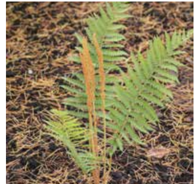
Osmunda cinnamomea Cinnamon Fern