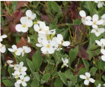
Arabis caucasia Caucasian Rockcress