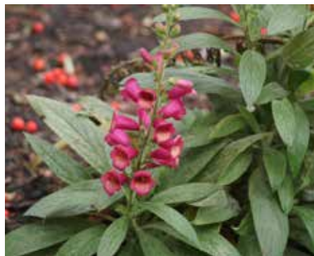
x Digiplexus 'Flame' Hybrid Foxglove