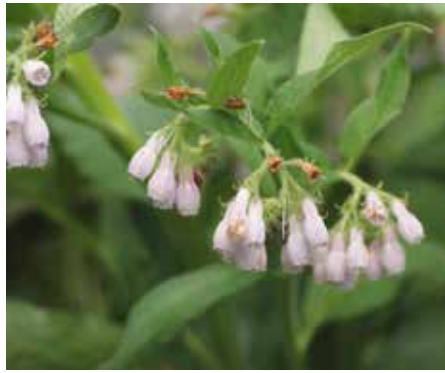
Symphytum officinale Comfrey