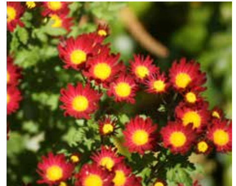
Chrysanthemum morifolium cv