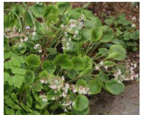
Saxifraga x geum 'Dentata'