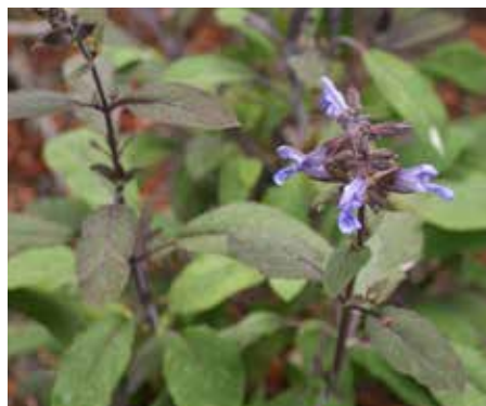
Salvia officinalis Common Sage (This one is the cooking herb)