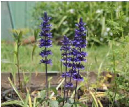
Salvia 'Balsalmisp' Mystic Spires Blue Sage