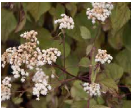
Eupatorium rugosum Snakeroot