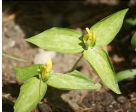
Trillium luteum Yellow Trillium