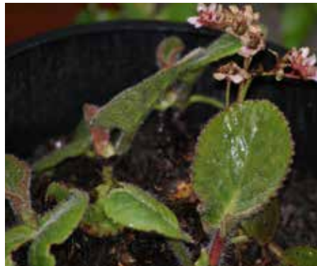
Bergenia ciliata Hairy Bergenia