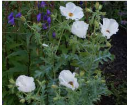
Argemone polyanthemos Crested Pricklypoppy