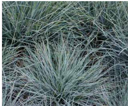
Festuca idahoensis 'Siskiyou Blue' Idaho Blue Fescue