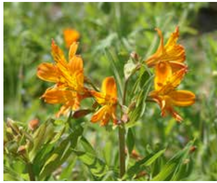
Alstroemeria cv Peruvian Lily