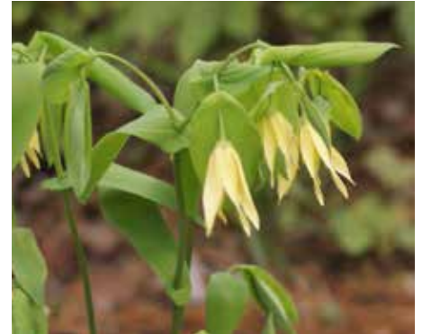
Uvularia grandiflora Bellwort