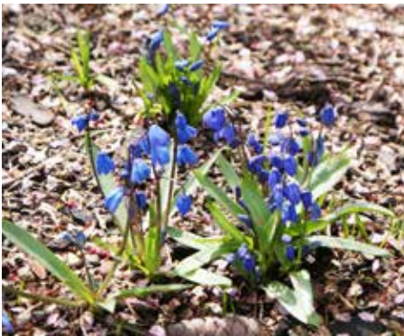
Scilla siberica Siberian Squill