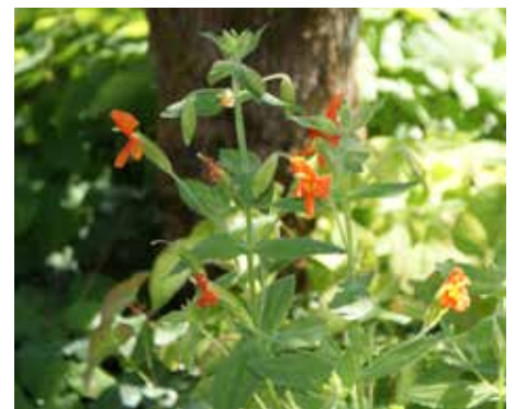
Mimulus cardinalis Monkeyflower