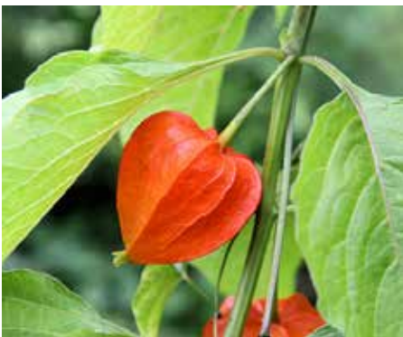
Physalis alkekengi Chinese Lantern