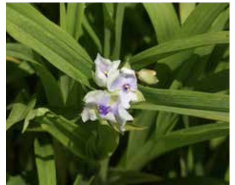
Tradescantia virginiana Spiderwort