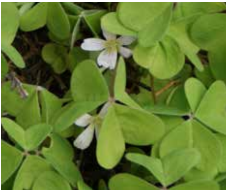
Oxalis oregana Wool Sorrel