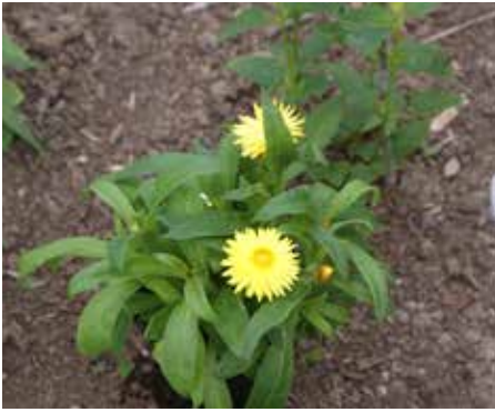
Bracteantha bracteata Strawflower