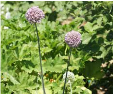
Allium ampeloprasum v porum Leek