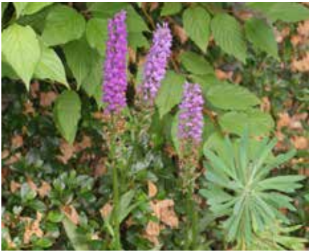
Dactylorhiza sp Spotted Orchid