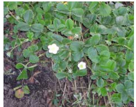
Fragaria chiloensis Sand Strawberry