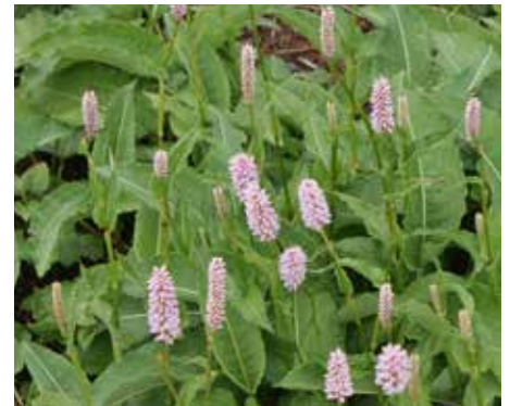
Persicaria bistorta European Bistort