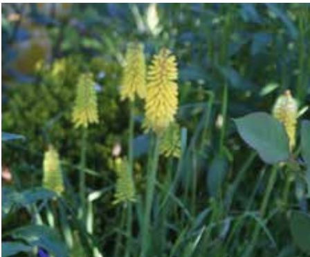
Kniphofia pumila Dwarf Red Hot Poker