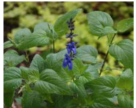
Salvia guaranitica Blue Anise Sage