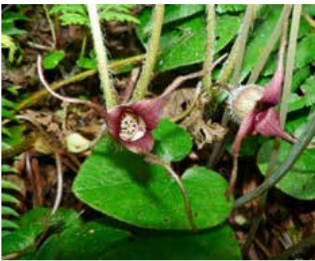
Asarum caudatum Wild Ginger