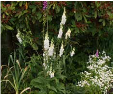
Digitalis purpurea 'Alba' Common Foxglove