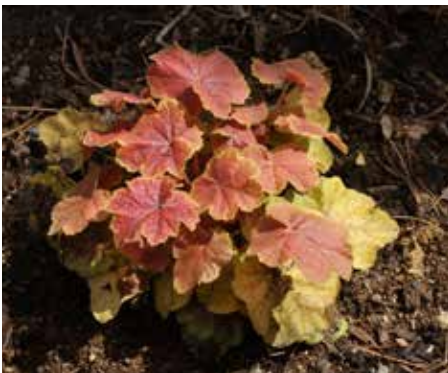
Heuchera x villosa 'Tiramisu'