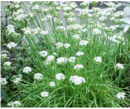
Allium tuberosum Garlic Chives