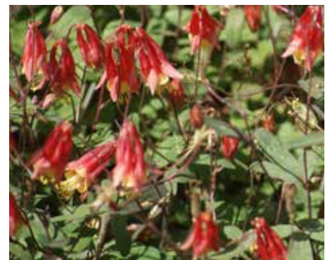
Aquilegia canadensis Canadian Columbine