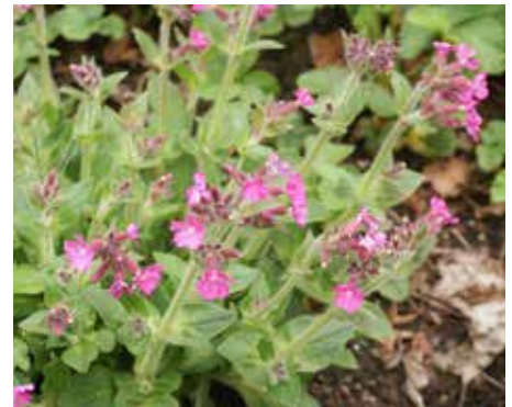
Silene dioica Red Campion