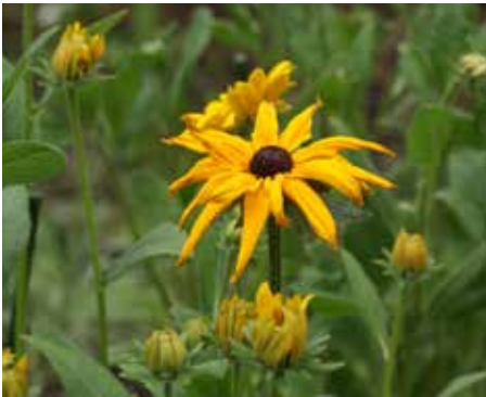
Rudbeckia hirta Black-eyed Susan