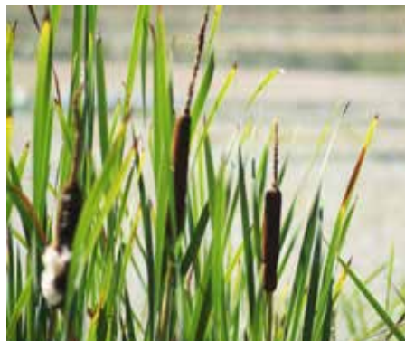
Typha latifolia Cattail