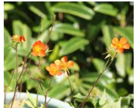
Geum coccineum Scarlet Avens