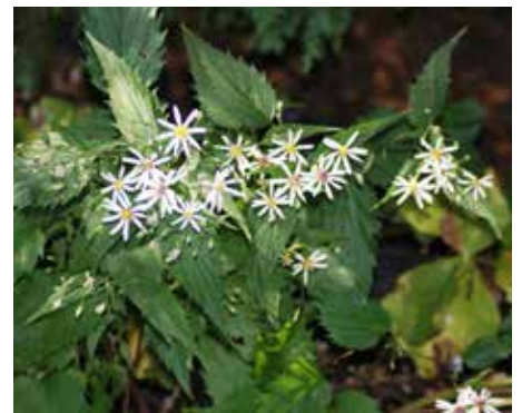
Aster divaricatus Wood Aster