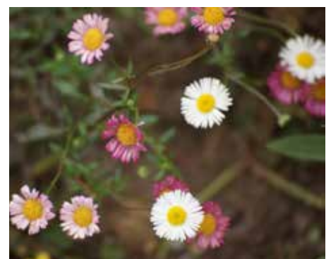
Erigeron karvinskianus Fleabane