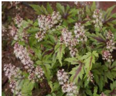
Tiarella 'Cygnet' Foamflower