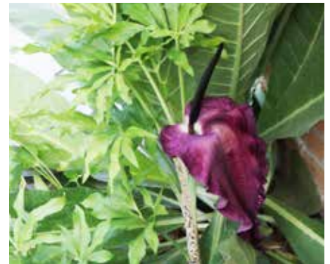
Dracunculus vulgaris Voodoo Lily