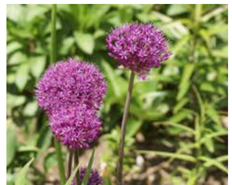
Allium aflatanense 'Purple Sensation' Persian Onion