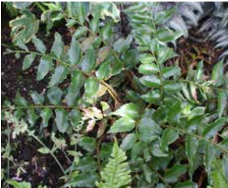
Cyrtomium falcatum Japanese Holly Fern