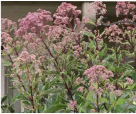
Eutrochium purpureum Joe Pye Weed