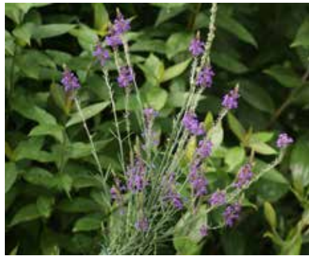
Perovskia atriplicifolia Russian Sage