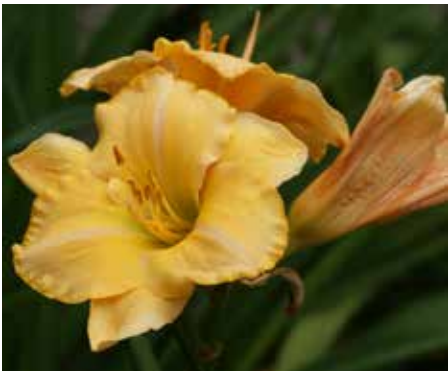
Hemerocallis 'Peachy Keen' Hybrid Daylily