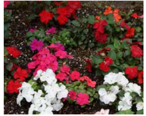
Impatiens walleriana Busy Lizzie