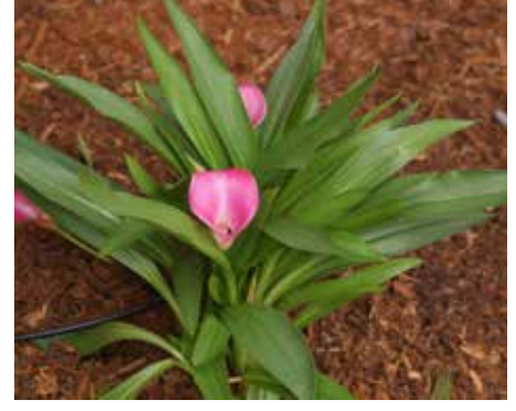
Zantedeschia rehmannii Pink Calla Lily