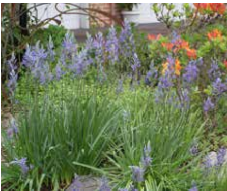
Camassia cusickii Cussick's Camas