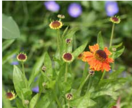
Helenium 'Sahin's Early' Sneezeweed