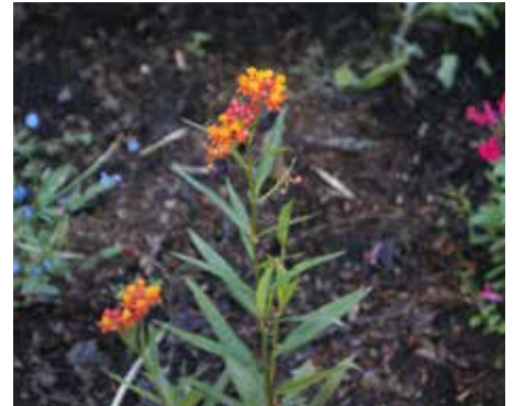
Asclepias curassavica Tropical Milkweed