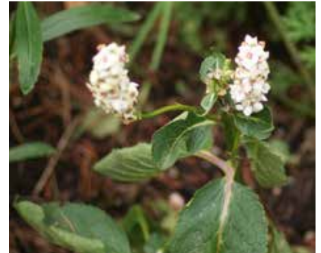
Verbascum chaixii 'Album' Nettle-Leaved Mullein