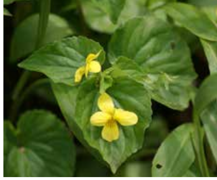
Viola glabella Stream Violet