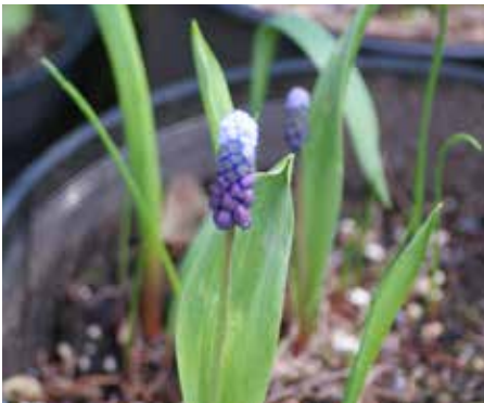
Muscari latifolium Grape Hyacinth