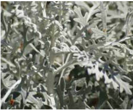
Senecio cineraria Dusty Miller