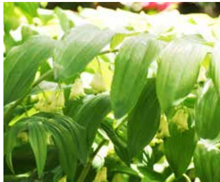
Polygonatum commutatum Solomon's Seal