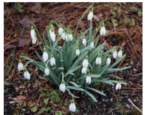
Galanthus nivalis Snowdrop