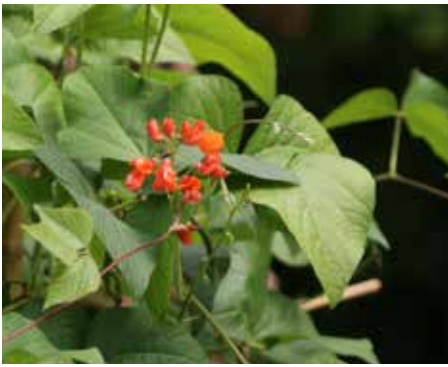
Phaseolus coccineus Scarlet Runner Bean