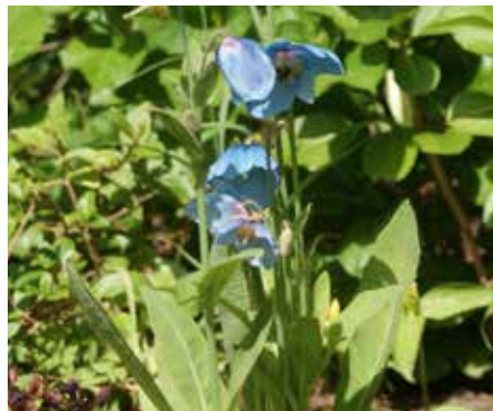
Meconopsis x sheldonii Himalayan Poppy