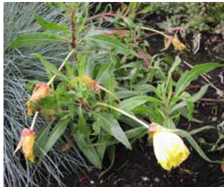
Oenothera sp Evening Primrose