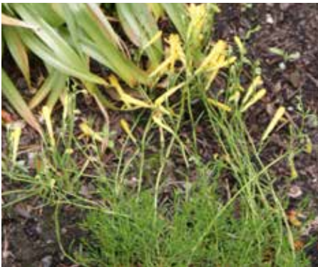
Penstemon pinifolius Yellow Pineleaf Beardtongue