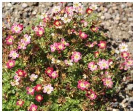
Saxifraga 'Apple Blossom'