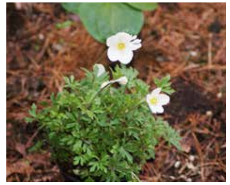
Anemone sylvestris Snowdrop Anemone