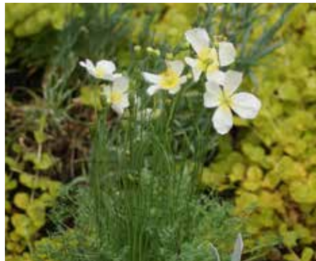
Papaver alpinum Alpine Poppy