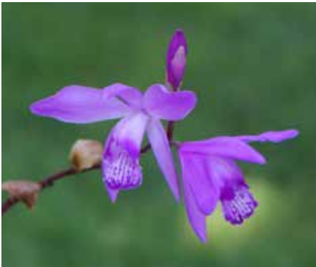
Bletilla striata Chinese Ground Orchid