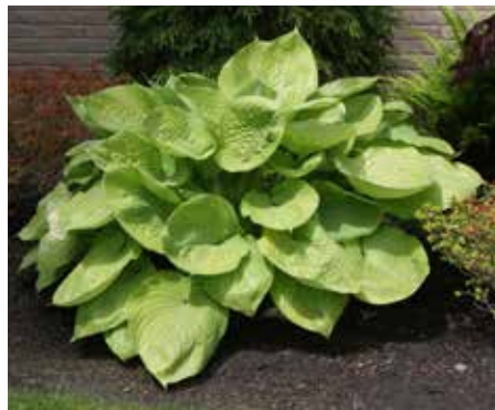
Hosta hybrid 'Sum and Substance' Plantain Lily