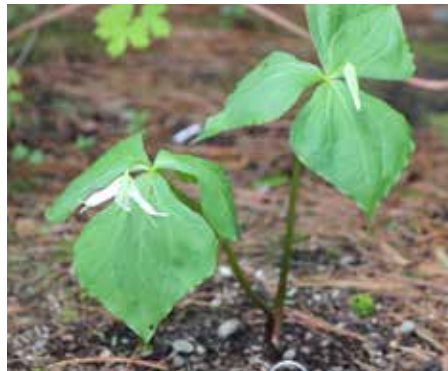
Trillium simile Jeweled Wakerobin