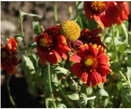
Gaillardia aristata Blanket Flower