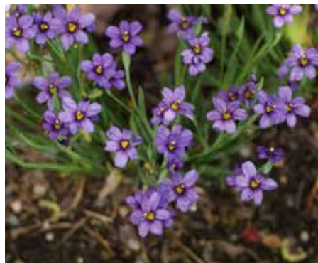
Sisyrinchium bellum Blue-eyed Grass