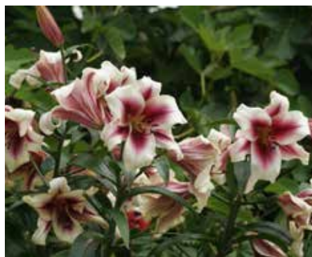
Lilium Oreinpet Hybrid