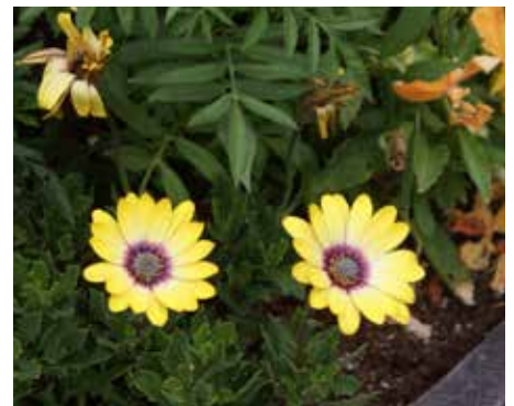
Osteospermum hybrid African Daisy