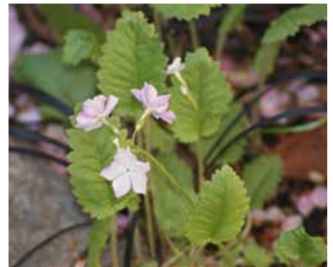
Primula sieboldii Japanese primrose