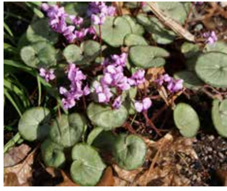
Cyclamen coum Hardy Cyclamen