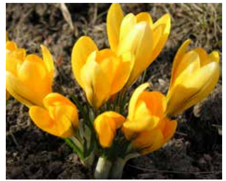
Crocus flavus Golden Crocus