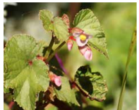
Begonia grandis ssp. evansiana Hardy Begonia