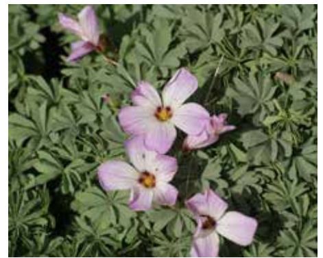
Oxalis adenophylla Chilean Wood Sorrel