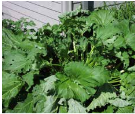
Rheum x cultorum Rhubarb