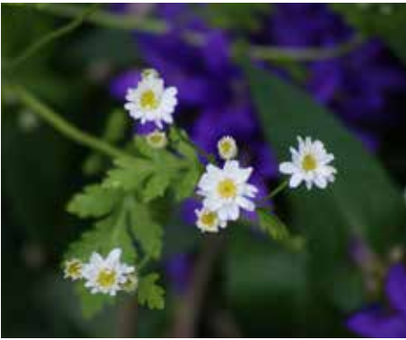
Tanacetum parthenium Feverfew