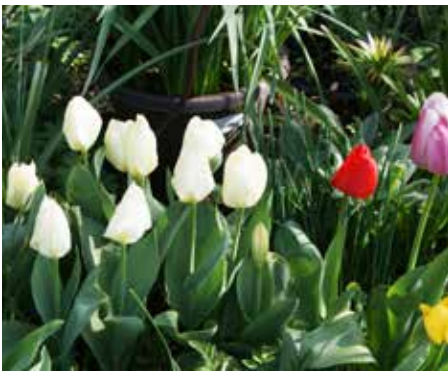
Tulipa Cvs Hybrid Tulips