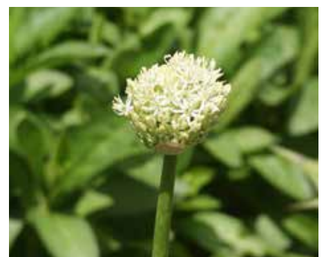
Allium stipitatum Drumstick Onion