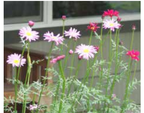
Tanacetum coccineum Painted Daisy