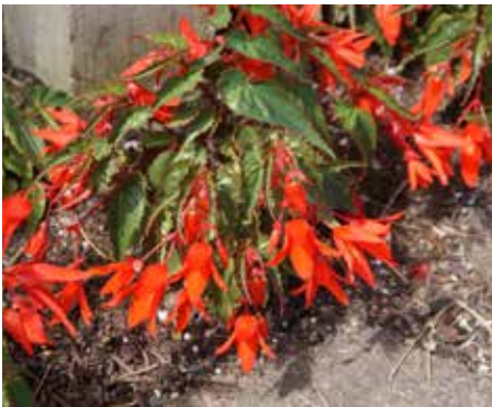
Begonia boliviensis Bolivian Begonia