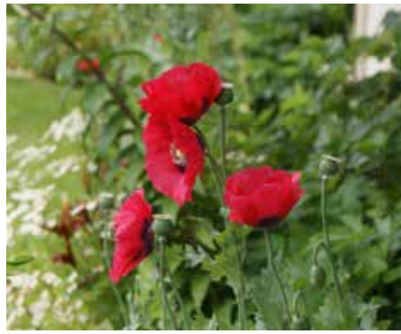
Papaver somniferum Opium