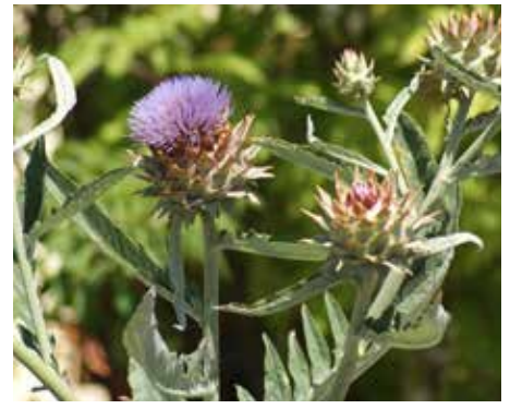
Cynara cardunculus var. scolymus Artichoke