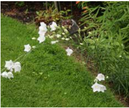
Campanula persicifolia 'Alba' Peach-Leaved Bellflower