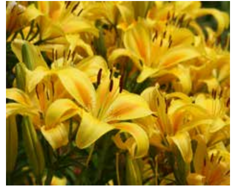
Lilium Asiatic Hybrid