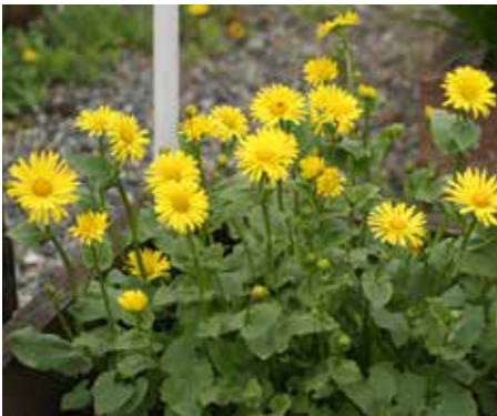
Doronicum orientale Leopard's Bane