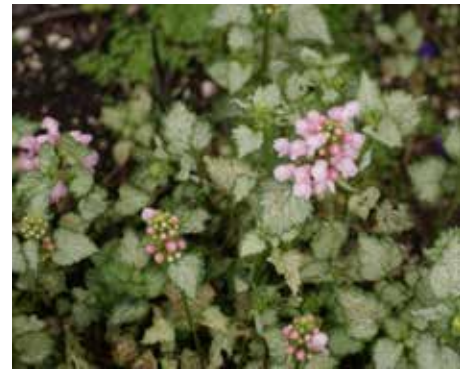
Lamium maculatum Spotted Deadnettle