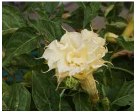
Datura metel Devil's Trumpet