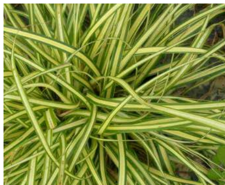
Carex oshimensis 'Evergold' Golden Sedge