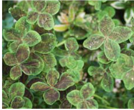
Trifolium repens 'Purpurascens Quadrifolium'