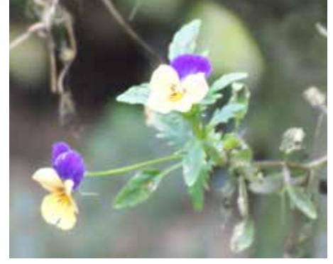
Viola tricolor Johnny Jump-Up