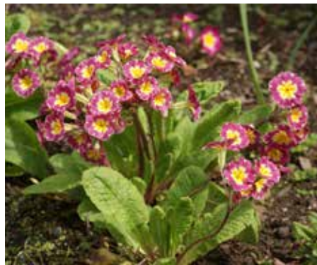
Primula x polyantha Polyanthus Primrose