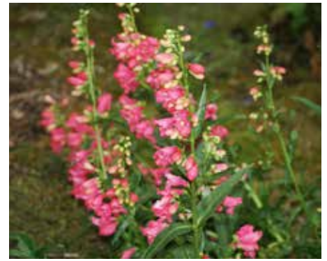
Penstemon hybrid 'Pink Chablis' Beard-tongue