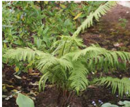
Matteuccia struthiopteris Ostrich Fern