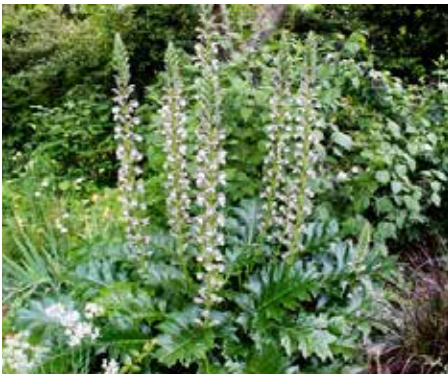
Acanthus mollis Bear's Breeches