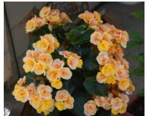
Begonia x hiemalis Elatior Begonia