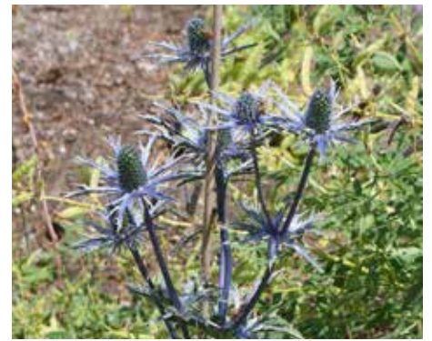
Eryngium planum Sea Holly