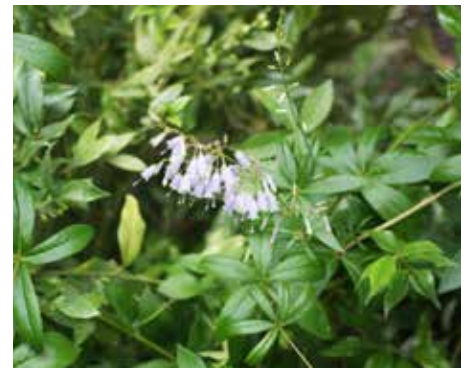
Adenophora liliifolia Ladybells