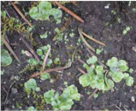
Marchantia polymorpha Liverwort