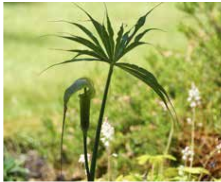
Arisaema consanguineum Jack in the Pulpit