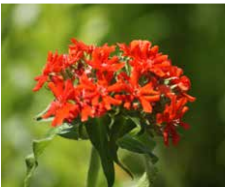
Lychnis chalcedonica Maltese Cross