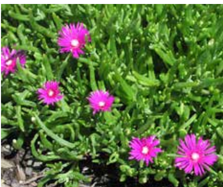
Delosperma cooperi Ice Plant