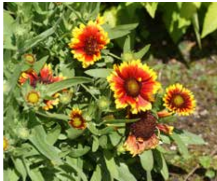
Gaillardia x grandiflora Blanket Flower