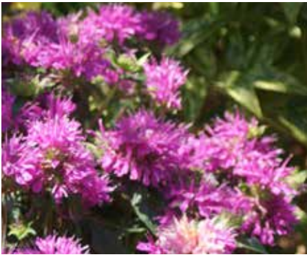
Monarda didyma Bee Balm