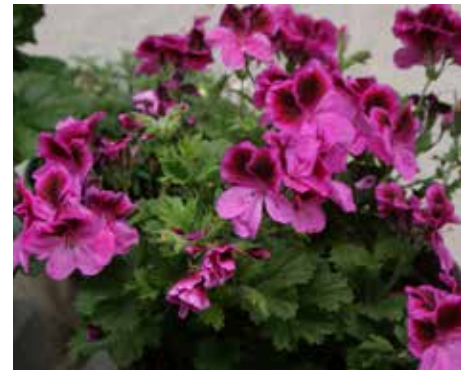
Pelargonium grandiflorum Martha Washington Geranium