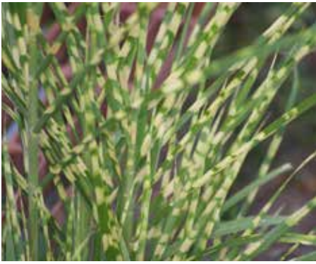
Miscanthus sinensis 'Little Zebra' Zebra Grass