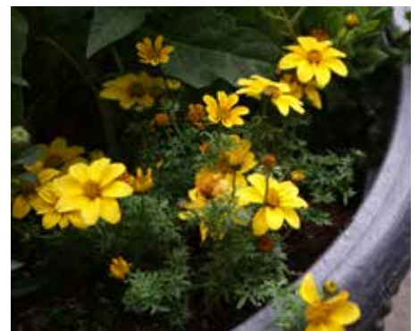
Bidens ferulifolia Apache Beggarticks