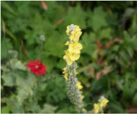
Verbascum thapsus Common Mullein