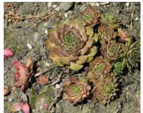
Sempervivum 'Watermelon Rind' Hen and Chicks