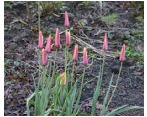
Tulipa clusiana var. chrysantha Lady Tulip