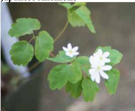
Anemonella thalictroides Rue Anemone