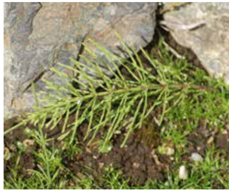
Equisetum arvense Horsetail