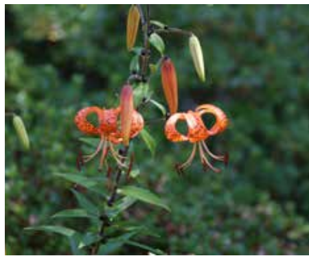
Lilium lancifolium Tiger Lily