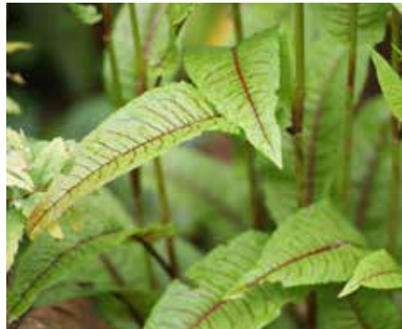
Rumex sanguineus var. sanguineus Bloody Dock