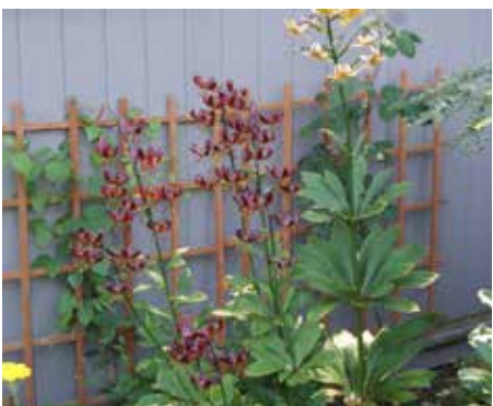
Lilium martagon Turk's Cap Lily