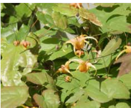
Epimedium 'Amber Queen' Barrenwort