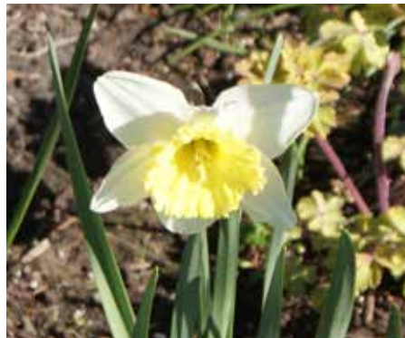
Narcissus Division 2: Large Cup