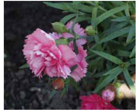
Dianthus caryophyllus Carnation