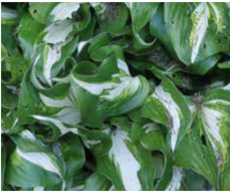
Hosta undulata 'Medio-variegata' Plantain Lily