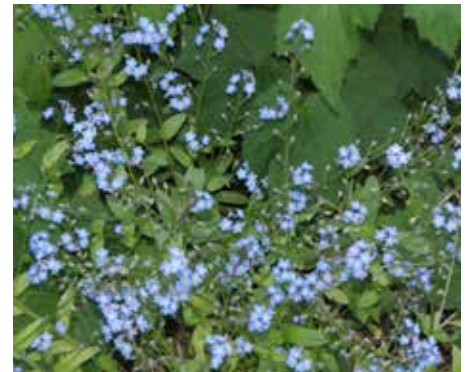
Myosotis sylvatica Forget Me Not