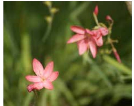
Schizostylis coccinea Crimson Flag