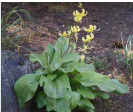
Erythronium tuolumnense Tuolumne Fawn Lily