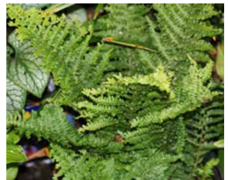
Dryopteris filix-mas 'Cristata' Crested Male Fern