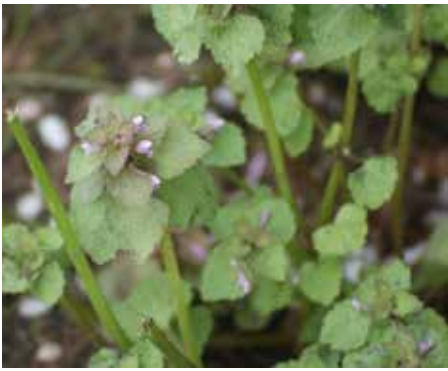
Lamium purpureum Red Deadnettle