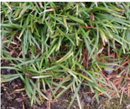
Ophiopogon japonicus 'Nana' Dwarf Mondo Grass