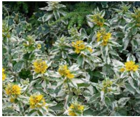
Lysimachia punctata 'Alexander' Variegated Yellow Loosestrife