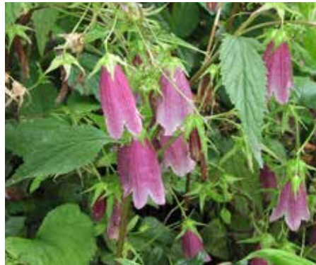
Campanula takesimana Korean Bellflower