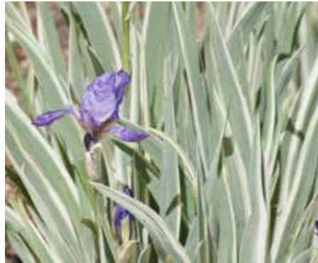
Iris pallida 'Variegata' Dalmatian Iris