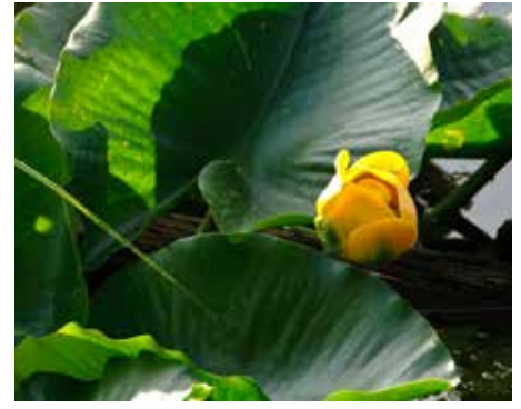
Nuphar polysepala Yellow Pond Lily