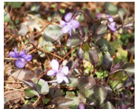
Viola riviniana purpurea Dog Violet