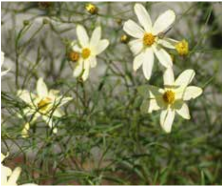
Coreopsis verticillata Threadleaf Tickseed