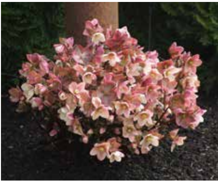
Helleborus x ballardiae 'Pink Frost' Christmas Rose