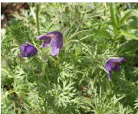
Pulsatilla vulgaris Pasque Flower