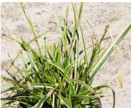
Carex morrowii 'Ice Dance' Japanese Sedge