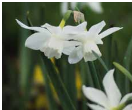
Narcissus Division 5: Triandrus