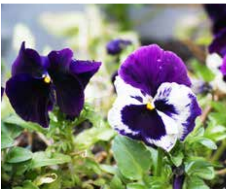
Viola × wittrockiana Pansy