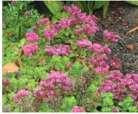
Sedum spurium Stonecrop