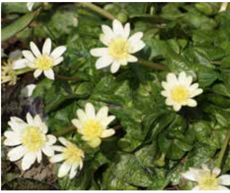
Ranunculus ficaria Lesser Celandine