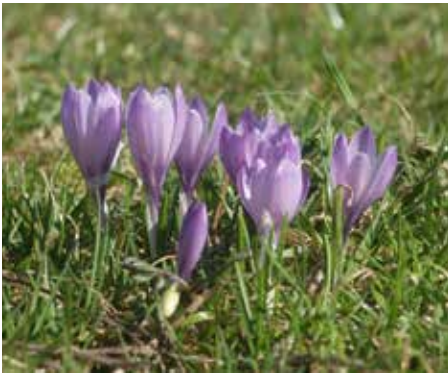
Crocus vernus Dutch Crocus