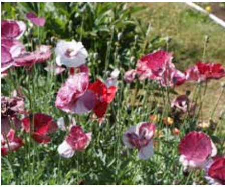
Papaver rhoeas Shirley Poppy