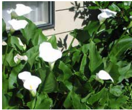
Zantedeschia aethiopic Calla Lily