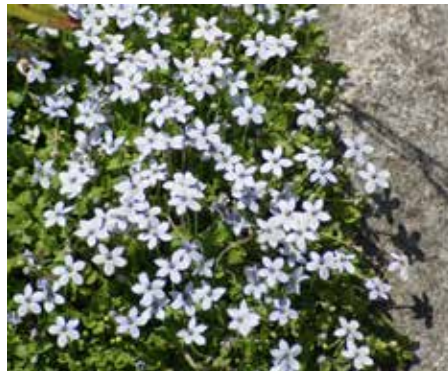
Laurentia fluviatilis Blue Star Creeper