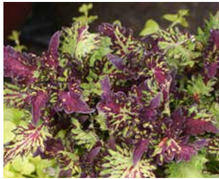
Plectranthus scutellarioides Coleus