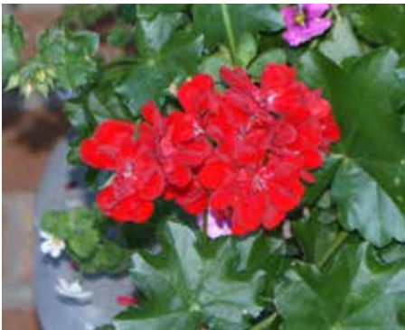
Pelargonium peltatum Ivy Geranium