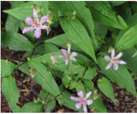
Tricyrtis sp Toad Lily