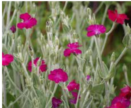
Silene coronaria Rose Campion