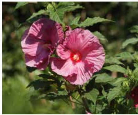
Hibiscus moscheutos Rose Mallow