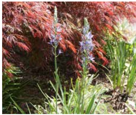
Camassia leichtlinii Large Camas