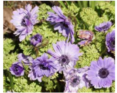
Anemone coronaria Poppy Anemone