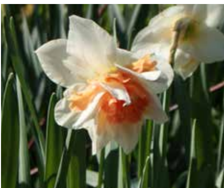
Narcissus Division 4: Double