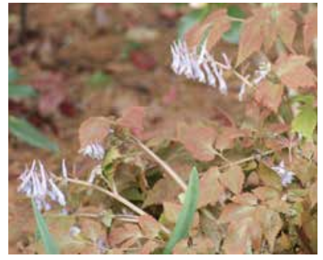
Corydalis flexuosa 'Purple Leaf'