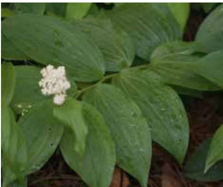
Maianthemum racemosum False Solomon's Seal