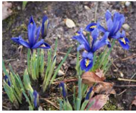
Iris reticulata Reticulated Iris