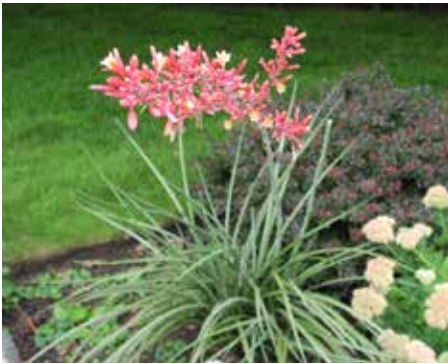
Hesperaloe parviflora Red Yucca