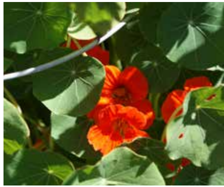
Tropaeolum majus Nasturtium