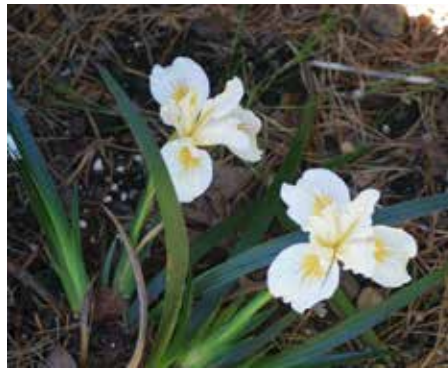
Iris douglasiana Douglas Iris