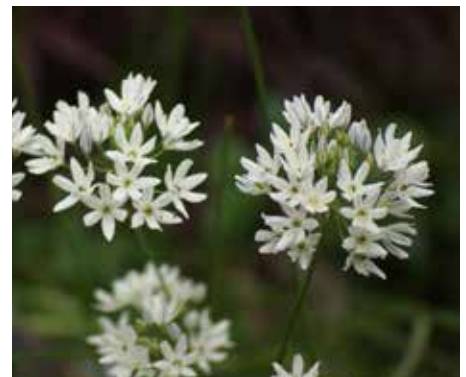
Triteleia hyacinthina Hyacinth Brodiaea