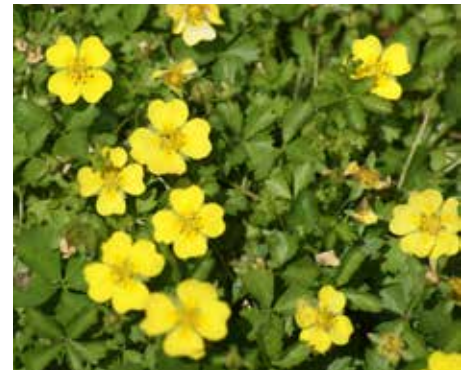
Potentilla anglica English Cinquefoil