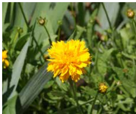
Coreopsis grandiflora Largeflowered Tickseed