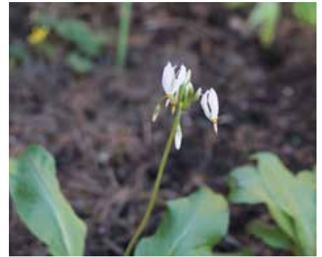
Dodecatheon meadia Shooting Star