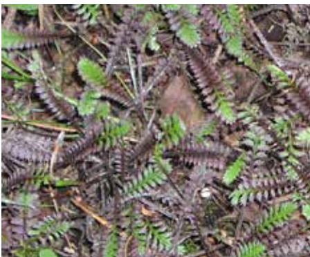
Leptinella squalida Brass Buttons