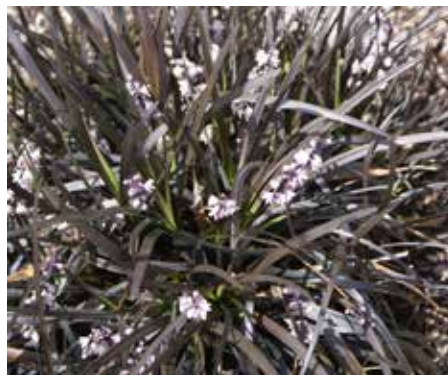
Ophiopogon planiscapus 'Nigrescens' Black Mondo Grass