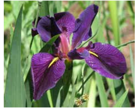
Iris x louisiana 'Black Gamecock' Louisiana Iris