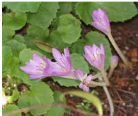
Colchicum autumnale Fall Crocus