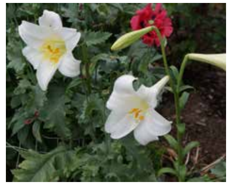
Lilium longiflorum Easter Lily