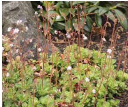
Saxifraga x urbium London Pride Saxifrage