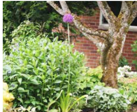
Allium giganteum Giant Onion