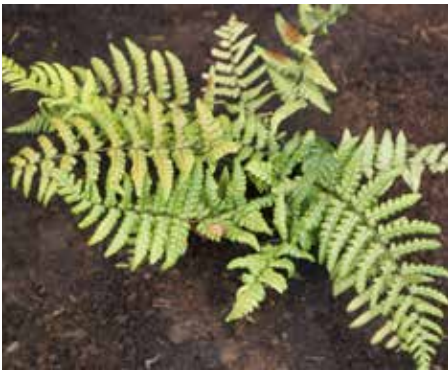
Dryopteris wallichiana Wallich's Wood Fern