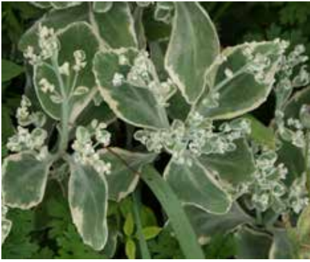
Sedum spectabile 'Frosty Morn' Stonecrop