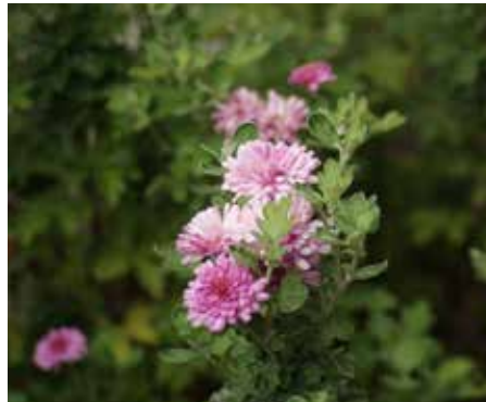
Chrysanthemum morifolium cv