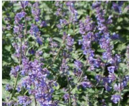
Nepeta cataria Catnip