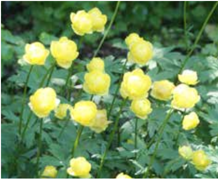
Trollius europaeus Globeflower