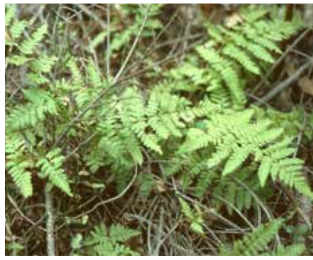
Dryopteris carthusiana Prickly Shield Fern