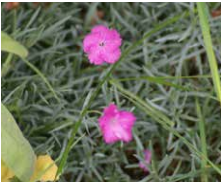
Dianthus gratianopolotanus Cheddar Pink