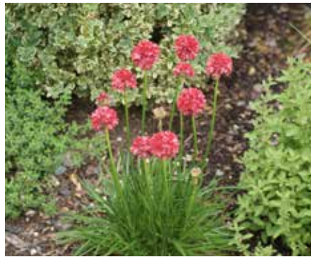
Armeria x hybrida Sea Thrift