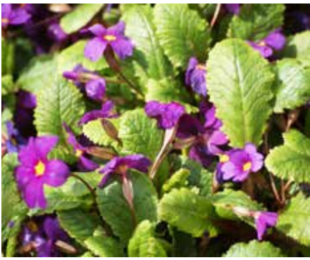
Primula x juliana 'Wanda'