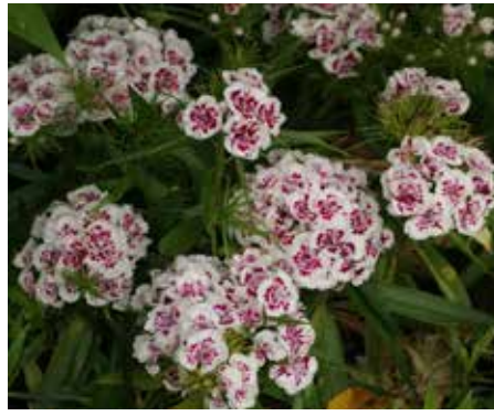
Dianthus barbatus Sweet William