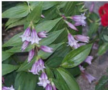
Gentiana asclepiadea Willow Gentian