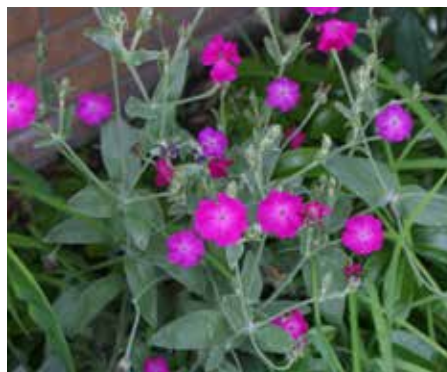
Lychnis coronaria Rose Campion