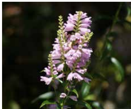
Physostegia virginiana Obedient Plant