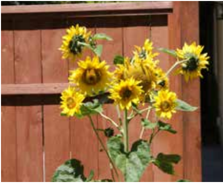
Helianthus annuus Sunflower