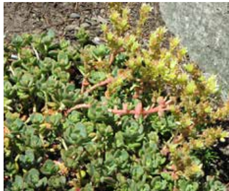
Sedum oregonense Stonecrop