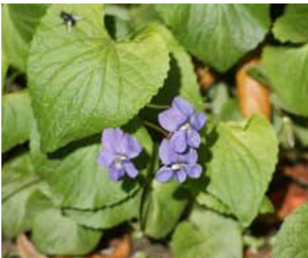
Viola septentrionalis Northern Woodland Violet