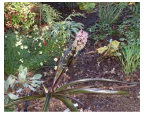
Eucomis sp Pineapple Lily