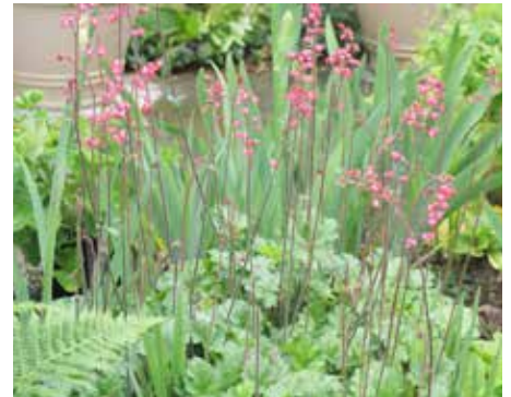
Heuchera sanguinea Coral Bells