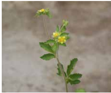
Potentilla glandulosa Sticky Cinquefoil