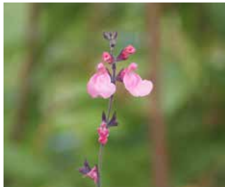
Salvia greggii Autumn Sage