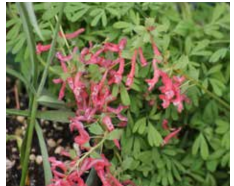
Corydalis solida 'George Baker'