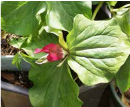
Trillium chloropetalum var. giganteum Giant Trillium