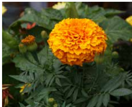
Tagetes erecta African Marigold