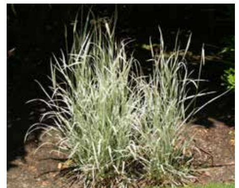
Chasmanthium latifolium 'River Mist' Variegated Northern Sea Oats