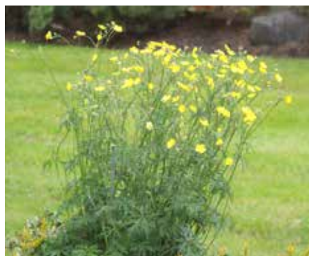
Ranunculus acris Tall Buttercup