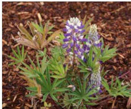
Lupinus polyphyllus Bigleaf Lupine