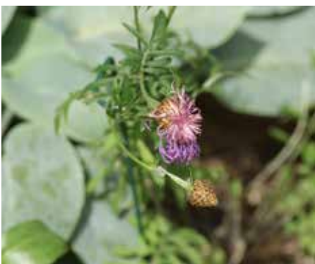
Centaurea dealbata Persian Cornflower