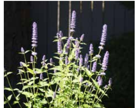
Agastache 'Blue Fortune' Giant Hyssop