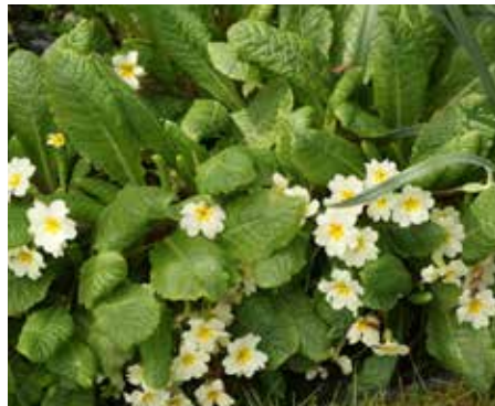
Primula vulgaris Primrose