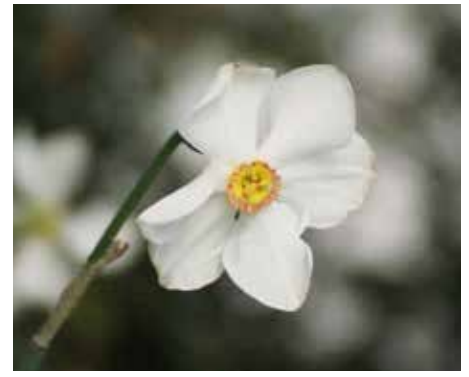
Narcissus Division 9: Poeticus