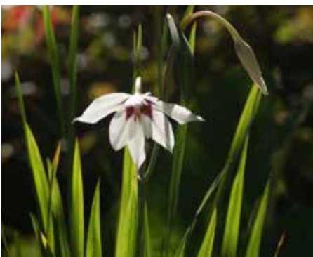
Gladiolus callianthus Abyssinian Sword Lily