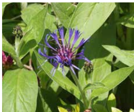
Centaurea montana Bachelor's Button