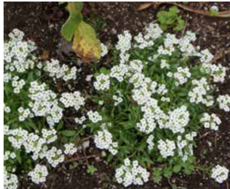
Lobularia maritima Sweet Alyssum