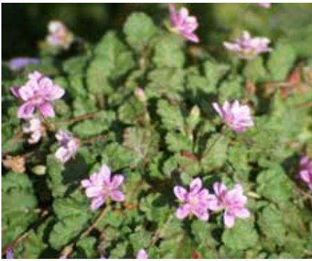
Erodium reichardii Cranesbill