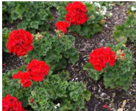
Pelargonium zonale Zonal Geranium