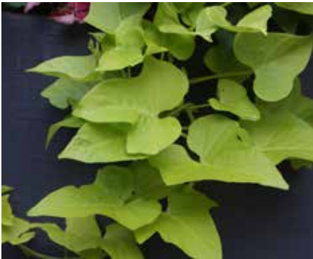
Ipomoea batatas Sweet Potato