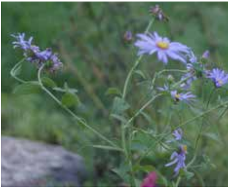
Aster x frikartii 'Monch'