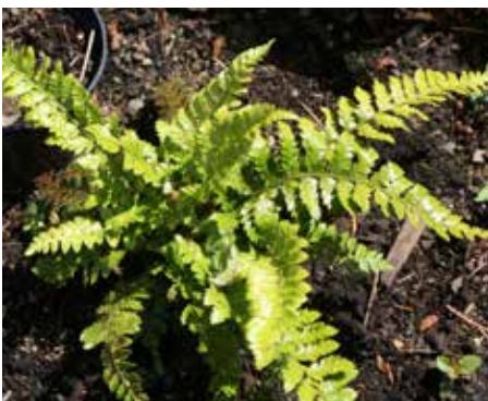
Polystichum polyblepharum Korean Tassel Fern