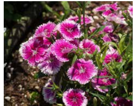
Dianthus Telstar Hybrid