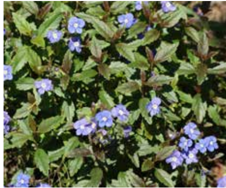
Veronica peduncularis Speedwell