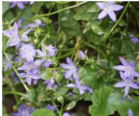
Campanula poscharskyana Serbian Bellflower