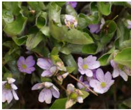
Hepatica nobilis Liverleaf