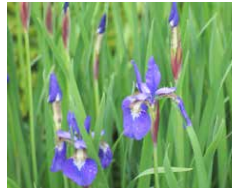
Iris siberica Siberian Iris