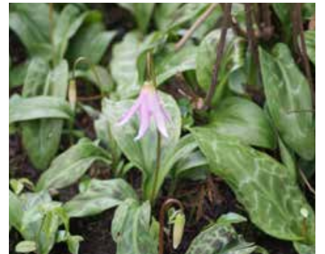
Erythronium revolutum Pink Fawn Lily