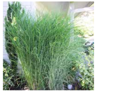
Miscanthus sinensis Maiden Grass