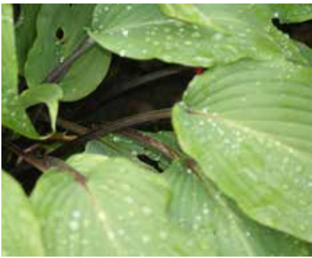
Hosta hybrid 'Red October' Plantain Lily