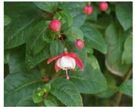
Fuschia x hybrida