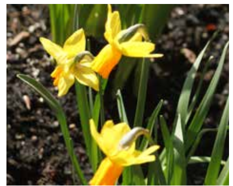
Narcissus Division 6: Cyclamineus