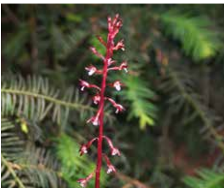
Corallorrhiza maculata Spotted Coralroot Orchid