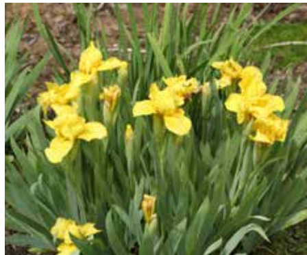
Iris Dwarf Bearded