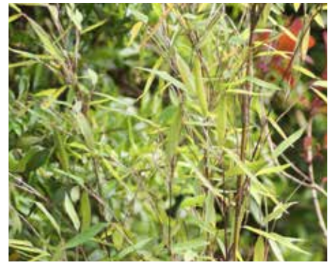
Fargesia nitida Blue Fountain Bamboo