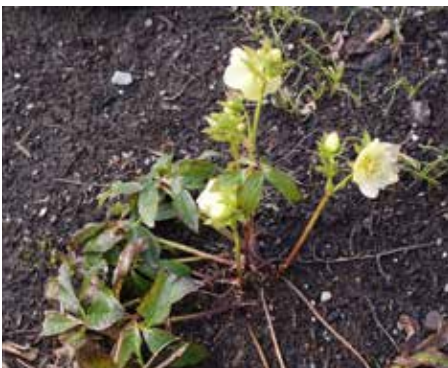
Helleborus x hybridus Lenten Rose