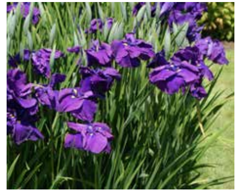
Iris ensata Japanese Iris