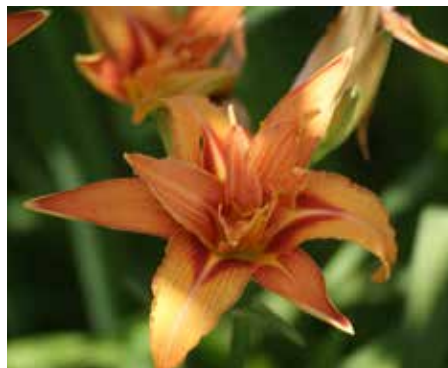
Hemerocallis fulva 'Kwanso' Tawny Daylily