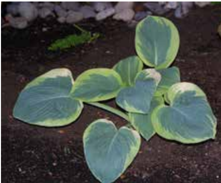
Hosta hybrid 'Earth Angel' Plantain Lily