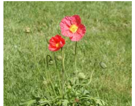
Papaver nudicaule Iceland Poppy