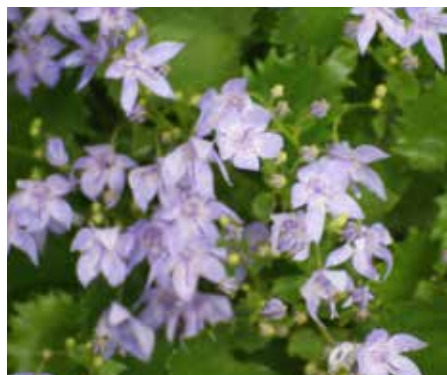
Campanula garganica Adriatic Bellflower