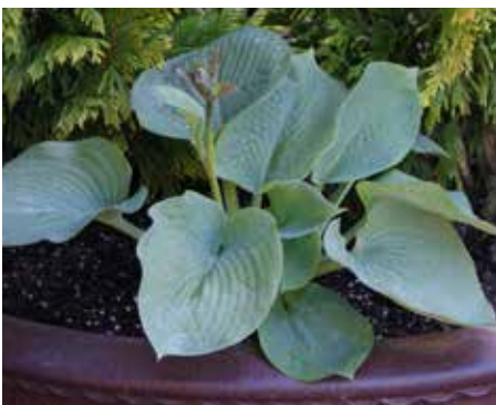
Hosta seiboldiana 'Elegans' Plantain Lily