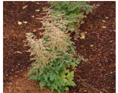
Aruncus 'Misty Lace' Goatsbeard