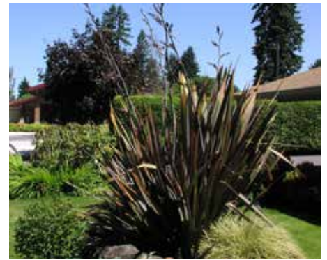
Phormium tenax 'Rubrum' New Zealand Flax