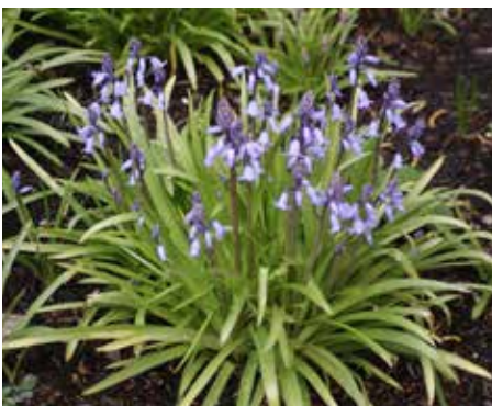
Hyacinthoides non-scripta English Bluebell