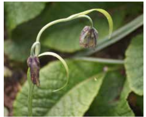
Fritillaria lanceolata Chocolate Lily