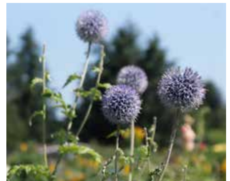
Echinops bannaticus Globe Thistle