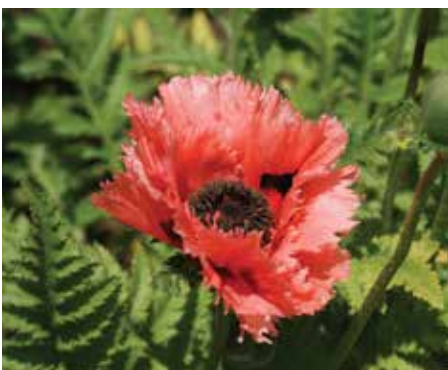
Papaver orientale Oriental Poppy