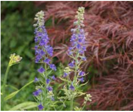
Delphinium menziesii Menzies' Larkspur