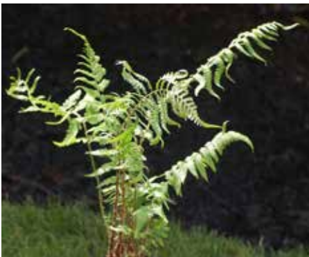
Dryopteris x australis Dixie Wood Fern