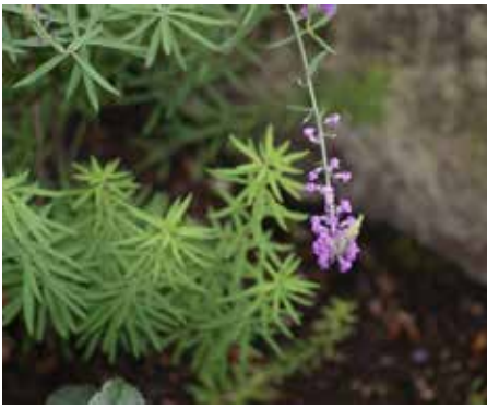
Linaria purpurea Purple Toadflax