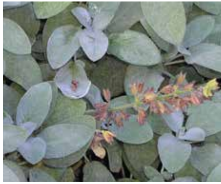
Stachys byzantina Lamb's Ears