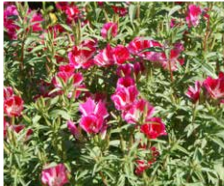
Clarkia amoena Farewell To Spring