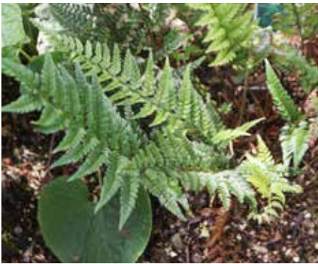
Arachniodes simplicior Indian Holly Fern