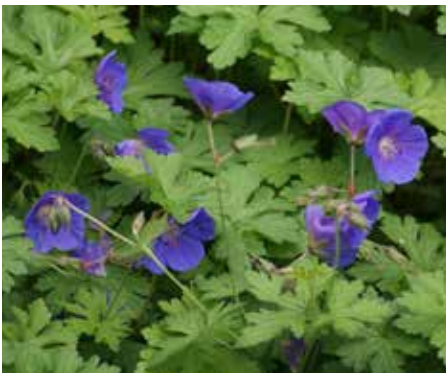
Geranium sp Cranesbill