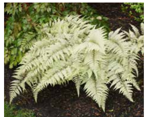
Athyrium niponicum 'Ghost' Japanese Ghost Fern