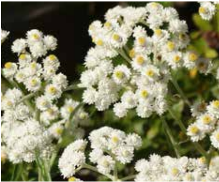
Anaphalis margaritacea Pearly Everlasting