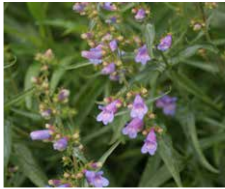
Penstemon heterophyllus 'Catherine de la Mare' Beard-tongue