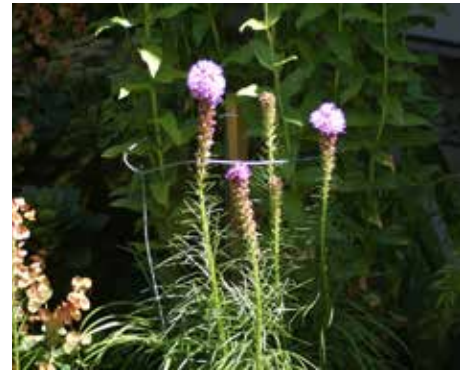
Liatris spicata Gayfeather