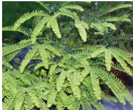
Adiantum pedatum Northern Maidenhair Fern