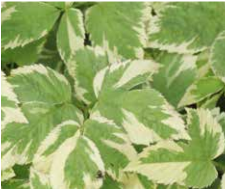
Aegopodium podagraria Goutweed, Bishop's Weed