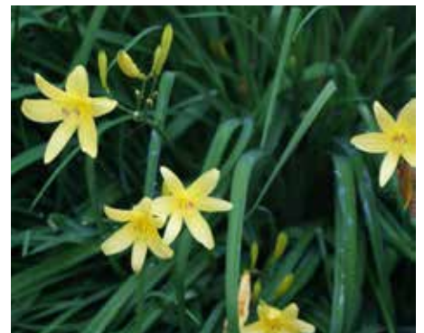
Hemerocallis lilioasphodelus Lemon Daylily