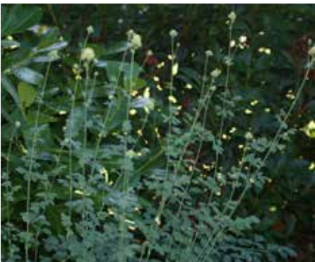
Thalictrum sp Meadow Rue