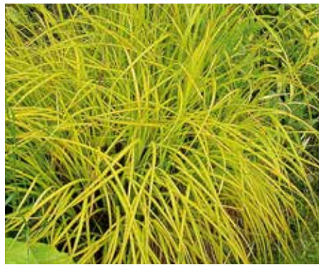
Carex elata 'Bowles Golden' Tufted Sedge