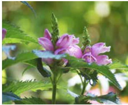
Chelone obliqua Turtlehead