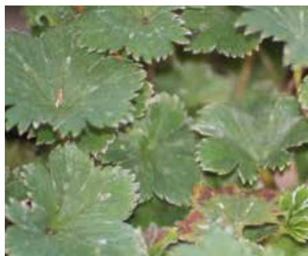
Alchemilla erythropoda Dwarf Lady's Mantle