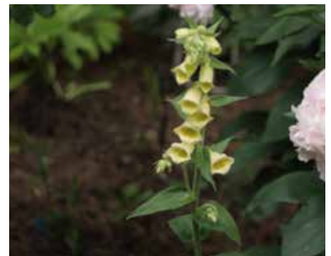
Digitalis grandiflora Yellow Foxglove