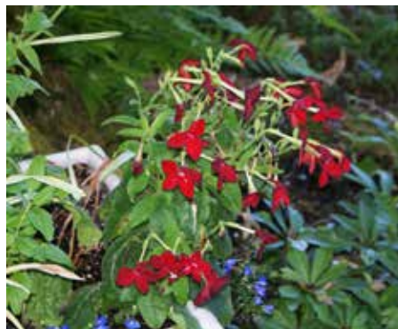
Nicotiana glauca Flowering Tobacco