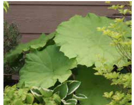
Astilboides tabularis Shieldleaf