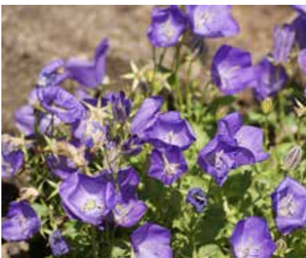
Campanula carpatica Carpathian Bellflower