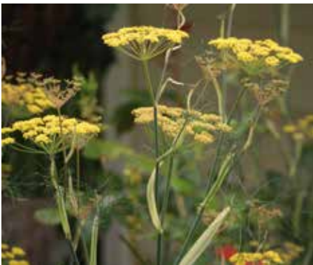
Foeniculum vulgare Fennel