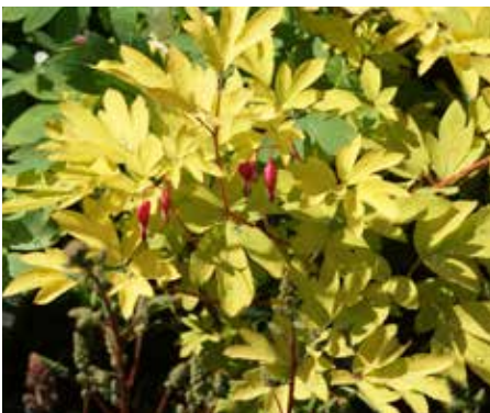
Dicentra spectabilis 'Gold Heart' Bleeding Heart