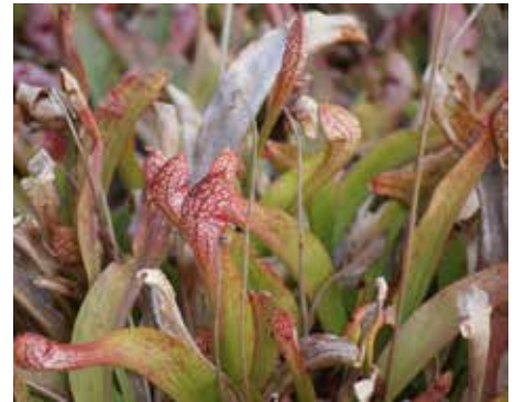
Darlingtonia californica Pitcher Plant