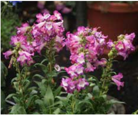
Penstemon gloxinoides Beard-tongue