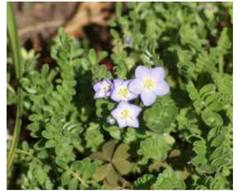
Polemonium boreale Northern Jacob's Ladder