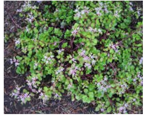
Sedum stoloniferum Stonecrop