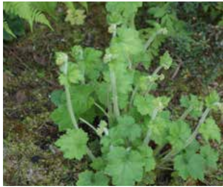
Tellima grandiflora Fringecup