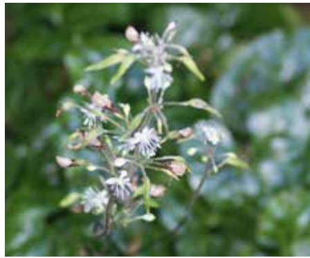
Aster lateriflorus 'Lady in Black' Calico Aster