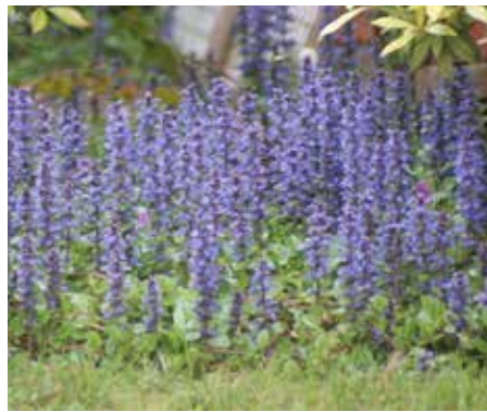
Ajuga reptans Carpet Bugle