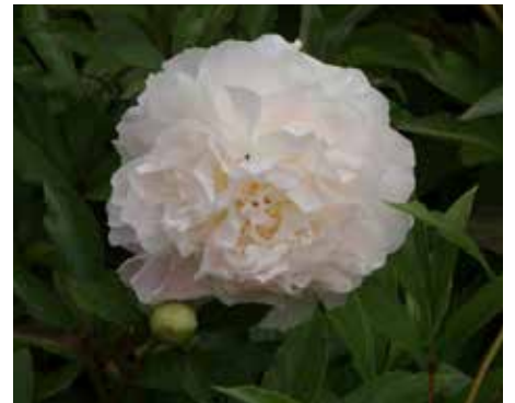
Paeonia lactiflora 'Shirley Temple' Peony