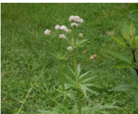
Valeriana officinalis Valerian