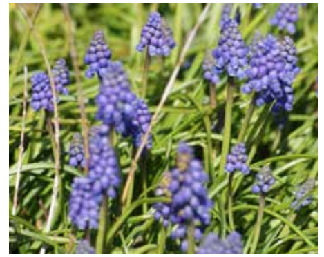
Muscari armeniacum Grape Hyacinth