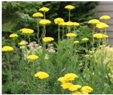
Achillea millefolium Yarrow