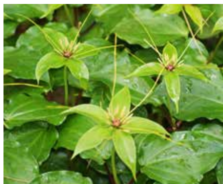
Paris quadrifolia Herb Paris