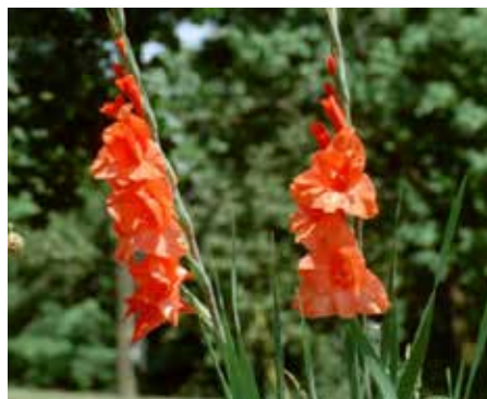
Gladiolus x hortulanus