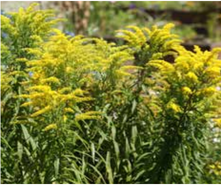
Solidago sp Goldenrod