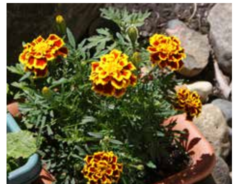
Tagetes patula French Marigold