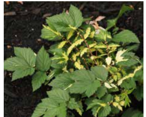
Filipendula ulmaria 'Variegata' Meadowsweet