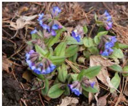
Pulmonaria angustifolia Blue Lungwort