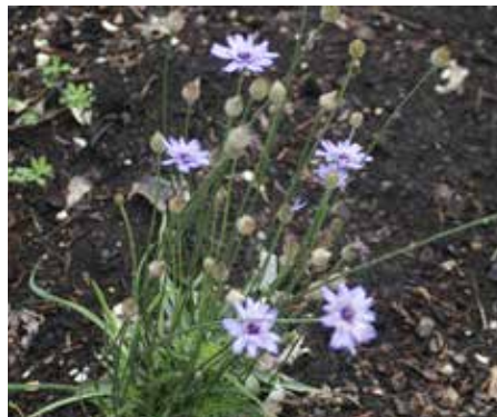
Catananche caerulea Cupid's Dart