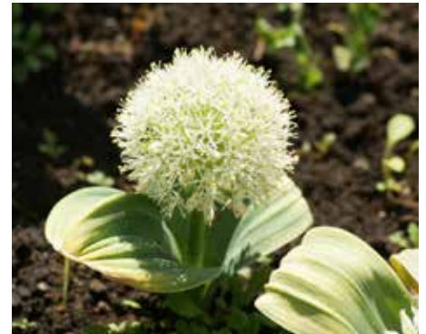
Allium karataviense Turkistan Onion