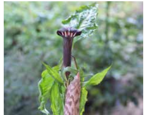
Arisaema taiwanense Cobra Lily