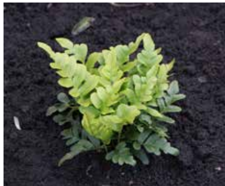
Polypodium scolieri Leather Leaf Fern