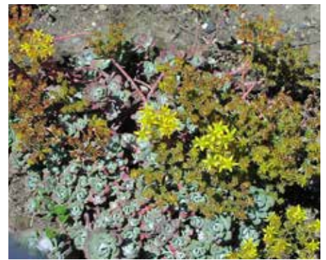
Sedum spathulifolium Stonecrop