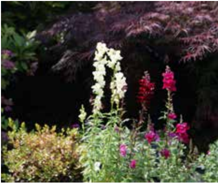
Antirrhinum majus Snapdragon

At least we grow them as annuals. Most are actually tropical perennials or shrubs which grow fast enough to give a good show in one year but will not survive the winter here. You will notice a few, such as zinnia and marigold, which are true annuals - going from seed to flower to seed to death in less than one year. Here are a selection of annuals found at Panorama in the Summer of 2018.