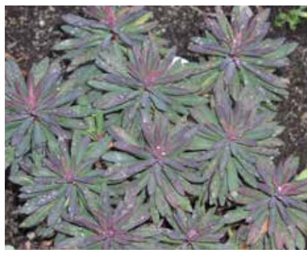
Euphorbia 'Blackbird' Cushion Spurge