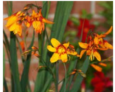
Crocosmia 'Emily McKenzie'