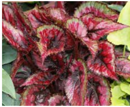
Begonia rex-cultorum Rex Begonia