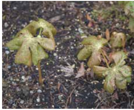
Podophyllum peltatum Mayapple