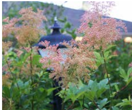
Filipendula rubra Queen of the Prairie