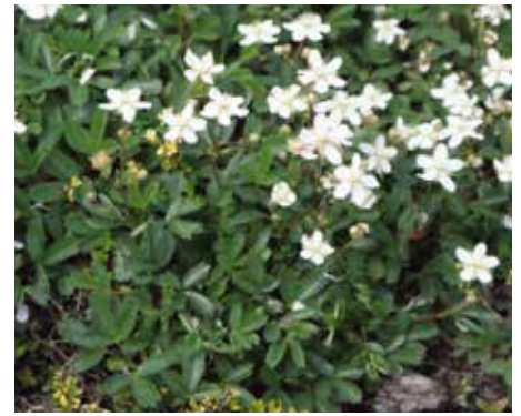
Potentilla tridentata Three-toothed Cinquefoil