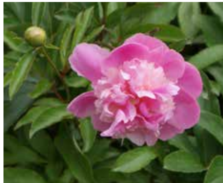
Paeonia lactiflora 'Monsieur Jules Elie' Peony