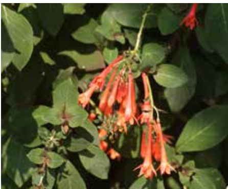
Fuchsia triphylla 'Gartenmeister Bonstedt'