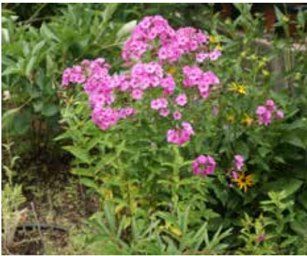
Phlox paniculata Garden Phlox