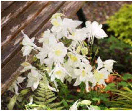
Aquilegia chrysantha cv Golden Columbine