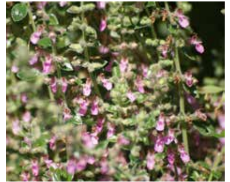
Teucrium chamaedrys Germander