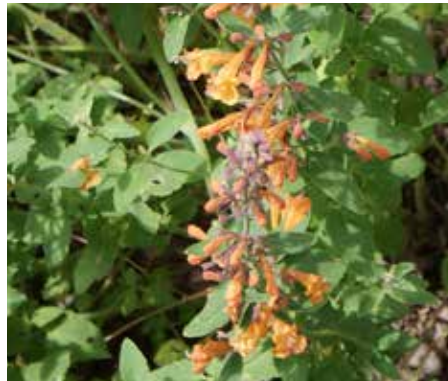
Agastache 'Arizona Sandstone' Hummingbird Mint