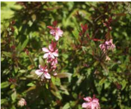
Gaura lindheimeri Beeblossom