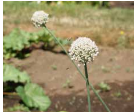
Allium cepa Onion