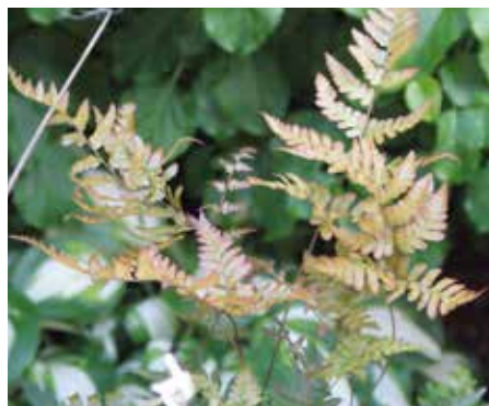
Dryopteris erythrosora Autumn Fern