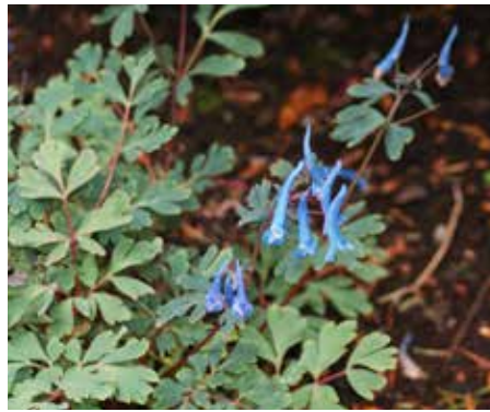
Corydalis curviflora var. rosthornii