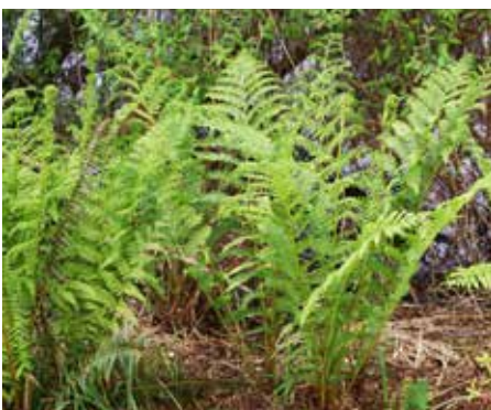
Athyrium filix-femina Common Lady Fern