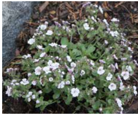
Gypsophila cerastioides Alpine Baby's Breath