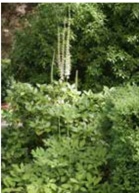
Cimicifuga racemosa Black Cohosh, Bugbane