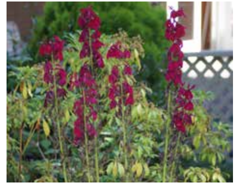
Lobelia x speciosa Cardinal Flower