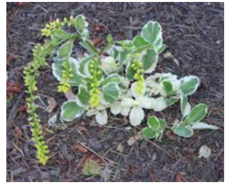
Chiastophyllum oppositifolium Lamb's Tail