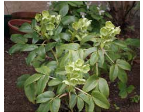
Helleborus argutifolius Corsican Hellebore