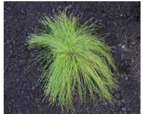
Isolepis cernua Fiber Optic Grass