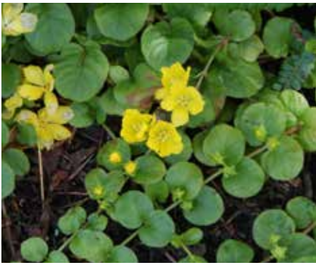
Lysimachia nummularia Creeping Jenny, Moneywort