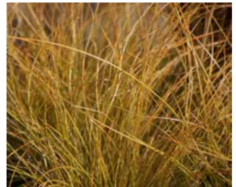
Carex flagellifera New Zealand Hair Sedge