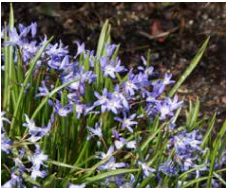
Chionodoxa luciliae Glory of the Snow