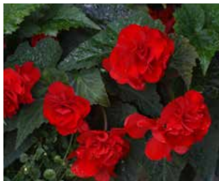
Begonia tuberhybrida Tuberous Begonia