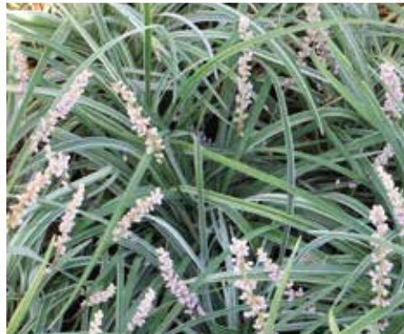
Liriope spicata 'Silver Dragon' Lilyturf