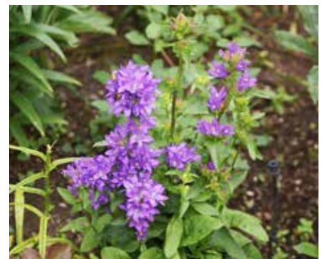
Campanula glomerata Clustered Bellflower