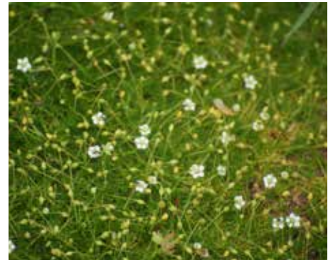
Sagina subulata Irish Moss