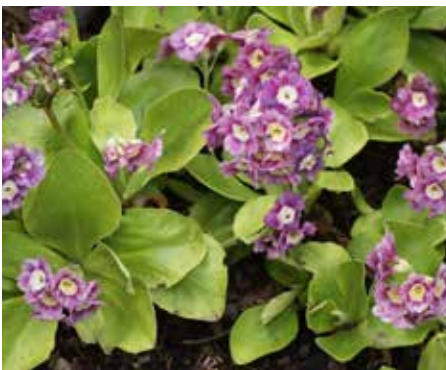
Primula auricula Mountain Cowslip