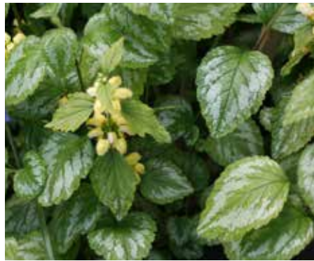
Lamium galeobdolon Yellow Archangel