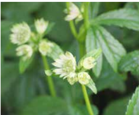
Astrantia major Great Masterwort