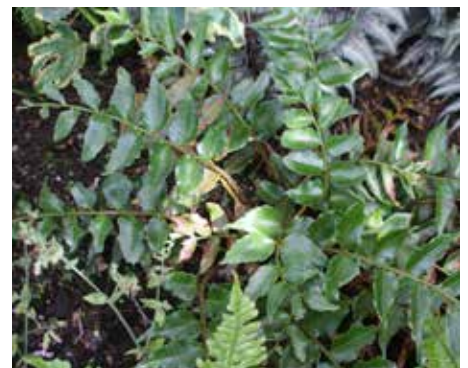
Polystichum tsus-simense Korean Rock Fern