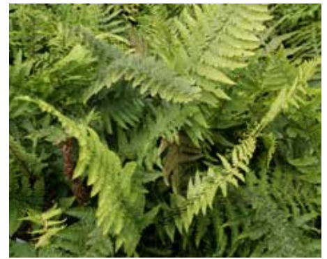
Dryopteris x complexa Buckler Fern