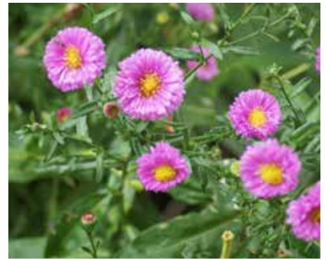
Aster novi-angliae New England Aster