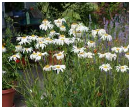
Leucanthemum x superbum Shasta Daisy