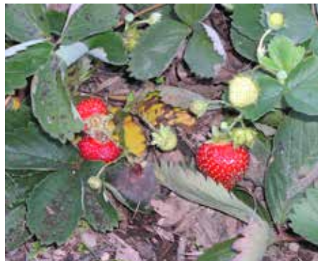
Fragaria x ananassa Strawberry