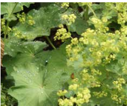
Alchemilla mollis Lady's Mantle