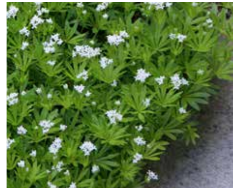
Galium odoratum Sweet Woodruff