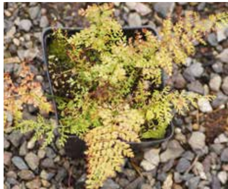
Arachniodes standishii Upside Down Fern