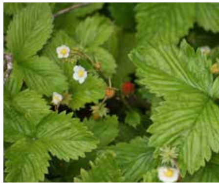
Fragaria vesca Woodland Strawberry