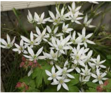
Ornithogalum umbellatum Star of Bethlehem