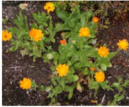
Calendula officinalis Pot Marigold