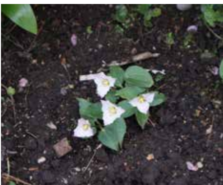
Trillium rivale Brook Wakerobin