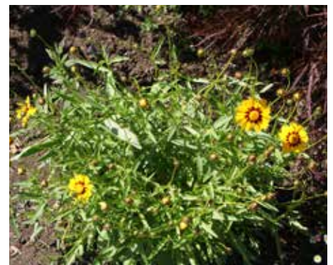
Coreopsis lanceolata Lanceleaf Tickseed