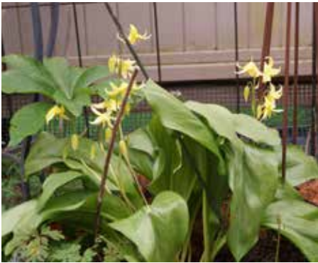
Erythronium grandiflorum Yellow Glacier Lily