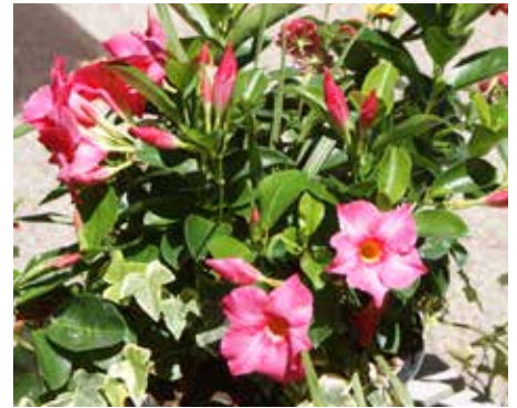
Mandevilla splendens Dipladenia