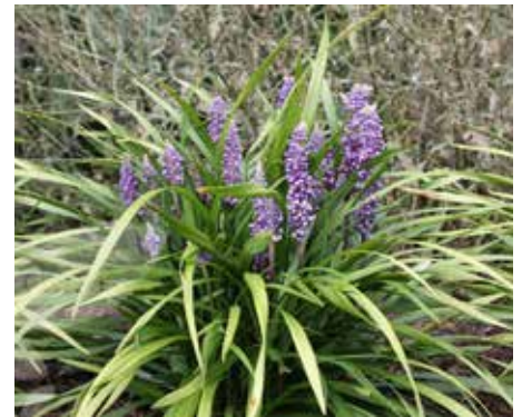
Liriope gigantea Giant Lilyturf