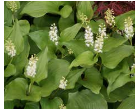
Maianthemum dilatatum False Lily of the Valley