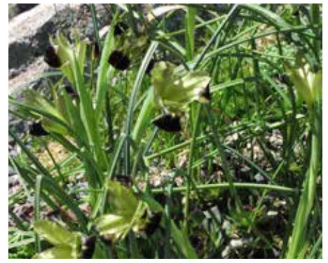
Hermodactylus tuberosus Widow's Iris