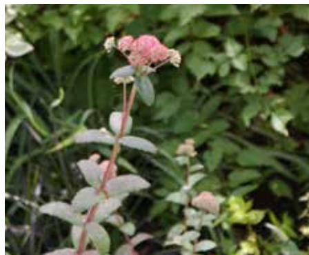
Sedum telephium 'Red Cauli' Stonecrop