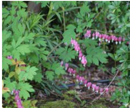
Dicentra spectabilis Bleeding Heart