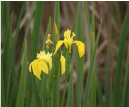
Iris pseudacorus Water Flag