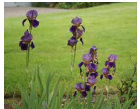
Iris Tall Bearded