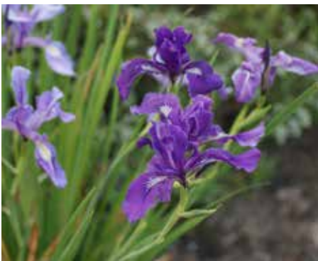
Iris tenax Oregon Iris