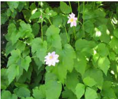
Anemone x hybrida 'Honorine Jobert' Japanese Anemone