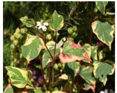
Houttuynia cordata 'Chameleon' Chameleon Plant