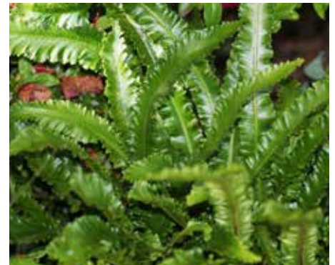
Asplenium scolopendrium Hart's Tongue Fern