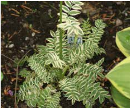
Polemonium caeruleum 'Brise d'Anjou' Variegated Jacob's Ladder