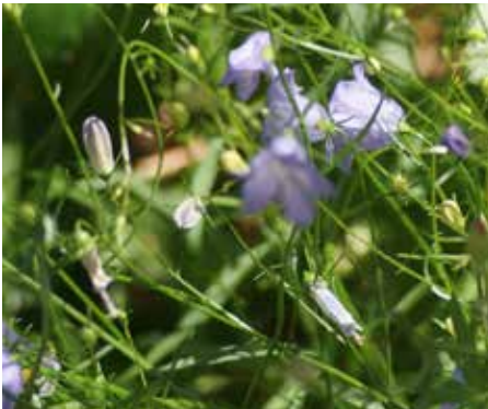
Campanula rotundifolia Harebell