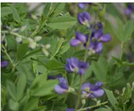
Baptisia australis False Indigo