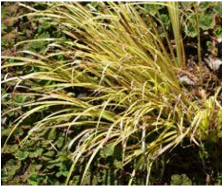
Acorus gramineus 'Ogon' Sweet Flag

Yes, grasses and sedges and their relatives are flowering perennials, but they are separated here because they look so different from everything else. An old saying reminds us that “Sedges have edges; grasses are round, and hollow right up from the ground.” As a first step to identification, try rolling a stem between two fingers. The round stem of grass will move easily, while the three-cornered stem of sedge will offer resistance. There are hundreds of species of grass and sedge native to this area and it is likely that many of them are to be found on campus; some as ornamentals, others in the wild areas near the lake, even - though we don't like to admit it - a few as weeds.