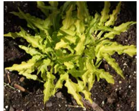
Hosta hybrid 'Dragon Tails' Plantain Lily