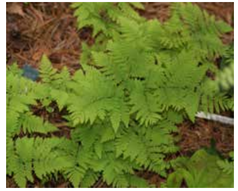
Gymnocarpium dryopteris Western Oak Fern