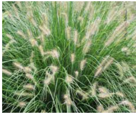
Pennisetum alopecuroides Fountain grass