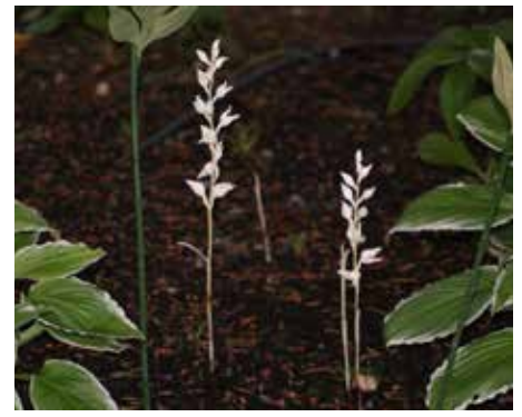
Cephalanthera austiniiae Phantom Orchid