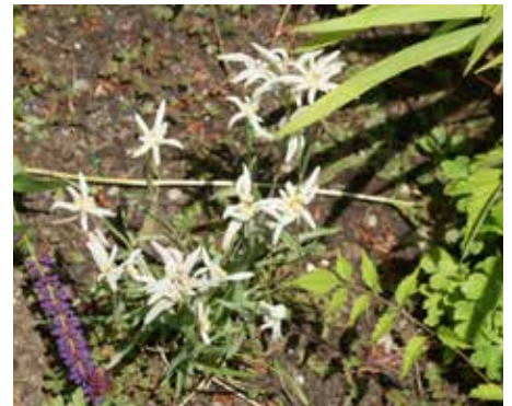
Leontopodium alpinum Edelweiss