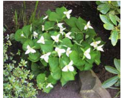
Trillium ovatum Pacific Trillium