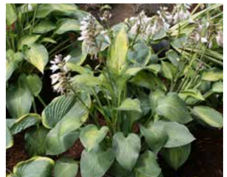
Hosta tokudama 'Blue Shadows' Plantain Lily