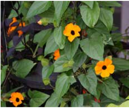
Thunbergia alata Black-eyed Susan Vine