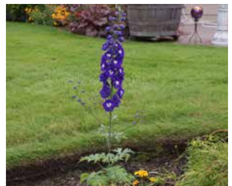
Delphinium x elatum Pacific Hybrid Delphinium