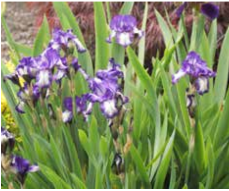
Iris Intermediate Bearded