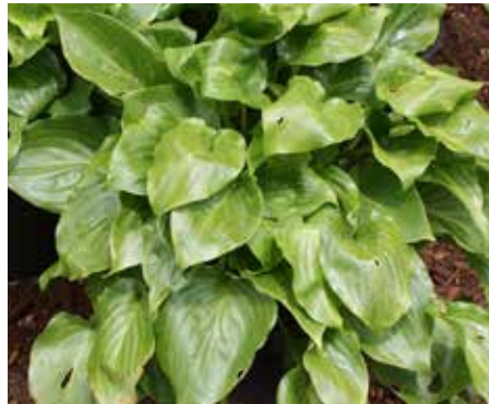
Hosta hybrid 'Invincible' Plantain Lily