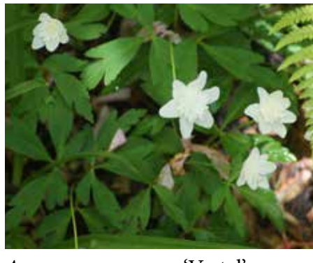
Anemone nemorosa 'Vestal' Wood Anemone