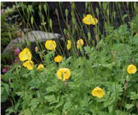
Meconopsis cambrica Welsh Poppy