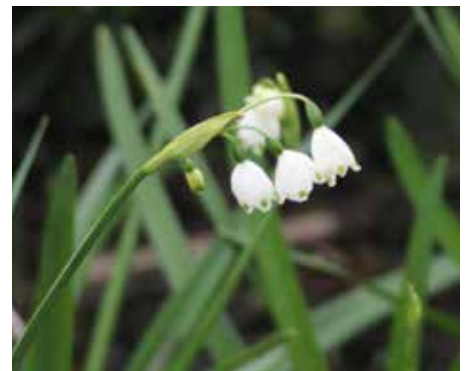
Leucojum aestivum Summer Snowflake