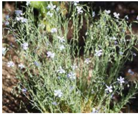
Linum perenne Flax