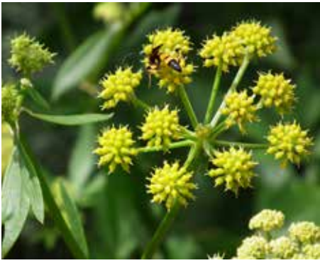
Levisticum officinale Lovage