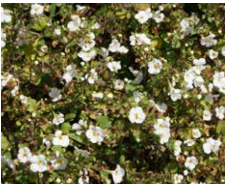
Sutera cordata Bacopa