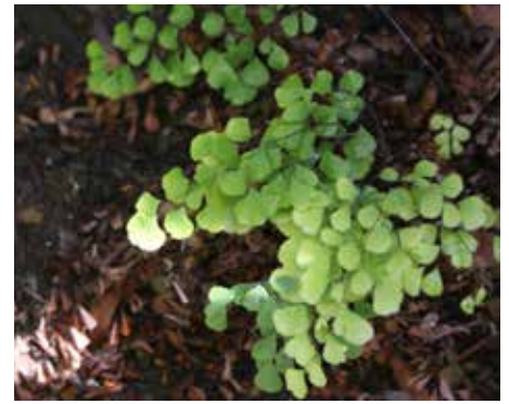
Adiantum venustum Himalayan Maidenhair Fern