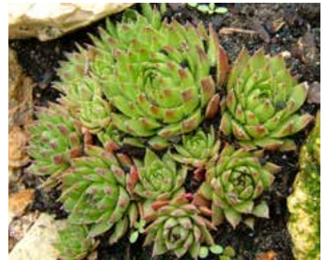
Jovibarba hirta Rolling Hens and Chicks