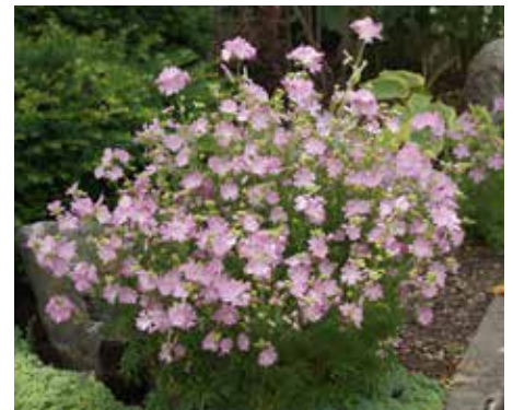
Malva moschata Musk Mallow