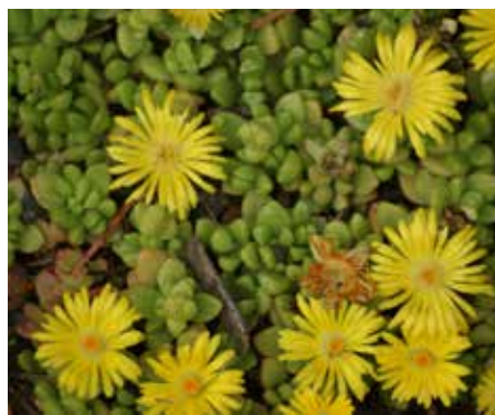
Delosperma nubigenum Ice Plant