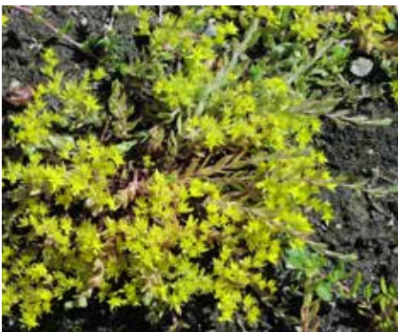
Sedum sarmentosum Stonecrop