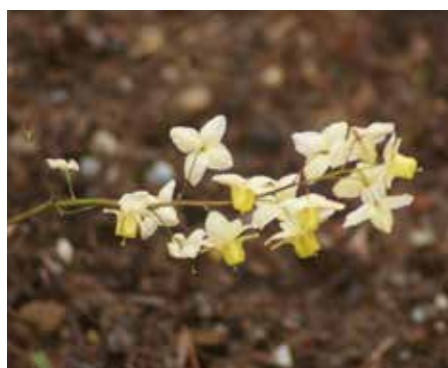
Epimedium pallidum Barrenwort