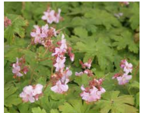
Geranium x cantabrigiense Cranesbill