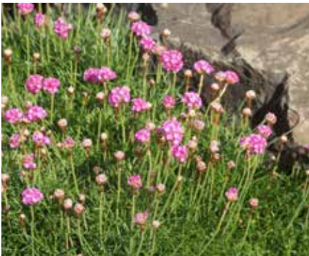
Armeria maritima Sea Thrift