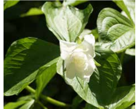
Trillium grandiflorum 'Flore Pleno' Double Great White Trillium