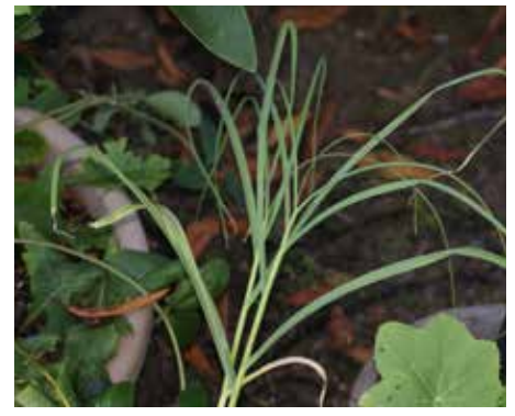
Allium obliquum Lopsided Onion