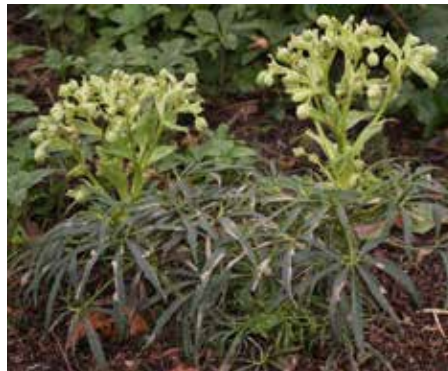
Helleborus foetidus Stinking Hellebore