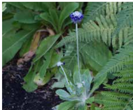
Primula capitata Asiatic Primrose