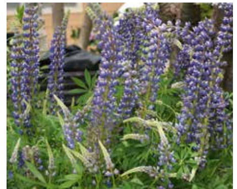
Lupinus Russell Hybrid Lupine