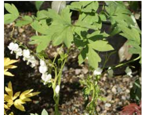
Dicentra spectabilis 'Alba' Bleeding Heart