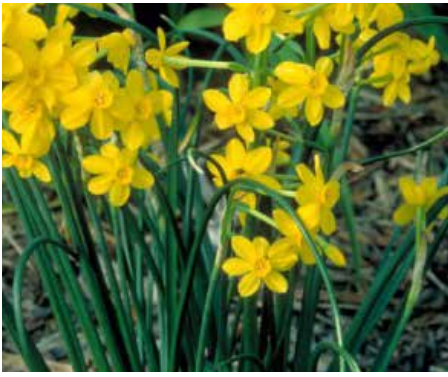
Narcissus Division 7: Jonquilla