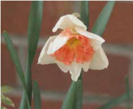
Narcissus Division 11: Split Corona