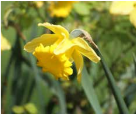
Narcissus Division 1: Trumpet