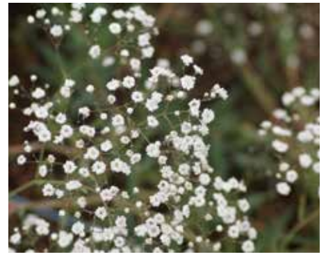
Gypsophila paniculata Baby's Breath