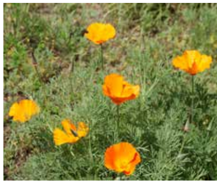
Eschscholzia californica California Poppy