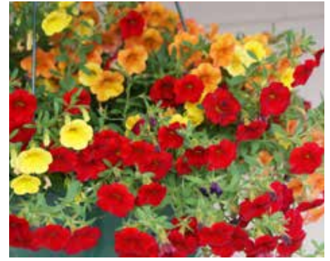
Calibrachoa x hybrida Million Bells