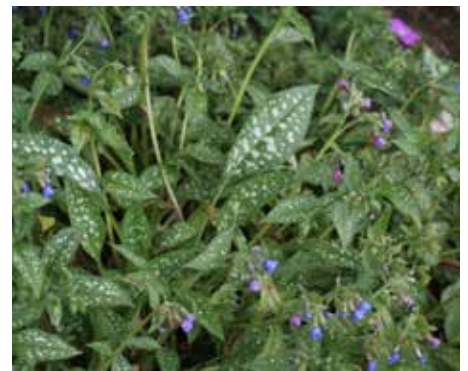
Pulmonaria 'Roy Davidson' Lungwort