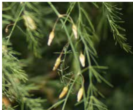
Asparagus officinalis Asparagus