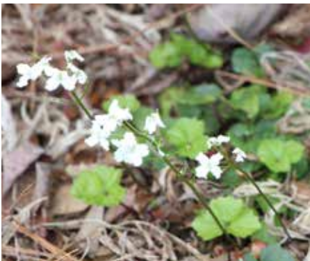
Cardamine trifolia Three Leaf Bittercress