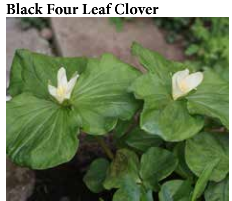
Trillium chloropetalum Giant Trillium