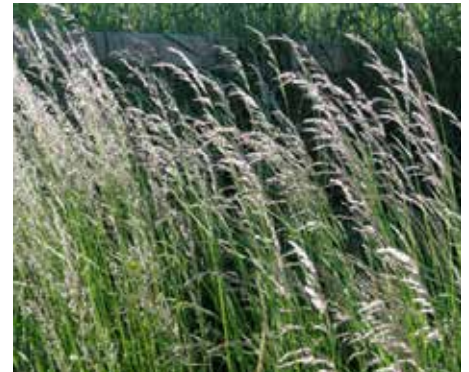
Arrhenatherum elatius Bulbous Oat Grass