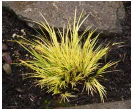
Acorus gramineus 'Pusillus Aurea' Dwarf Sweet Flag