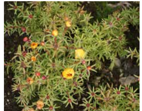
Portulaca grandiflora Moss Rose