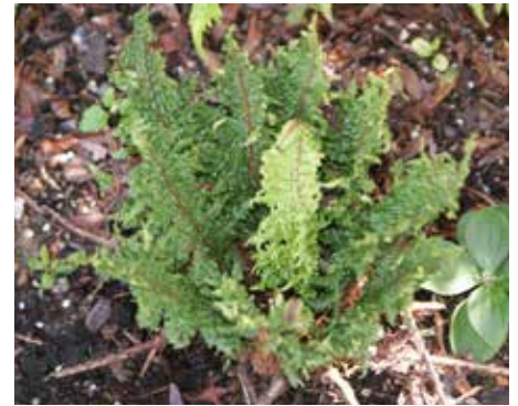
Dryopteris affinis 'Crispa Congesta' Scaly Male Fern