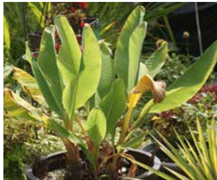
Musella lasiocarpa Chinese Dwarf Banana