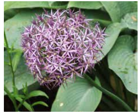
Allium christophii Star of Persia