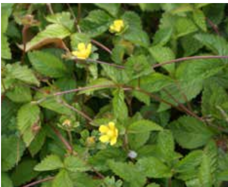
Duchesnea (Potentilla) indica Indian Strawberry