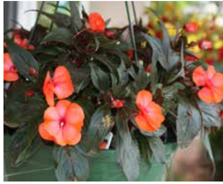
Impatiens hawkeri New Guinea Impatiens