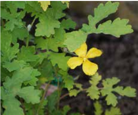
Stylophorum diphyllum Wood Poppy