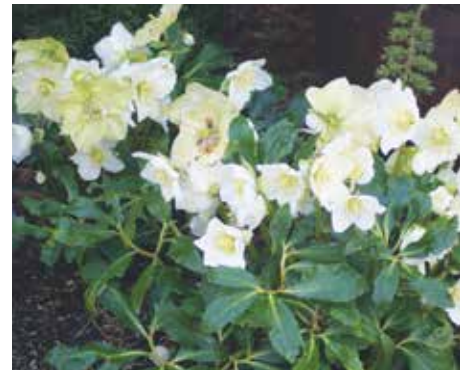
Helleborus niger 'Joseph Lemper' Christmas Rose