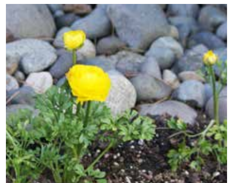
Ranunculus asiaticus Persian Buttercup