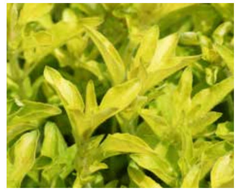
Origanum vulgare 'Aureum' Golden Oregano