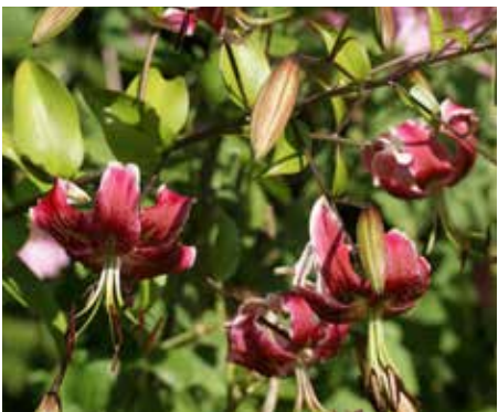
Lilium Bellingham Hybrid