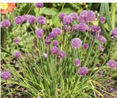
Allium schoenoprasum Chives