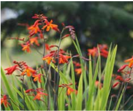
Crocosmia × crocosmiiflora Montbretia