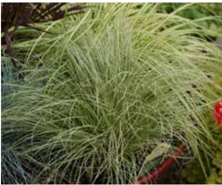
Carex comans New Zealand Hair Sedge