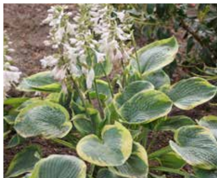
Hosta seiboldiana 'Frances Williams'