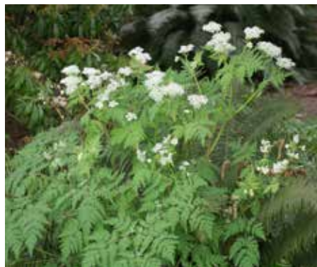
Osmorhiza longistylis Sweet Cicely