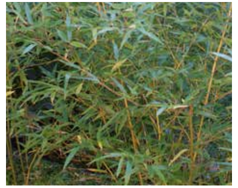
Phyllostachys aurea Golden Bamboo