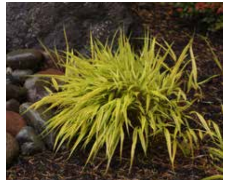
Hakonechloa macra 'Aureola' Japanese Forest Grass