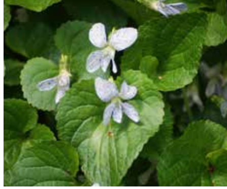
Viola sororia 'Freckles' Woolly Blue Violet