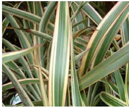
Phormium cookianum 'Tricolor' New Zealand Flax