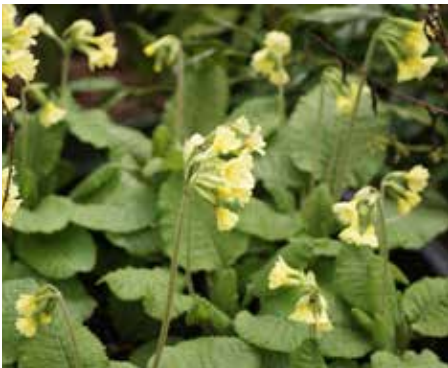
Primula veris English Cowslip