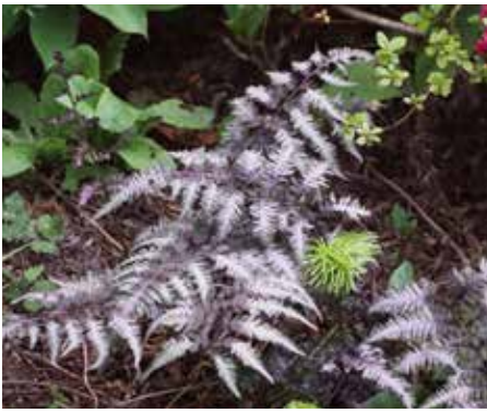
Athyrium niponicum 'Pictum' Japanese Painted Fern