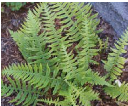
Dryopteris cycadina Shaggy Shield Fern