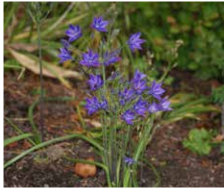
Brodiaea laxa 'Queen Fabiola' Triplet Lily