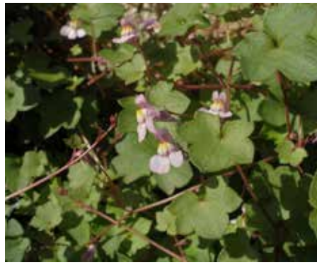
Cymbalaria muralis Kenilworth Ivy