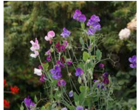
Lathyrus odoratus Sweet Pea