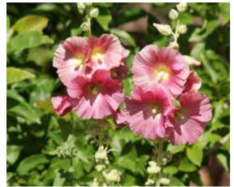
Alcea rosea Hollyhock