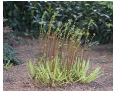
Blechnum spicant Deer Fern