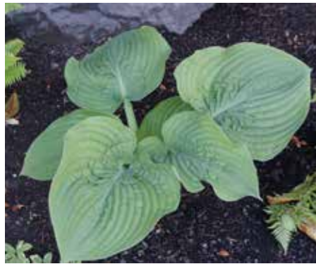
Hosta hybrid 'Blue Umbrellas' Plantain Lily