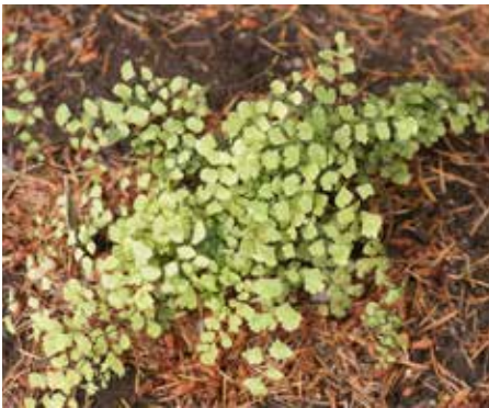
Adiantum x mairisii Mairis' Hardy Maidenhair Fern

These perennials, more ancient than flowering plants, reproduce by spores rather than seeds. Our moist, temperate climate makes the northwest prime fern country and you may find a number of other species as you walk the Panorama campus.