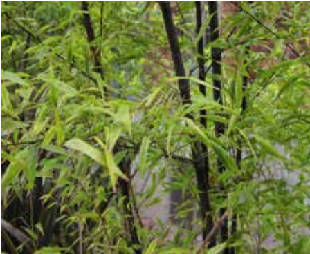
Phyllostachys nigra Black Bamboo