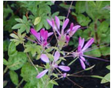
Cleome hasslerana Spider Flower