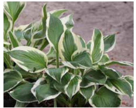
Hosta fortunei 'Patriot' Plantain Lily