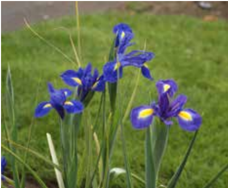
Iris hollandica Dutch Iris