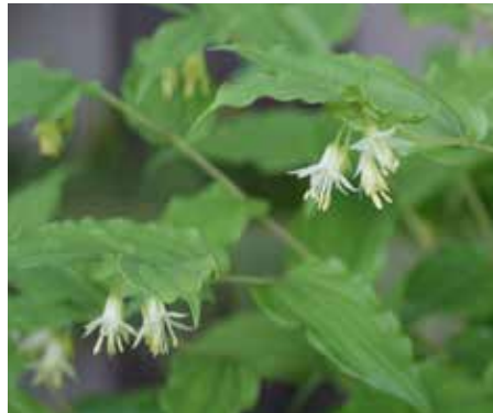
Disporum (Prosartes) hookeri Hooker's Fairybell