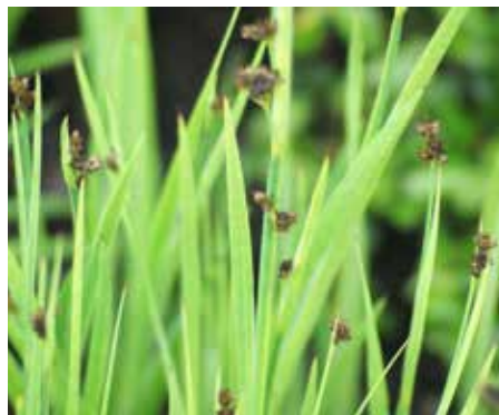
Luzula sp Wood Rush