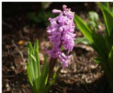
Hyacinthus orientalis Hyacinth