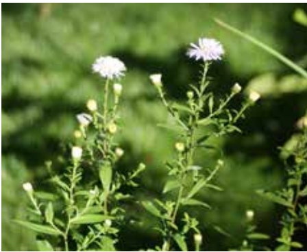
Aster novi-belgii 'Porzellan' New York Aster