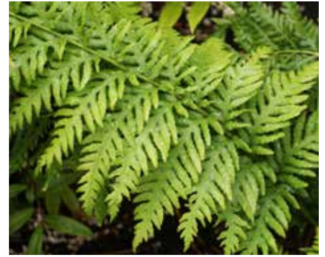
Woodwardia fimbriata Giant Chain Fern