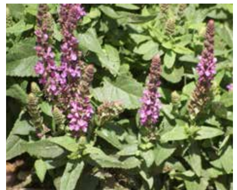
Salvia × superba