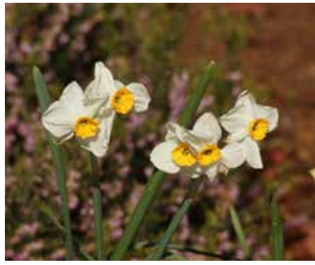
Narcissus Division 8: Tazetta