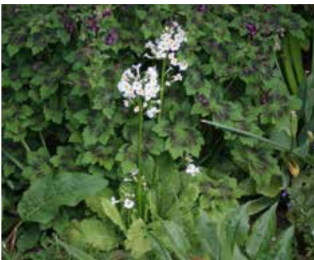
Primula sp , section Proliferae Candelabra Primrose