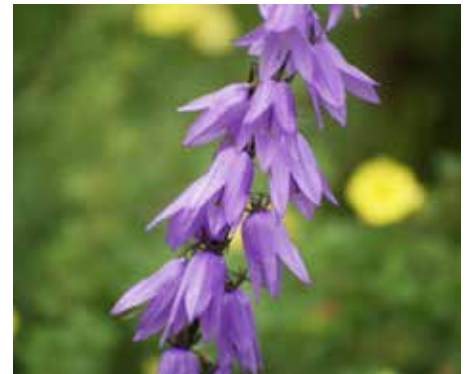
Campanula rapunculoides Rampion Bellflower