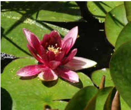
Nymphaea sp Water Lily