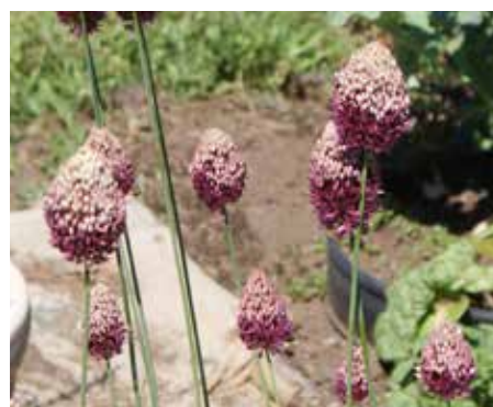
Allium sphaerocephalon Drumstick Onion