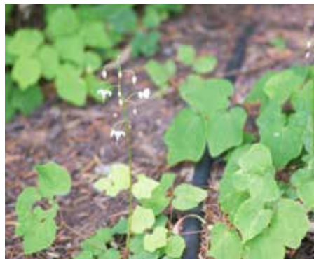
Vancouveria hexandra Inside-Out Flower