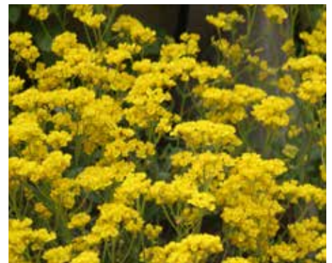
Aurinia (Alyssum) saxatilis Basket of Gold