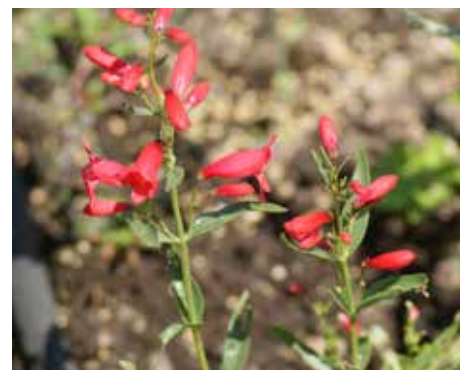
Penstemon barbatus 'Red Riding Hood' Beard-tongue