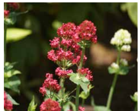
Centranthus ruber Jupiter's Beard