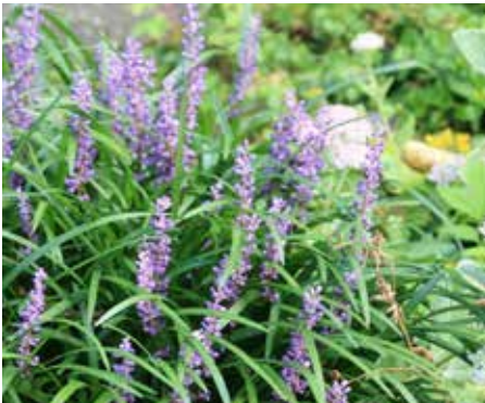
Liriope muscari Lilyturf