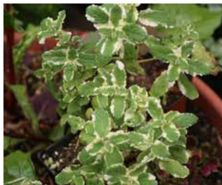
Mentha suaveolens 'Variegata' Pineapple Mint