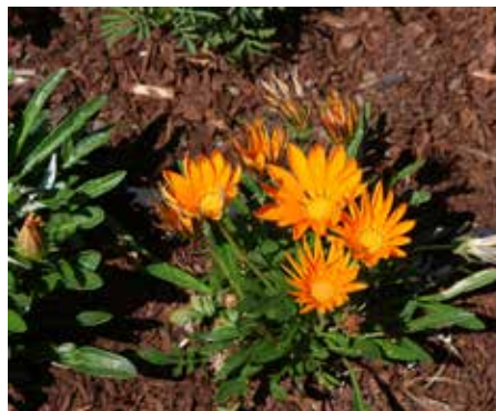
Gazania rigens Treasure Flower