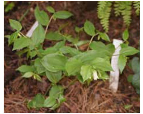
Streptopus amplexifolius Twisted Stalk