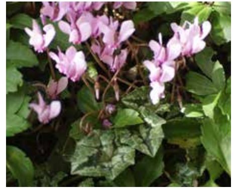
Cyclamen hederifolium Ivy-leaved Cyclamen