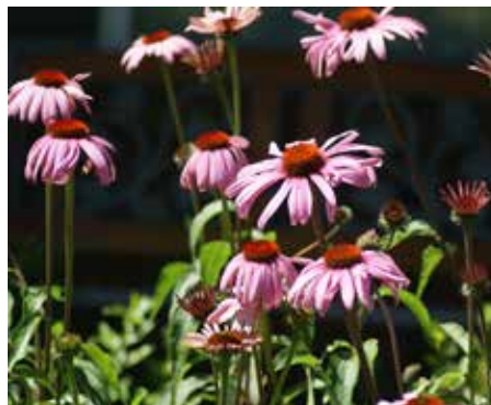
Echinacea purpurea Purple Coneflower