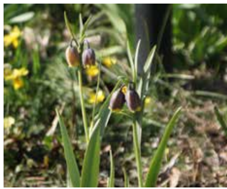
Fritillaria uva-vulpis Fox Grape Fritillary