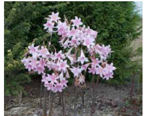
Amaryllis belladonna Naked Ladies