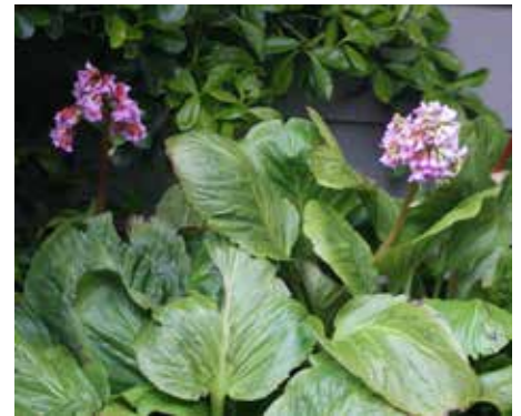
Bergenia cordifolia Pigsqueak