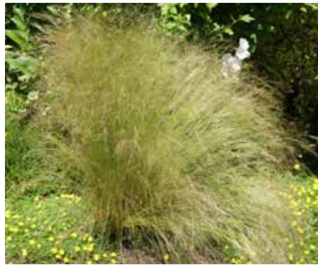
Deschampsia cespitosa Tufted Hair Grass