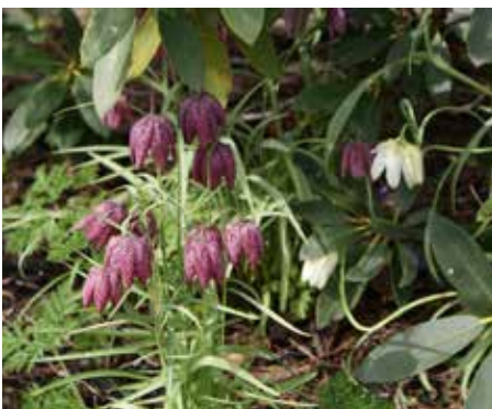
Fritillaria meleagris Snake's Head Fritillary