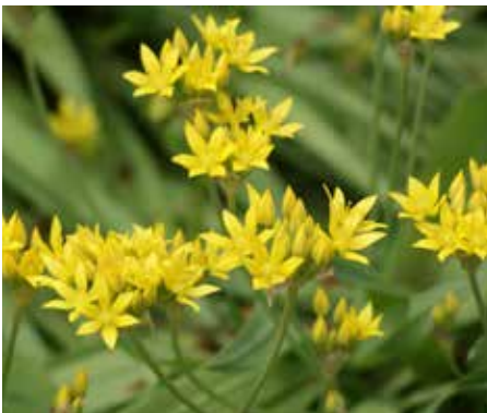
Allium moly Golden Garlic, Lily Leek