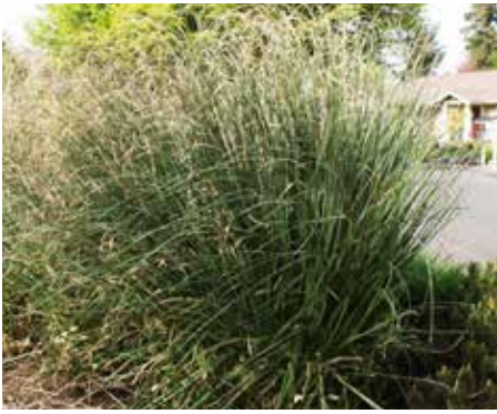
Cortaderia selloana 'Pumila' Dwarf Pampas Grass