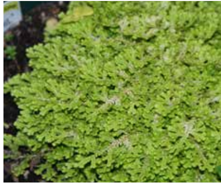
Selaginella kraussiana Clubmoss