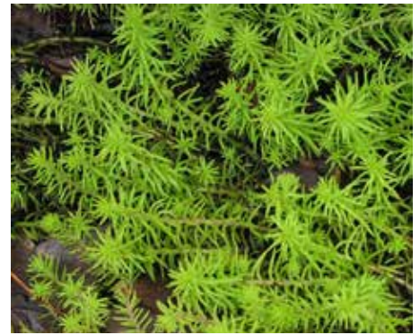
Sedum rupestre Stonecrop