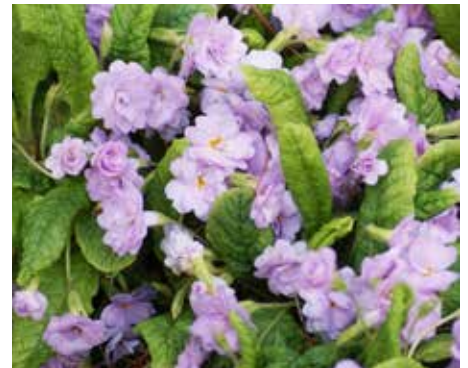
Primula vulgaris 'Lilacina Plena'