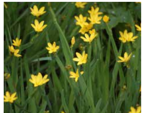
Sisyrinchium californicum Yellow-eyed Grass