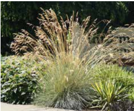
Helictotrichon sempervirens Blue Oat Grass