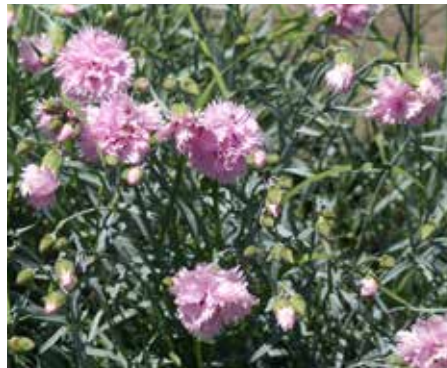
Dianthus plumarius Cottage Pink