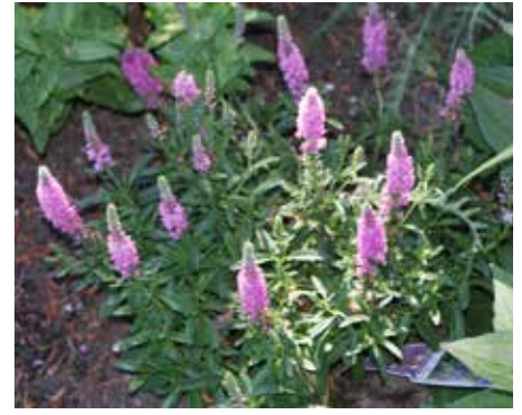
Veronica spicata 'Hocus Pocus' Spike Speedwell