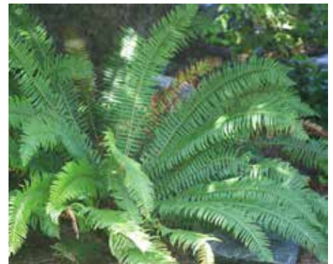
Polystichum munitum Western Sword Fern