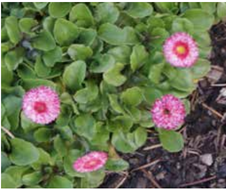
Bellis perennis English Daisy