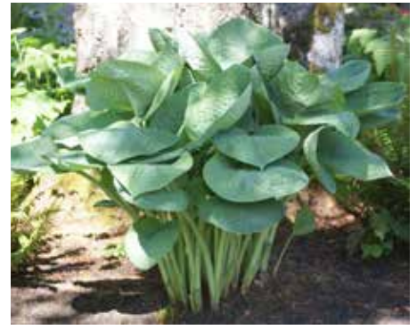
Hosta hybrid 'Krossa Regal' Plantain Lily