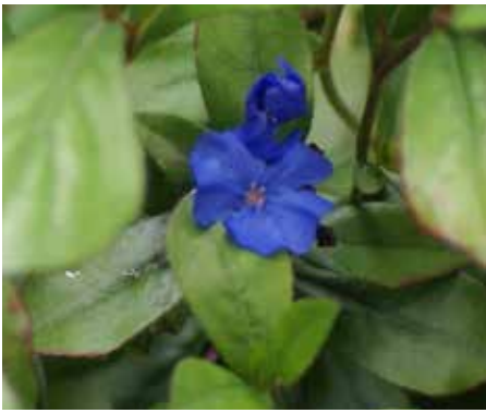
Ceratostigma plumbaginoides Leadwort, Blue Plumbago