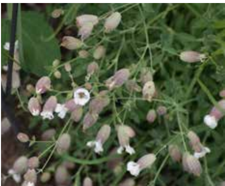
Silene uniflora Catchfly