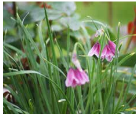
Allium narcissiflorum Piedmont Garlic