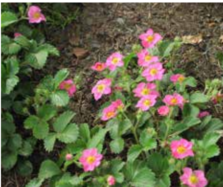
Fragaria 'Pink Panda' Flowering Strawberry