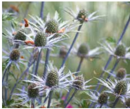
Eryngium alpinum Sea Holly