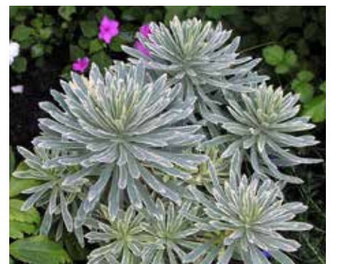
Euphorbia Characias 'Silver Swan' Mediterranean Spurge