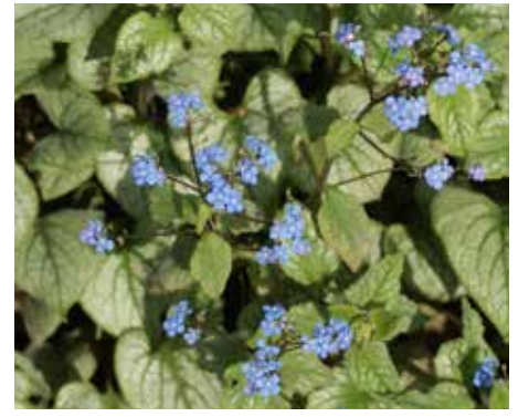
Brunnera macrophylla 'Jack Frost' Siberian Bugloss