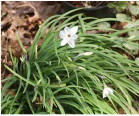
Ipheion uniflorum Spring Starflower