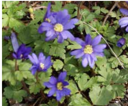
Anemone blanda Grecian Windflower