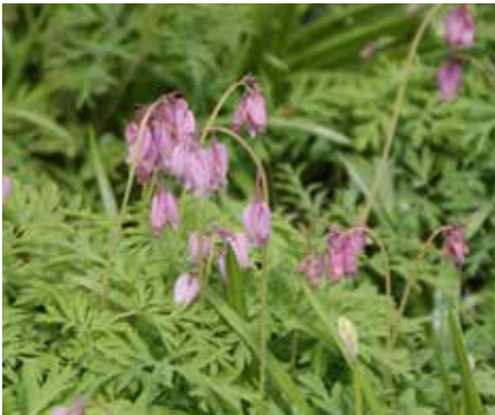
Dicentra formosa Western Bleeding Heart