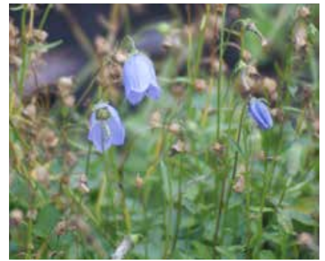
Campanula cochlearifolia Fairy Thimbles