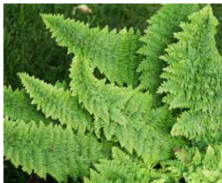
Polystichum setiferum 'Divisilobum' Soft Shield Fern