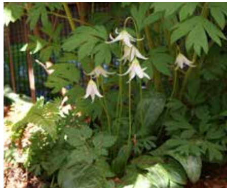
Erythronium montanum Avalanche Lily