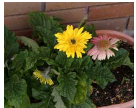
Gerbera x hybrida