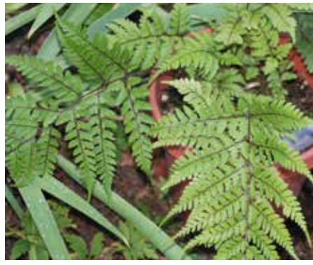
Athyrium otophorum Asian Lady Fern