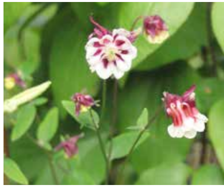
Aquilegia x hybrida Hybrid Columbine