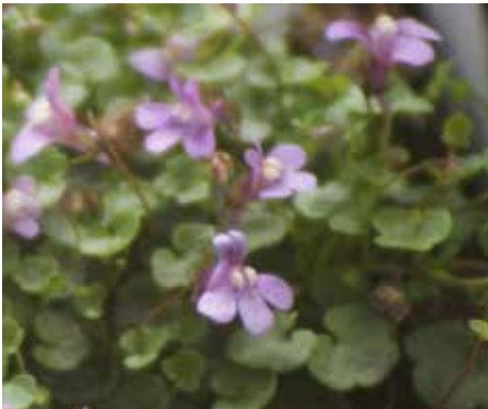
Cymbalaria aequitriloba Pennywort