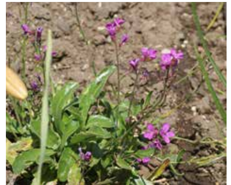
Arabis blepharophylla Rose Rockcress