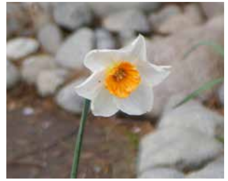
Narcissus Division 3: Small Cup