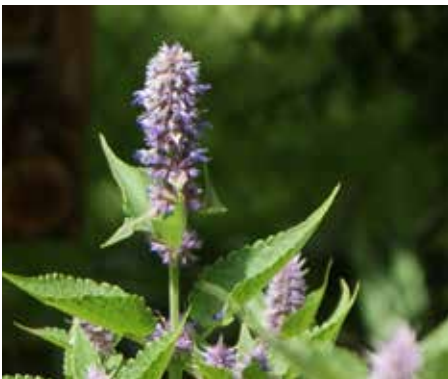
Agastache foeniculum Anise Hyssop