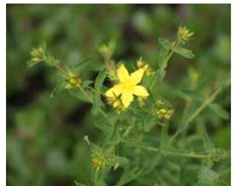
Hypericum perforatum St. John's Wort