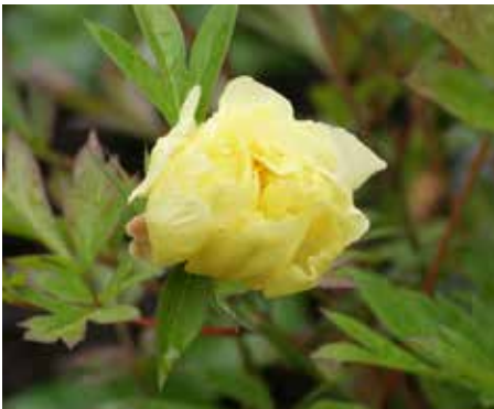
Paeonia 'Bartzilla' Itoh Hybrid Peony