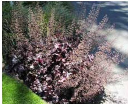
Heuchera micrantha f. diversifolia 'Palace Purple'