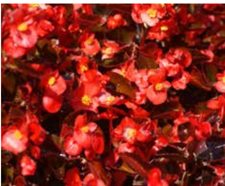
Begonia x semperflorens Wax Begonia