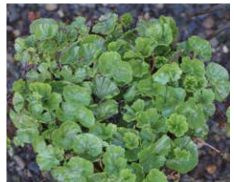
Gunnera magellanica Devil's Strawberry