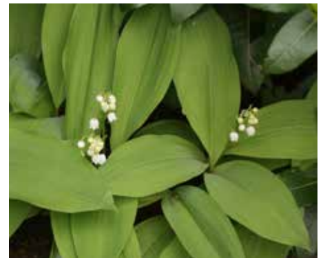
Convallaria majalis Lily of the Valley