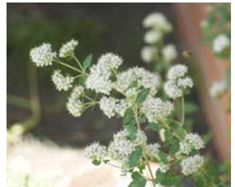
Mentha x piperita Peppermint