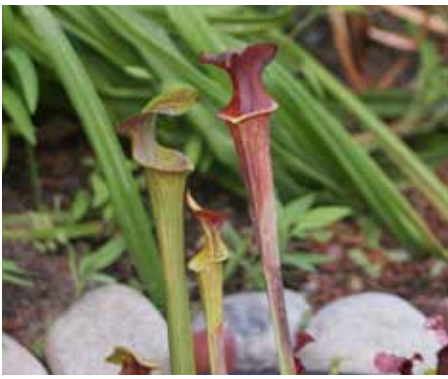
Sarracenia hybrid Pitcher Plant