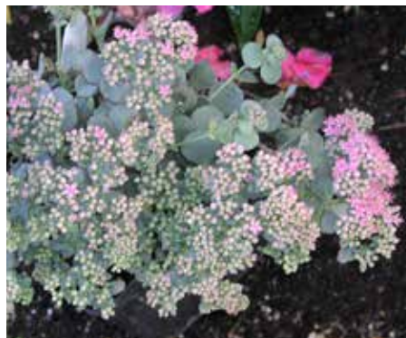
Sedum sieboldii Stonecrop