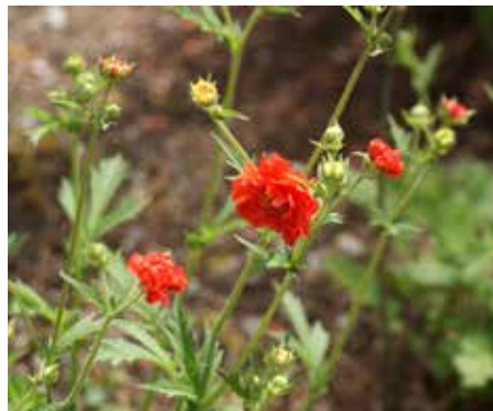
Geum chiloense Avens