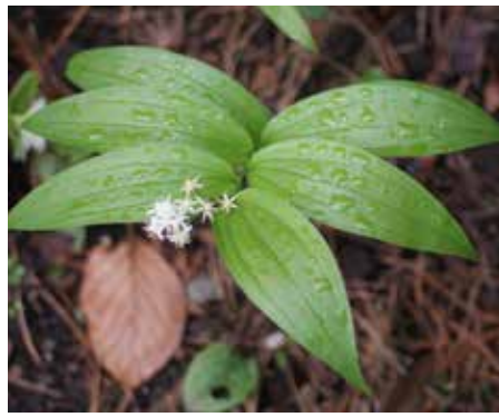
Maianthemum stellatum Starry False Solomon's Seal