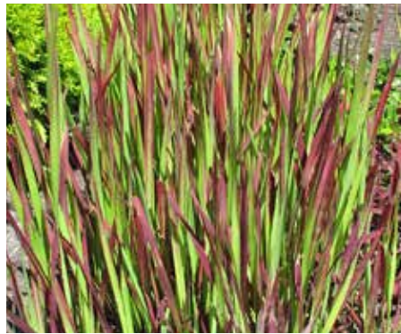
Imperata cylindrica 'Red Baron' Japanese Blood Grass