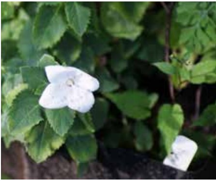
Platycodon grandiflorus Balloon Flower