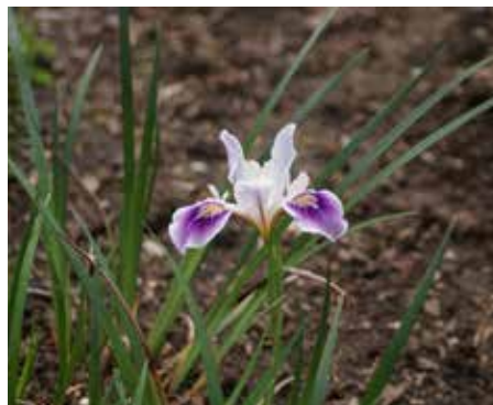
Iris Pacific Coast Hybrid