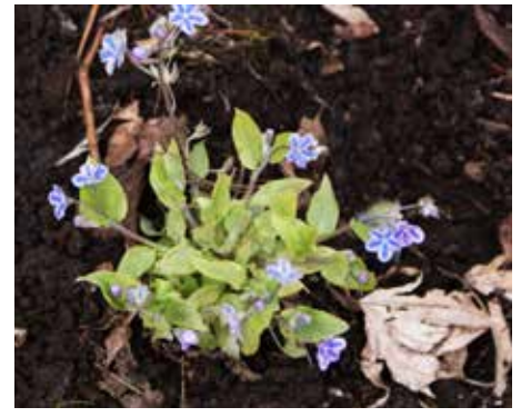
Omphalodes cappadocica Navelwort