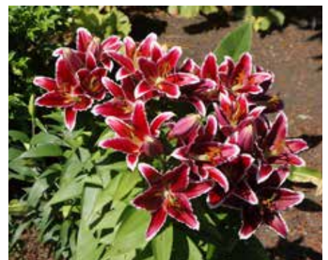
Lilium Oriental Hybrid 'Stargazer'