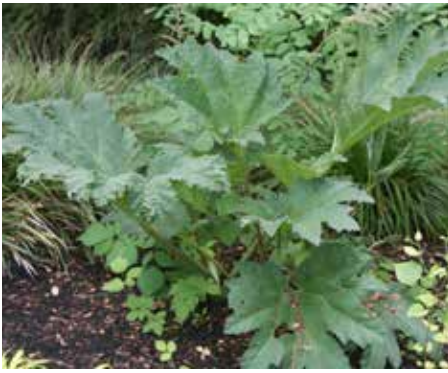
Gunnera tinctoria Chilean Prickly Rhubarb