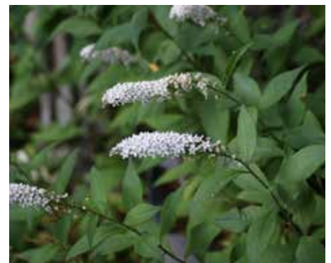
Lysimachia clethroides Gooseneck Loosestrife