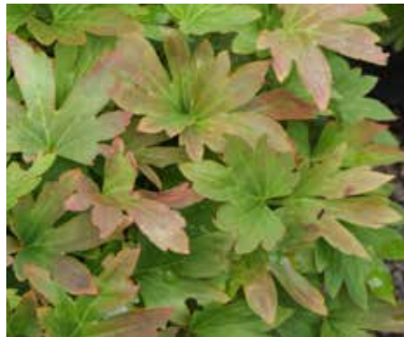
Mukdenia rossii 'Karasuba'