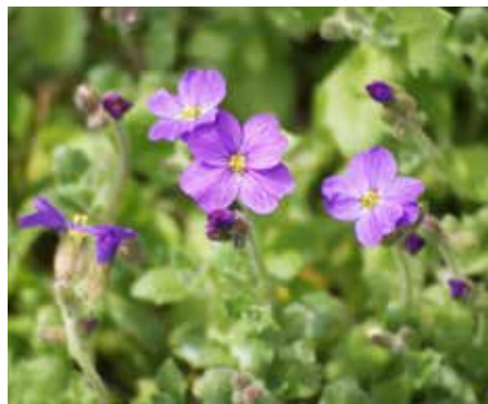
Aubrieta deltoidea Purple Rockcress