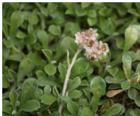
Antennaria dioica Pussytoes