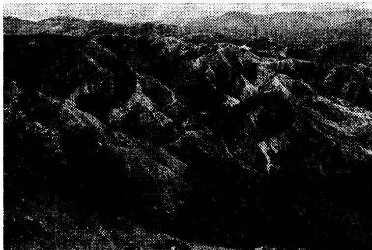
Fig. 2 View of mountains from second camp at about 1300 m alt.; mostly covered by the grasses and sparsely by pine trees.

the summit ridge of Mt Burnay, which was now in sight. Passing through sparse pine forest on rocky slopes, we found a patch of mossy forest laden with such epiphytes as Ctenopteris solida , Oleandra benguetensis , Polypodium argutum , and Crypsinus whitfordii . Most of the fronds of the Oleandra and the Polypodium had abscised and we collected them from both the branches and the ground. At the summit ridge of Burnay at about 1900 m we discovered Dennstaedtia hirsuta , and from there descended to the mining camp just north of the ridge and at an elevation of 1700 m.