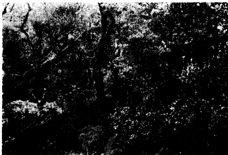
Fig. 4 Mossy forest at about 1950 m alt.

The morning of 4 December found us completely immersed in clouds and in the absence of any trail we were able to make progress only with considerable difficulty. Once we were confronted with a steep descent in three directions and had to explore