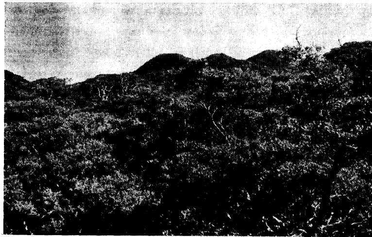
Fig. 5 A view of ridge near the summit of Mt Burnay at about 2000 m alt.

blindly for several hours to find the narrow connecting ridge which finally brought us to one of the two main summits of Burnay, over 2000 m. In the late afternoon, the clouds lifted momentarily and we were able to see clearly for the first time Mt Sicapoo to the north and the steep intervening ridges and ravines. We estimated that it would require another three or four days to reach Sicapoo, a horizontal distance of only 7 km, if the weather were clear and we had ample supplies, which of course we did not. For water, we were forced to use the muddy liquid from wallows of wild pigs, first subjecting it to vigorous boiling.