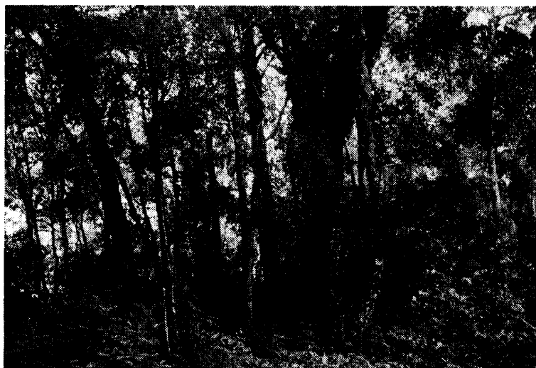
Fig. 3 Evergreen forest at about 1300 m alt.

the summit ridge of Mt Burnay, which was now in sight. Passing through sparse pine forest on rocky slopes, we found a patch of mossy forest laden with such epiphytes as Ctenopteris solida , Oleandra benguetensis , Polypodium argutum , and Crypsinus whitfordii . Most of the fronds of the Oleandra and the Polypodium had abscised and we collected them from both the branches and the ground. At the summit ridge of Burnay at about 1900 m we discovered Dennstaedtia hirsuta , and from there descended to the mining camp just north of the ridge and at an elevation of 1700 m.