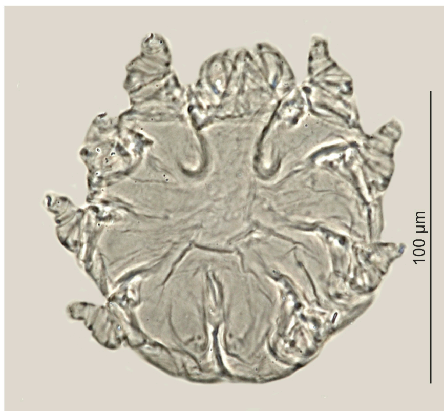
Figure 3. Psorergatoides kerivoluae , female.

* It is probably that Giesen [4] obtained measurements of the specimens described by Fain [17]. ** Fain [17] and Giesen [4] measured the width of the body. *** Fain [17] described them as 5 pairs of very small circles each centered by a point which appears to be a very fine and very short hair.