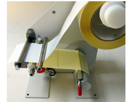
Label Threading Path

OPTIONAL LABEL COUNTER: The optional Label Counter will add one count to the displayed number for each label that is dispensed. This Option is available only factory installed in new units.