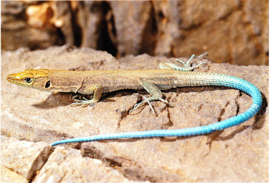
Fig. 236: Omanosaura cyanura , eastern Hajar, Oman.