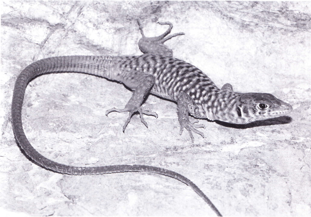
Fig. 240: Omanosaura jayakari , Environment and Protected Areas Authority, Arabia's Wildlife Centre, Sharjah, UAE, captive specimen.