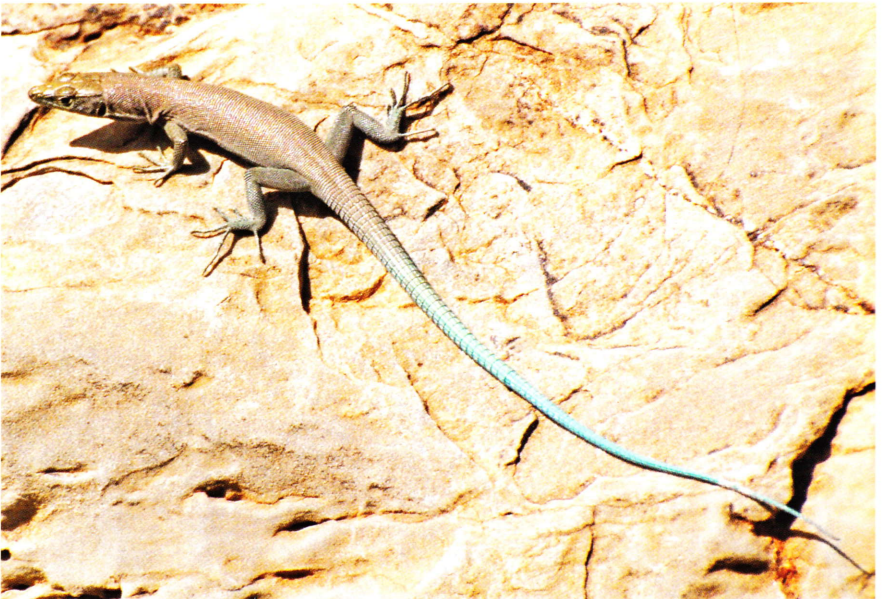
Fig. 237: Omanosaura cyanura , Jebel Akhdar, Oman.