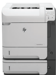
HP LaserJet Enterprise 600 Printer M603xh