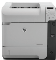
HP LaserJet Enterprise 600 Printer M603dn