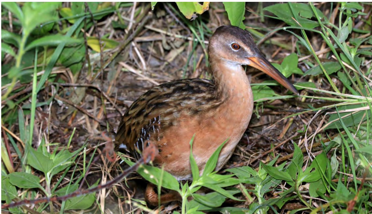
King Rail, Alan Schmierer/CC0 1.0

Navassa Island (administered by the USFWS as a NWR)