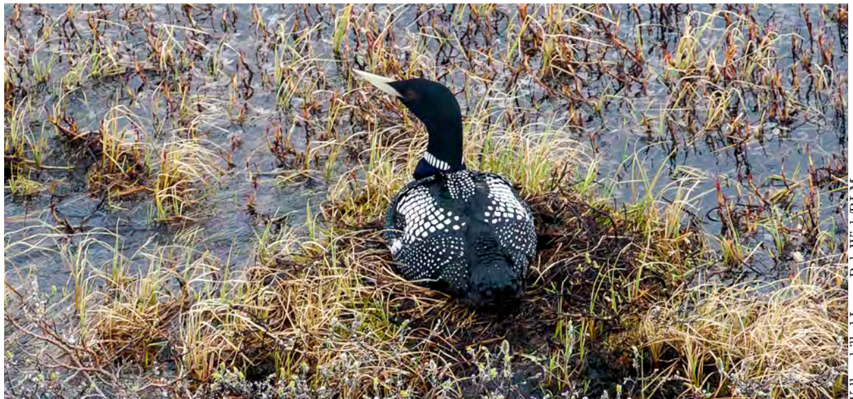
Yellow-billed Loon