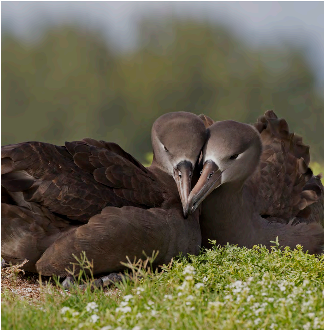
Black-footed Albatross pair

Scores ranging from one to five were assigned to each of six assessment factors, which are presented below along with scoring criteria (see Panjabi et al. 2019 for details). Data on these six factors were recently updated for shorebirds (U.S. Shorebird Conservation Partnership 2016), landbirds (Partners in Flight 2019) and waterbirds (BirdLife International 2015; Wetlands International 2015; Partners in Flight 2019; L. Wires, unpublished data).