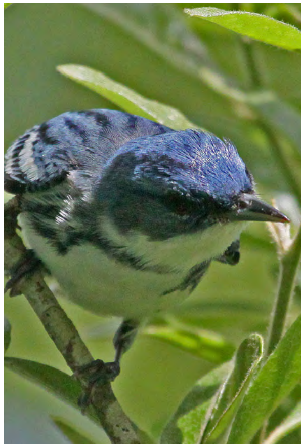
Cerulean Warbler

Because it is mandated by law and produced by the USFWS, federal agencies, international NGOs and foreign governments view the BCC list as the official USA Government position on migratory nongame birds of conservation concern. The BCC list is also used to identify priority wetland birds for evaluating North American Wetlands Conservation Act proposals, used in scoring of Neotropical Migratory Bird Conservation Act proposals, and referenced in Executive Order 13186, Responsibilities of Federal Agencies to Protect Migratory Birds. To promote more consistency among organizations developing various lists of birds of conservation concern, the BCC 2021 closely followed the methods used to generate the Watch List for the 2014 State of the Birds (Rosenberg et al. 2014), 2016 Partners in Flight Landbird Conservation Plan (Rosenberg et al. 2016) and Avian Conservation Assessment Database (Partners in Flight 2019). However, the BCC 2021 differs somewhat from these lists because of its unique scope and mandate.