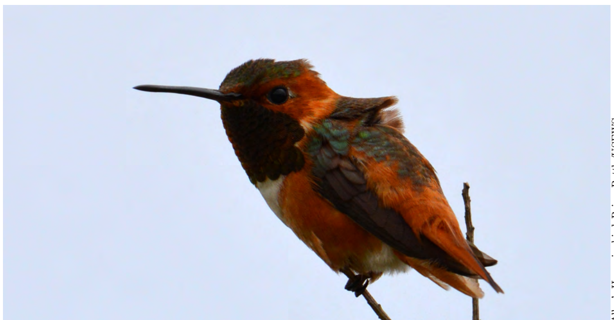
Allen's Hummingbird

Appendix 2. Numbers of Birds of Conservation Concern 2021, non-migratory birds on the Watch Lists in the 2014 State of the Birds (Rosenberg et al. 2014) or Avian Conservation Assessment Database (Partners in Flight 2019), species or populations listed as threatened or endangered under the ESA, and extinct species or populations for the Continental USA, Puerto Rico and the Virgin Islands, and Hawaii and the Pacific Islands. Shared taxa assigned to breeding area list or by greatest abundance. 47