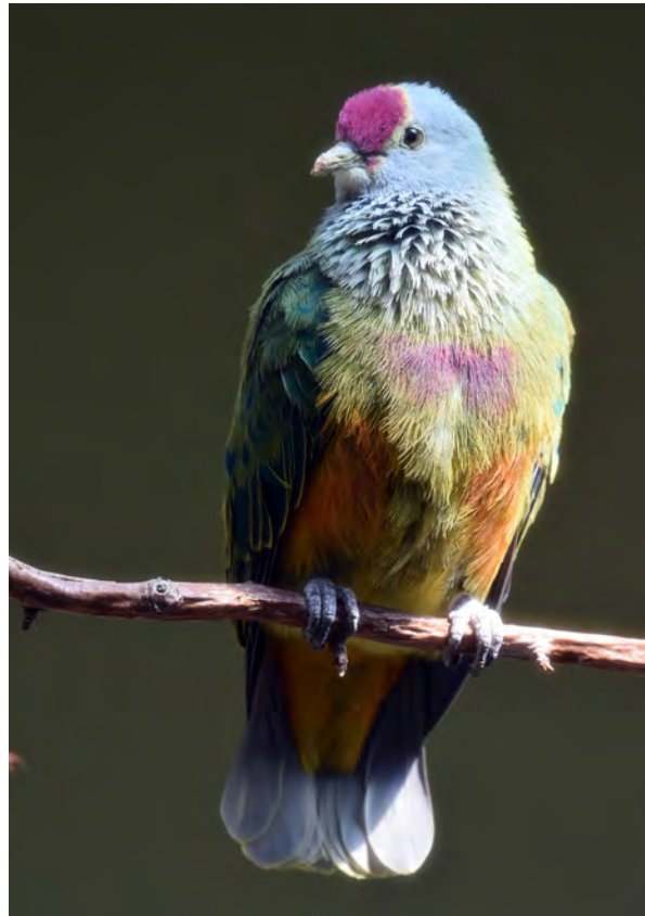
Mariana Fruit-dove