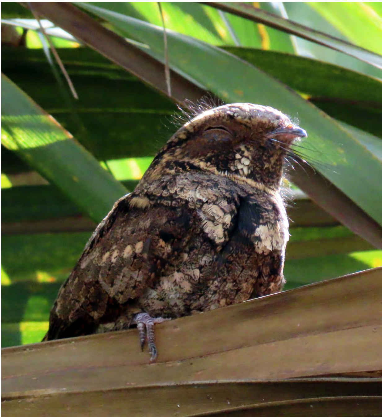
Eastern Whip-poor-will

Although all of the bird taxa included in the BCC 2021 are priorities for conservation action, this list makes no finding with regard to whether they warrant consideration for ESA listing. Our goal is to avert the need for additional ESA bird listings by implementing proactive management and conservation actions. We recommend that these lists be consulted in accordance with Executive Order 13186, Responsibilities of Federal Agencies to Protect Migratory Birds. The BCC 2021 is intended to stimulate coordinated and collaborative proactive conservation actions among federal, state, tribal and private partners. Many of the taxa identified herein are targets of ongoing conservation attention by national and international initiatives (e.g., Partners in Flight, U.S. Shorebird Conservation Partnership), Migratory Bird Joint Ventures, state and federal natural resource agencies, NGOs, and other partnerships.