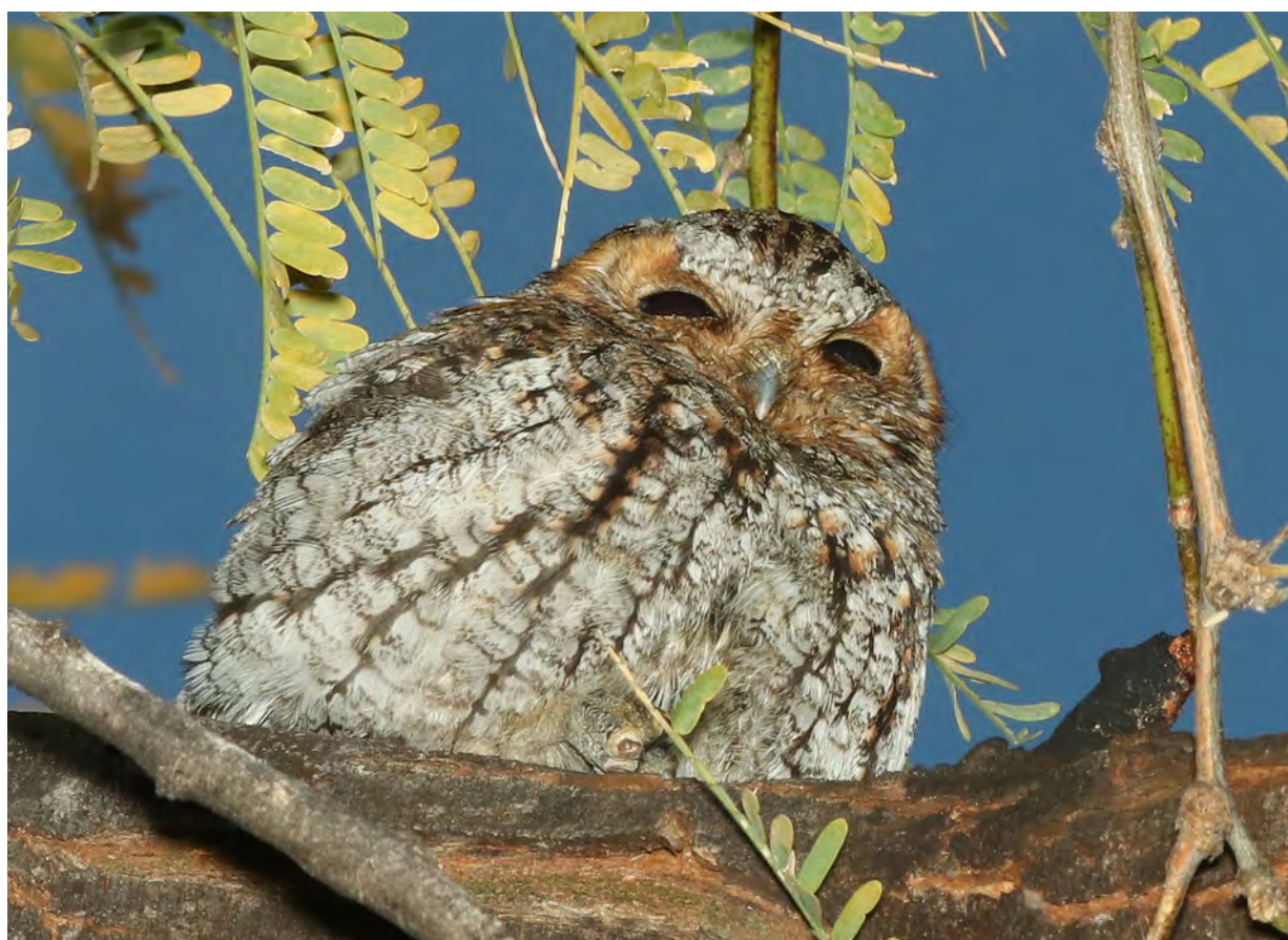
Flammulated Owl

5 Ducks; grebes; rails, gallinules and coots; limpkins; cranes; loons; storks; cormorants; pelicans; and herons and egrets.