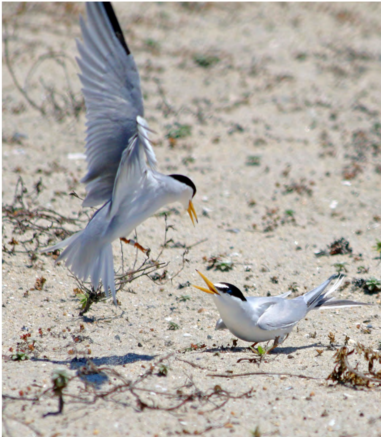
Least Tern

1 Continental list and (additional BCR-scale taxa).