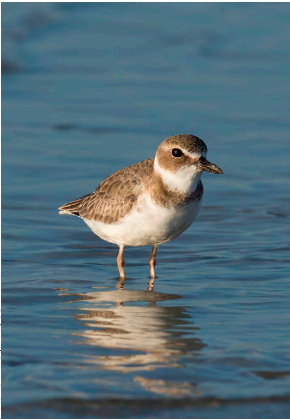
Wilson's Plover.