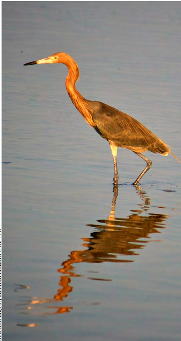
Reddish Egret