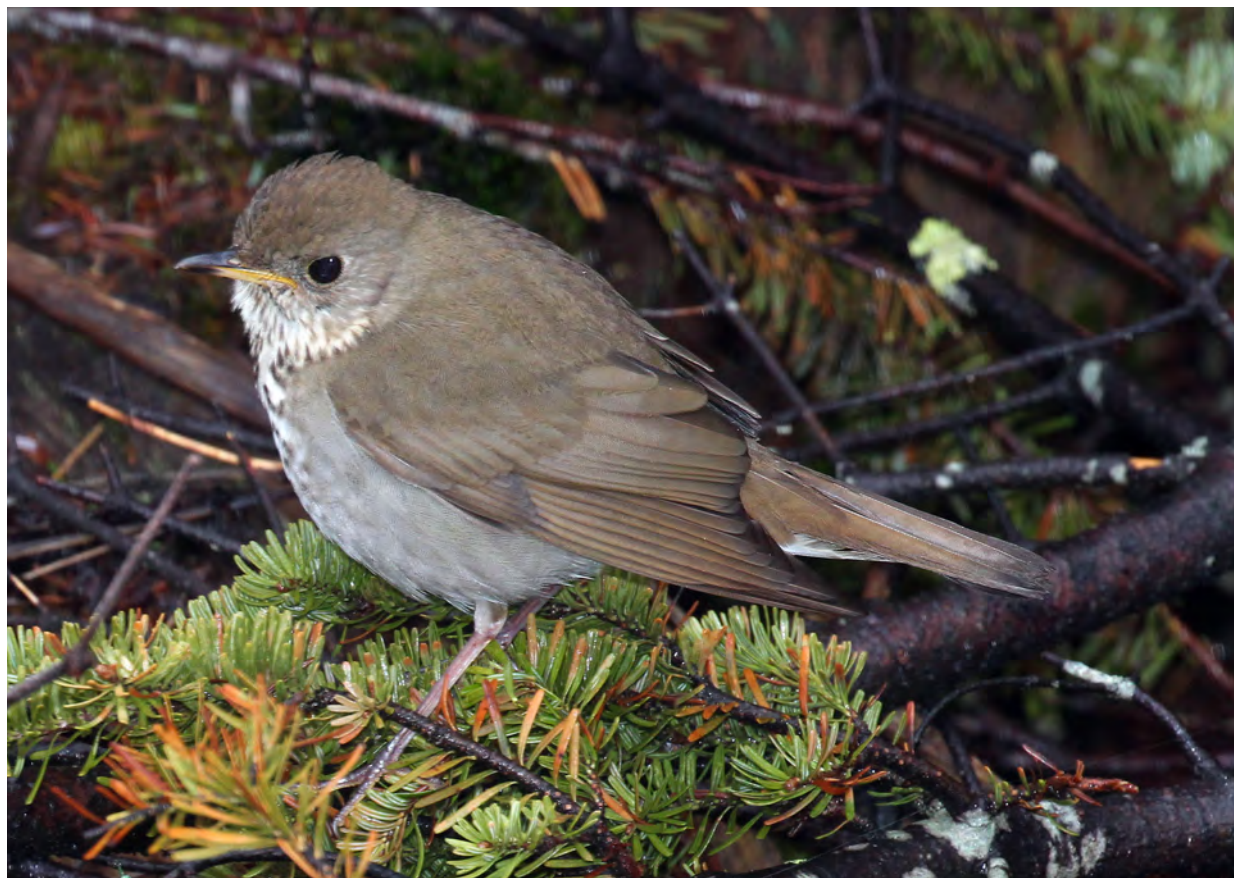
Bicknell's Thrush