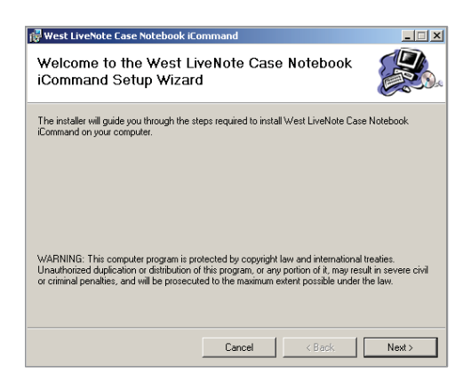
Figure 8. iCommand Setup Wizard dialog box

4. Click Next. The License Agreement dialog box is displayed (Figure 9).