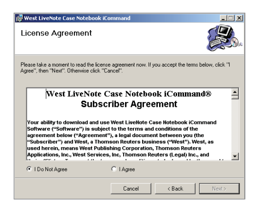
Figure 9. License Agreement dialog box

4. Click Next. The License Agreement dialog box is displayed (Figure 9).