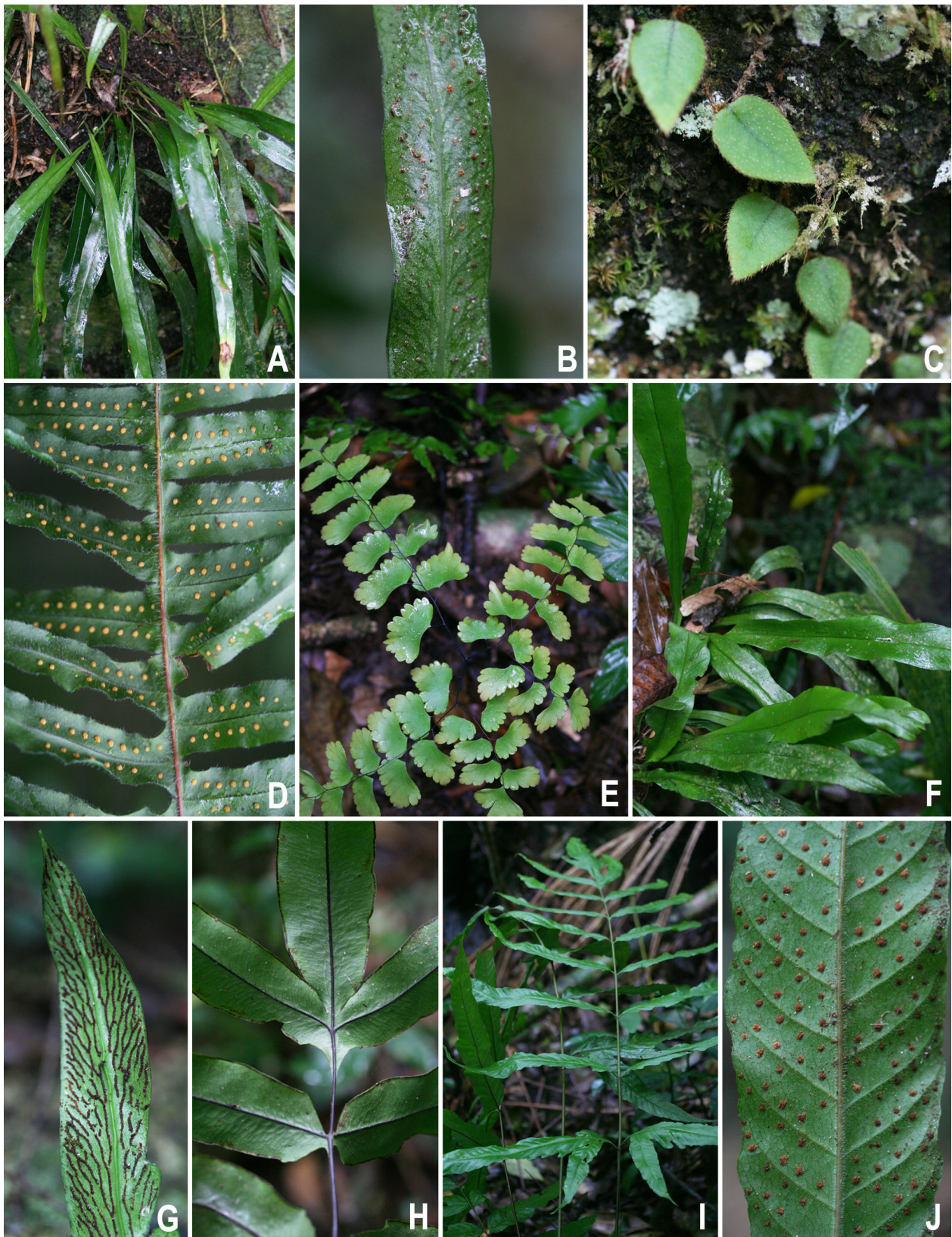
Figure 3. Ferns recorded in the Lagoa do Peri Municipal Park. A–B. Campyloneurum rigidum . A. Habit. B. Fertile frond, abaxial view. C. Microgramma tecta , habit. D. Pecluma chnoophora , fertile frond, abaxial view. E. Adiantum pentadactylon , fronds, adaxial view. F–G. Polytaenium cajenense . F. Habit. G. Fertile frond, abaxial view. H. Pteris denticulata , fertile frond, abaxial view. I–J. Tectaria incisa . I. Habit. J. Fertile frond, abaxial view.