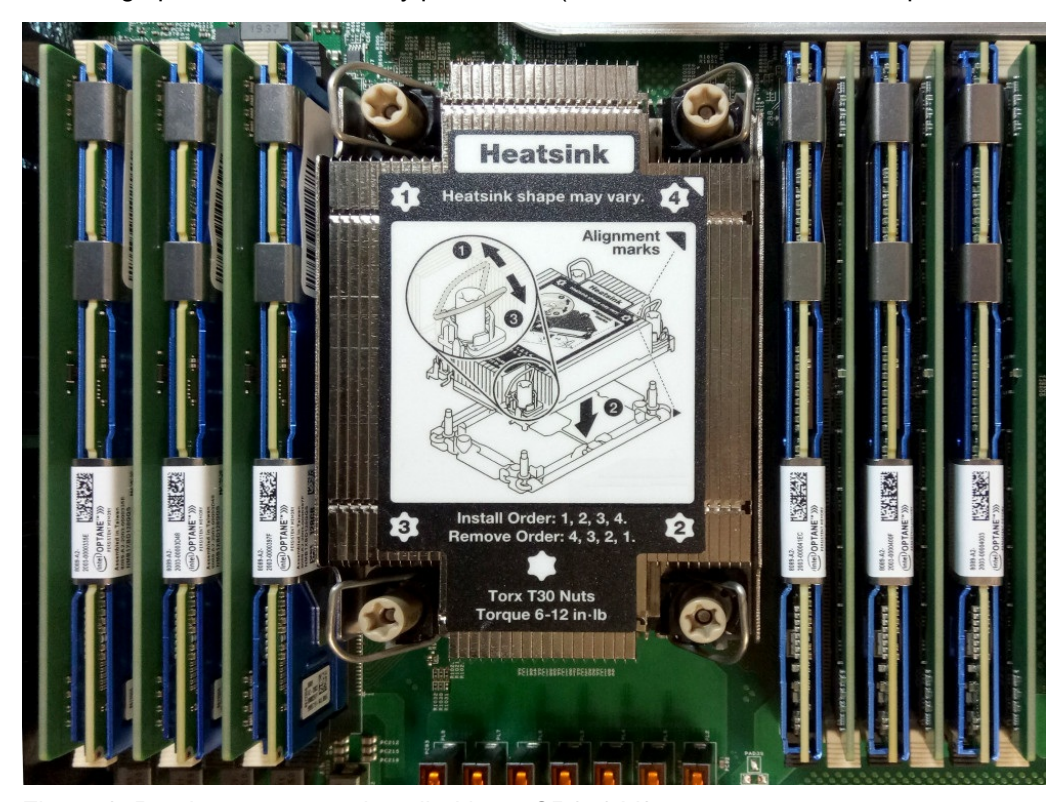
Figure 2. Persistent memory installed in an SR850 V2 server

The third generation Intel Xeon Scalable processors used in the Lenovo ThinkSystem SR850 V2 and SR860 V2 servers support the next generation persistent memory (Pmem). The Intel Optane persistent memory 200 series enables unprecedented memory capacity and the fastest access to persistent memory, delivering up to 4.5TB of memory per socket. (6x 512GB Pmem 200 series plus 6x 256GB DDR4 DRAM).