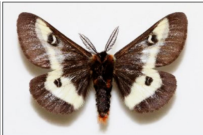
Fig. 6. Hemileuca maia warreni Pavulaan, 2020. Holotype (same specimen), ventral view.