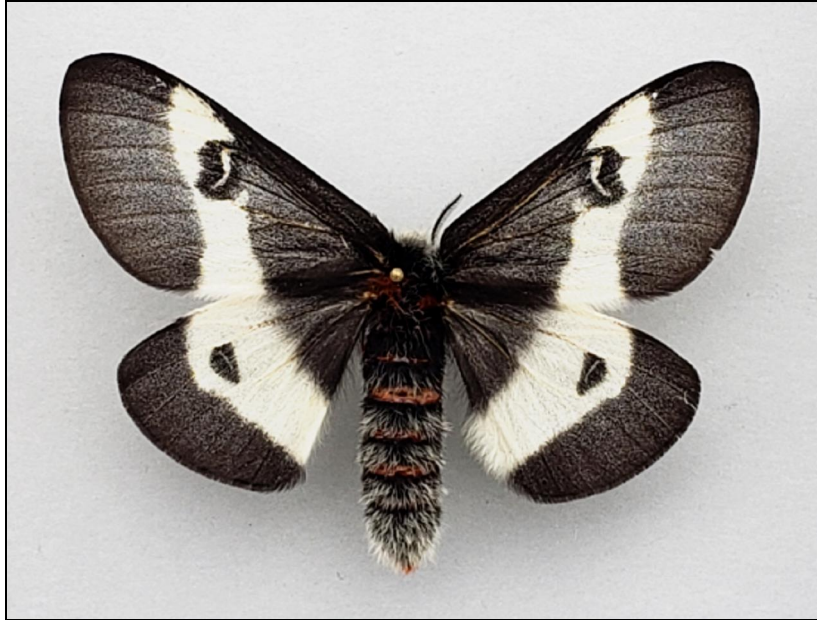
Fig. 12. Hemileuca maia sandra Pavulaan, 2020. Allotype female. Chatsworth, Woodland Township, Burlington Co., N.J. Ex-larva, em: Sep. 28, 2017. Leg. I. Osipov. Dorsal view.