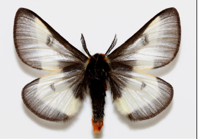
Fig. 10. Hemileuca maia menyanthevora Pavulaan, 2020. Holotype (same specimen), ventral view.