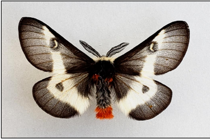
Fig. 1. Hemileuca maia maia Drury (1773). Neotype. Oct. 21, 2017, Edgewood, Long Island, N. Y. Leg. H. Pavulaan Male. Dorsal view.