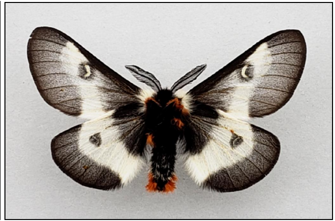
Fig. 2. Hemileuca maia maia Drury (1773). Neotype (same specimen), ventral view.