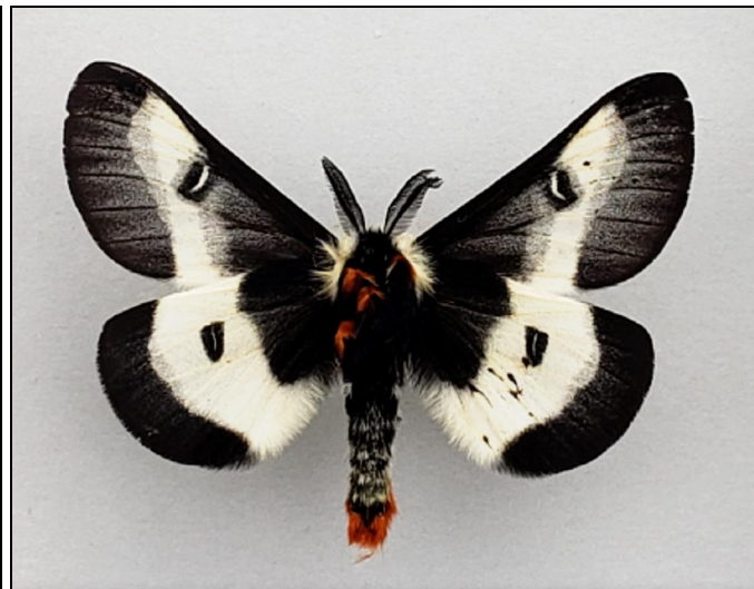
Fig. 4. Hemileuca maia sandra Pavulaan (2020). Holotype (same specimen), ventral view.