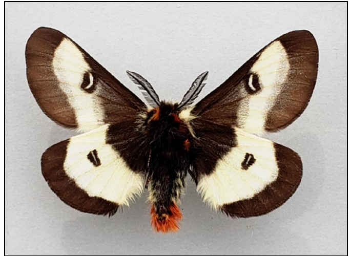
Fig. 8. Hemileuca maia orleans Pavulaan, 2020. Holotype (same specimen), ventral view.