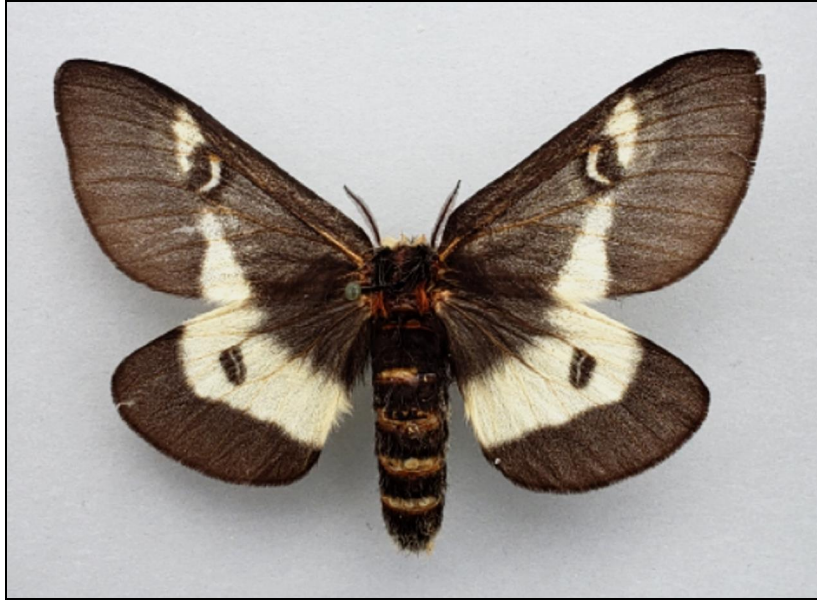
Fig. 14. Hemileuca maia orleans Pavulaan, 2020. Allotype female. Dec. 10, 1998. Ascension Parish, LA. Dorsal view.