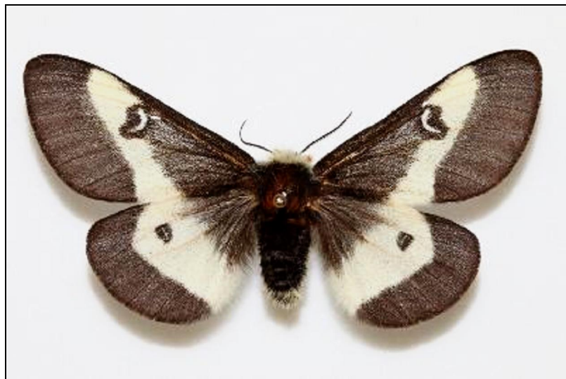
Fig. 13. Hemileuca maia warreni Pavulaan, 2020. Allotype female. Jan. 26, 1985. Deltona, Volusia Co., Florida. Leg. L. C. Dow. Dorsal view.