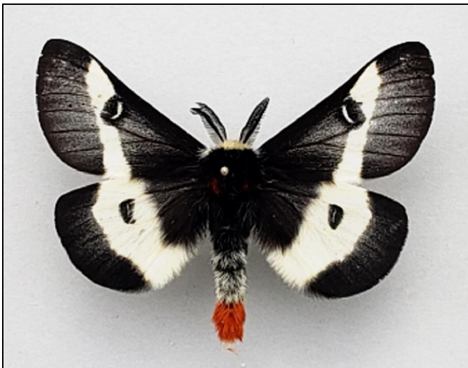
Fig. 3. Hemileuca maia sandra Pavulaan (2020). Holotype. Chatsworth, Woodland Township, Burlington Co., N.J., leg. I. Osipov.