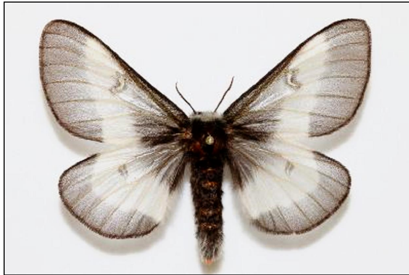
Fig. 15. Hemileuca maia menyanthevora Pavulaan, 2020. Allotype female. Sep. 22, 1985. Brennan Beach Camp, Pulaski, Oswego Co., N.Y. Leg. P. Savage. Dorsal view.