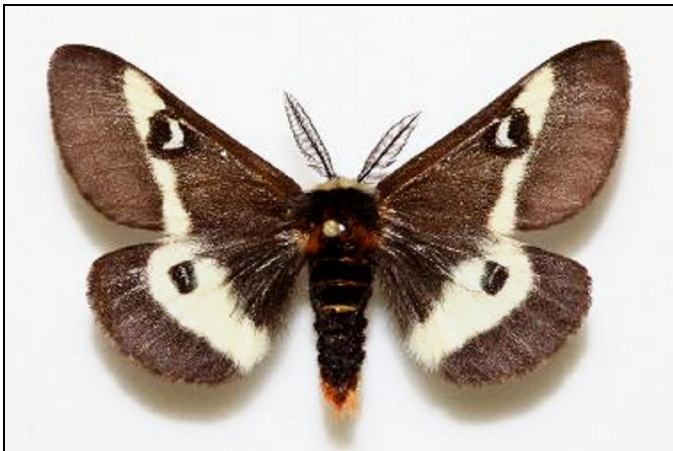
Fig. 5. Hemileuca maia warreni Pavulaan, 2020. Holotype . Jan. 24, 1984. Deltona, Volusia Co., FL. Leg. L. C. Dow. Male. Dorsal view.