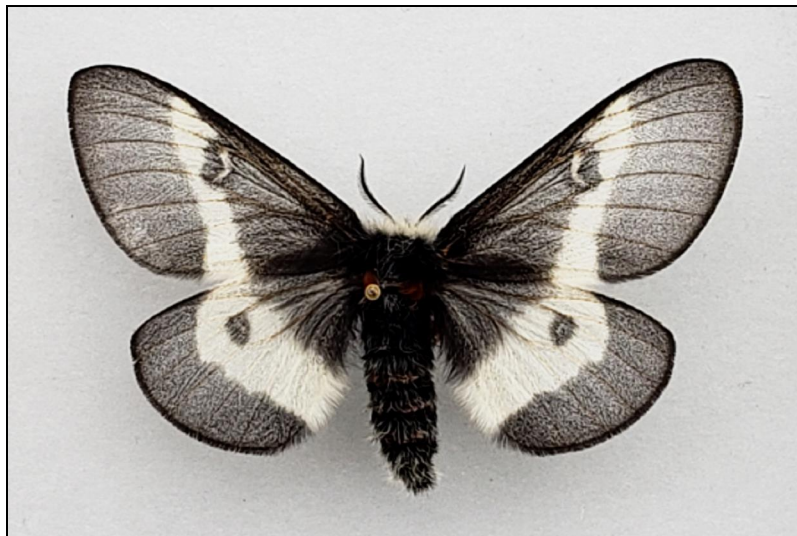
Fig. 11. Hemileuca maia maia Drury (1773). Female. Westhampton, N.Y. Ex-larva, em: Oct. 4, 2017. Leg. H. Pavulaan. Dorsal view.