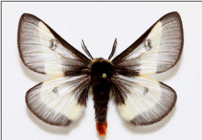
Fig. 9. Hemileuca maia menyanthevora Pavulaan, 2020. Holotype . Sep. 22, 1985. Brennan Beach Camp, Pulaski, Oswego Co., N.Y. Leg. P. Savage. Male. Dorsal view.