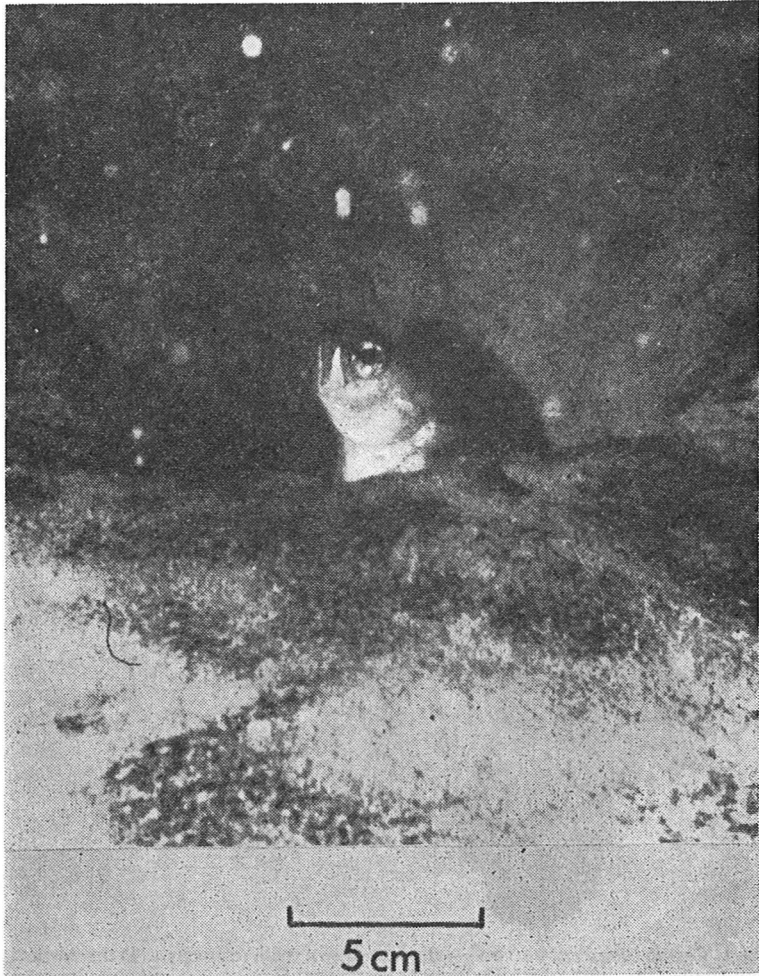
Plate. 1. Large female Cepola rubescens in burrow entrance.