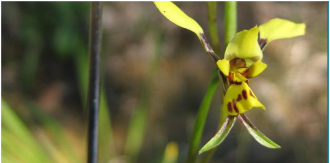
Diuris bracteata.

Diuris bracteata is a small ground orchid commonly known as 'donkey orchid' due to the petals of the flower looking like donkey ears. The flowers are yellow with blackish markings. The orchid is listed as endangered under the Threatened Species Conservation Act 1995 , and fourteen of the fifteen known populations of this species within the Gosford LGA are found within road reserves. This highlights the importance of appropriate roadside management regimes to the long term conservation of these orchids.