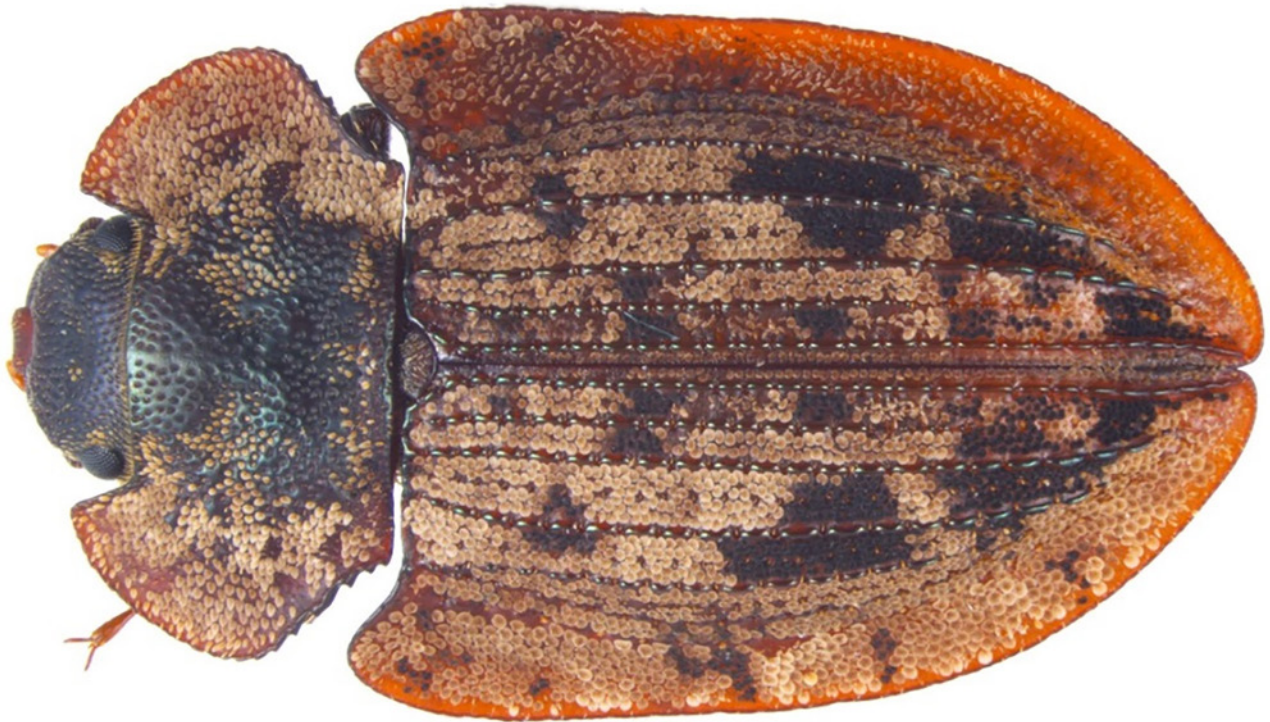
Figure 14. Phanodesta pudica , collected in Stevens Reserve, July 2018 (photo: Max Beatson).

Hydissus vulgaris is a flightless species, endemic to Lord Howe. It is widespread in low and mid elevations, often found in rotting wood or under stones (Reid et al. , 2018a). Length 8–13 mm.