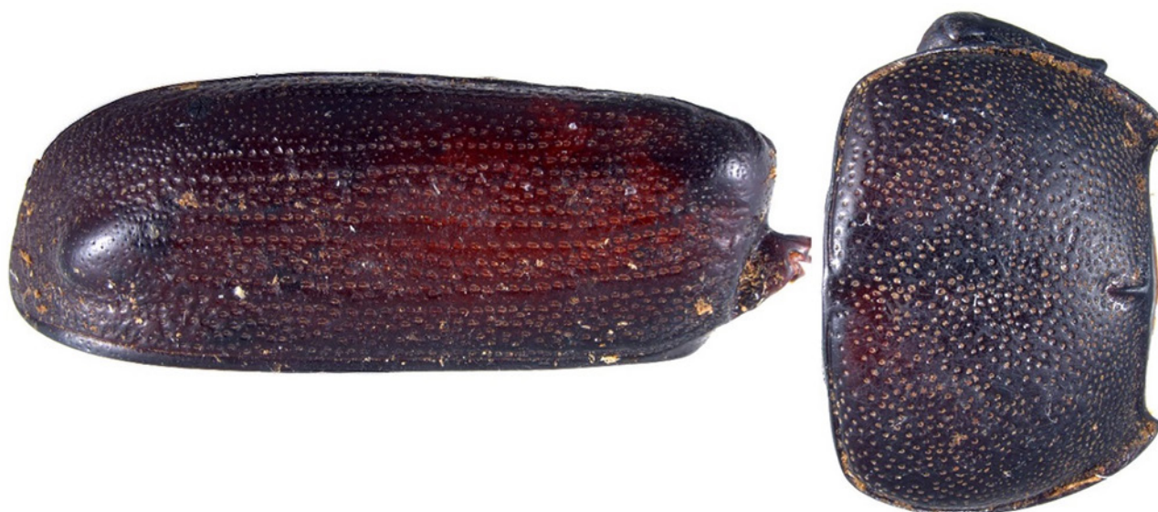
Figure 10. Fragments of an individual of Cryptodus tasmanianus , collected on Blackburn Island, July 2018.

“Stevens Res, 31.5241S 159.0655E, 15 m vic fallen tree, night searching, 25.vii.2018, Reid, Hutton & volunteers”. Additional material (larvae seen, not collected): “Clear Place walk (start), 31.5278S 159.0741E, 29 m, under bark/beating, 27.vii.2018, C Reid & I Hutton”; “Cobbys Corner, Sallywood Swamp, 31.5440S 159.0778E, 8 m, under bark/sifting/swept, 25.vii.2018, Reid, Hutton & volunteers”; “Soldiers Creek, vic 31.5527S 159.0823E, 22 m, in rotten wood, 25.vii.2018, Reid, Hutton & volunteers”.