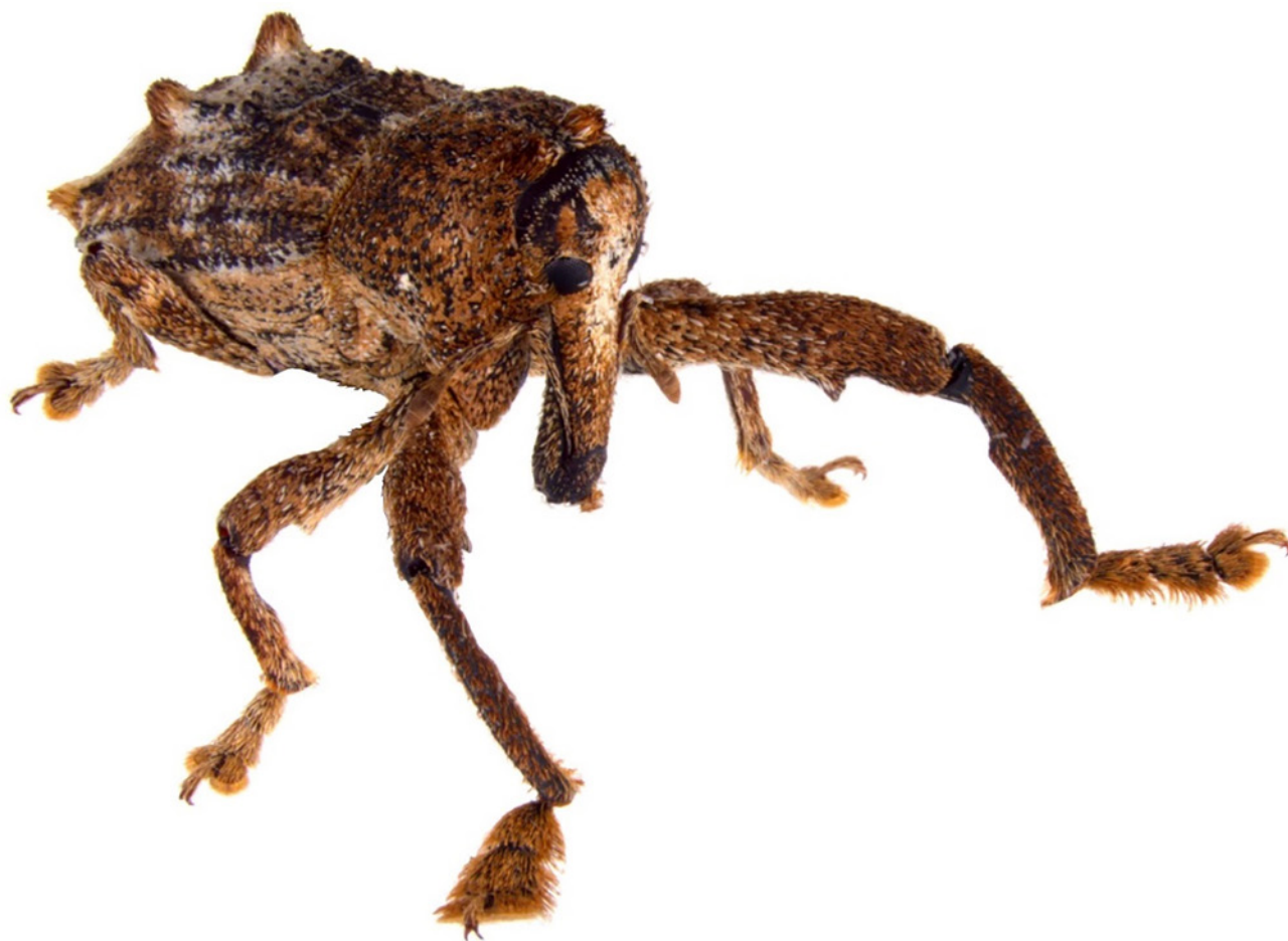
Figure 9. Orthorhinus vagans (specimen collected in 2000).