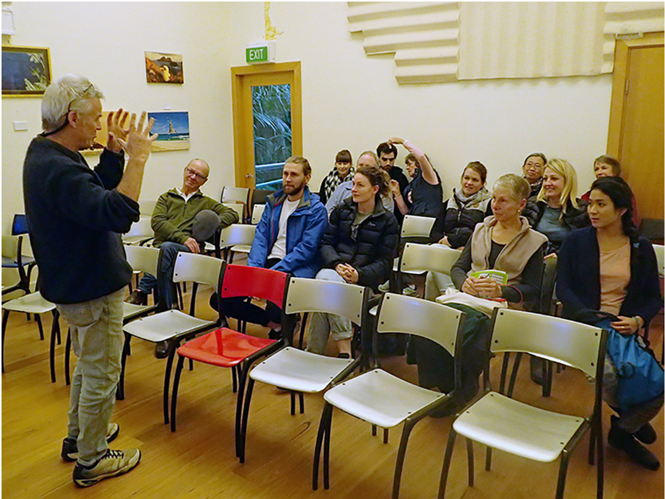
Figure 1. Introductory lecture on “large” beetles of Lord Howe (photo: Ian Hutton).

than would otherwise be available just by the use of specialist scientists occasionally visiting to carry out observations.