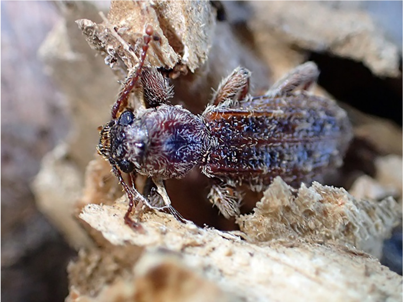
Figure 5. First live Cormodes darwini discovered since 1916.

very large, >3 cm long ( A. spinicollis and Cnemoplites howei (Thomson, 1864)). However all the large prionines seen in collections from Lord Howe (dated 1880–present) belong to a single species and it is most likely that these two names are synonyms, so only one large species is recognised here. Agrianome spinicollis is the largest beetle on the island, and the mature larvae are huge and easily identifiable to this species. Similar smaller larvae may belong to the other species of prionine cerambycid on the island, Howea angulata Olliff, 1889, with 2–2.5 cm long adults, so we have only included records of large larvae. In this survey we targetted the larval habitat of A. spinicollis and larvae of the species were found at many localities. Agrianome spinicollis evidently continues to be generally common in dead wood throughout the lowland forests. Length (of adult): 35–50 mm.