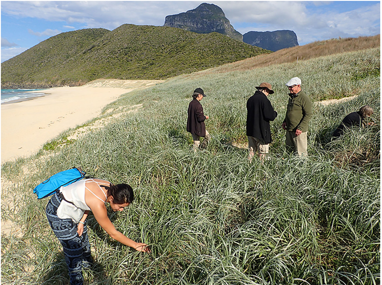
Figure 2. Looking for large beetles in the grassed dunes of Blinky Beach.