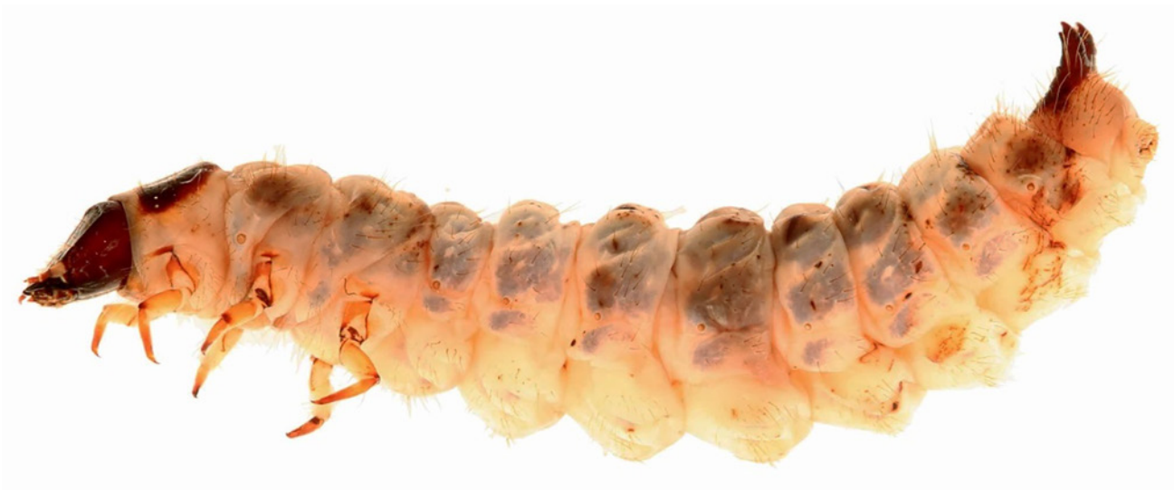
Figure 8. Cormodes darwini mature larva, collected on Blackburn Island, July 2018.