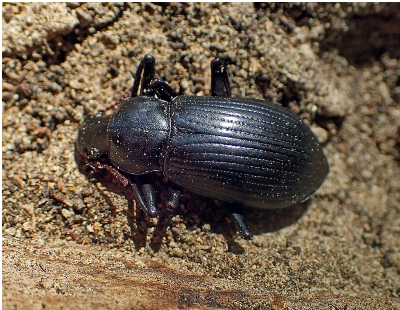
Figure 13. Live adult of Prionesthis sterrha , on Blackburn Island, July 2018.

relatively recent introduction to Lord Howe. Thyreocephalus orthodoxus is a rarely collected species on Lord Howe (there is only one specimen in the Australian Museum, collected at light on the Jetty, in 1979 by Tim Kingston) but our evidence is that it is established there. Both adults and larvae are active predators of other insects and the adults are strong fliers, often flying during daylight (pers. obs. CR). Length 13–14 mm.