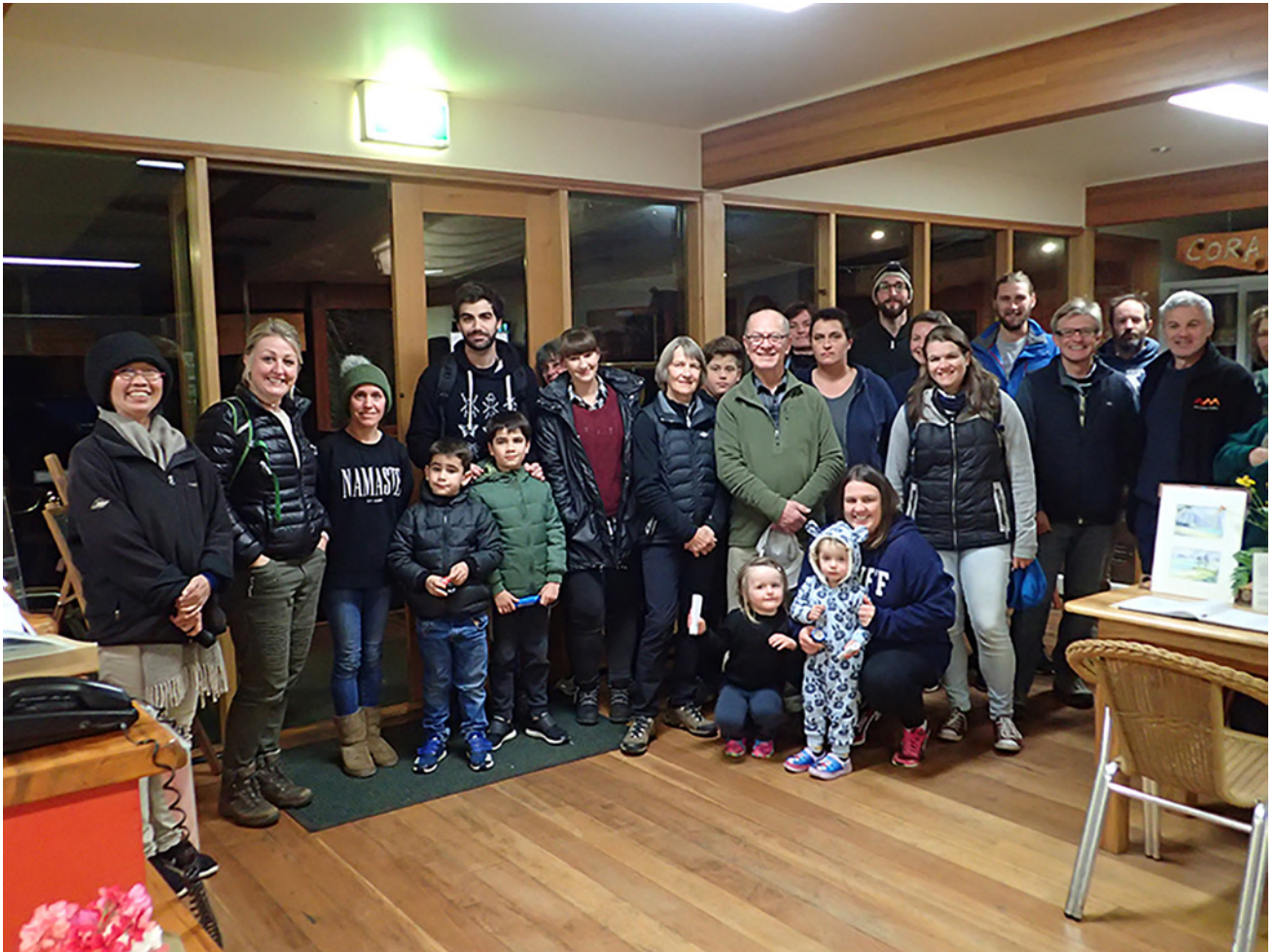
Figure 4. Citizen scientists ready for a night walk to look for large beetles (photo: Ian Hutton).

main island of Lord Howe, where it is a lowland forest species (Reid et al. , 2018a). In 2017 only remains of a single dead specimen were found and concern was expressed that the population may have been affected by drought (Reid et al. , 2018a). We hereby confirm that the species still exists in Stevens Reserve, which seems to be its main population on the island. Length 8–10 mm.