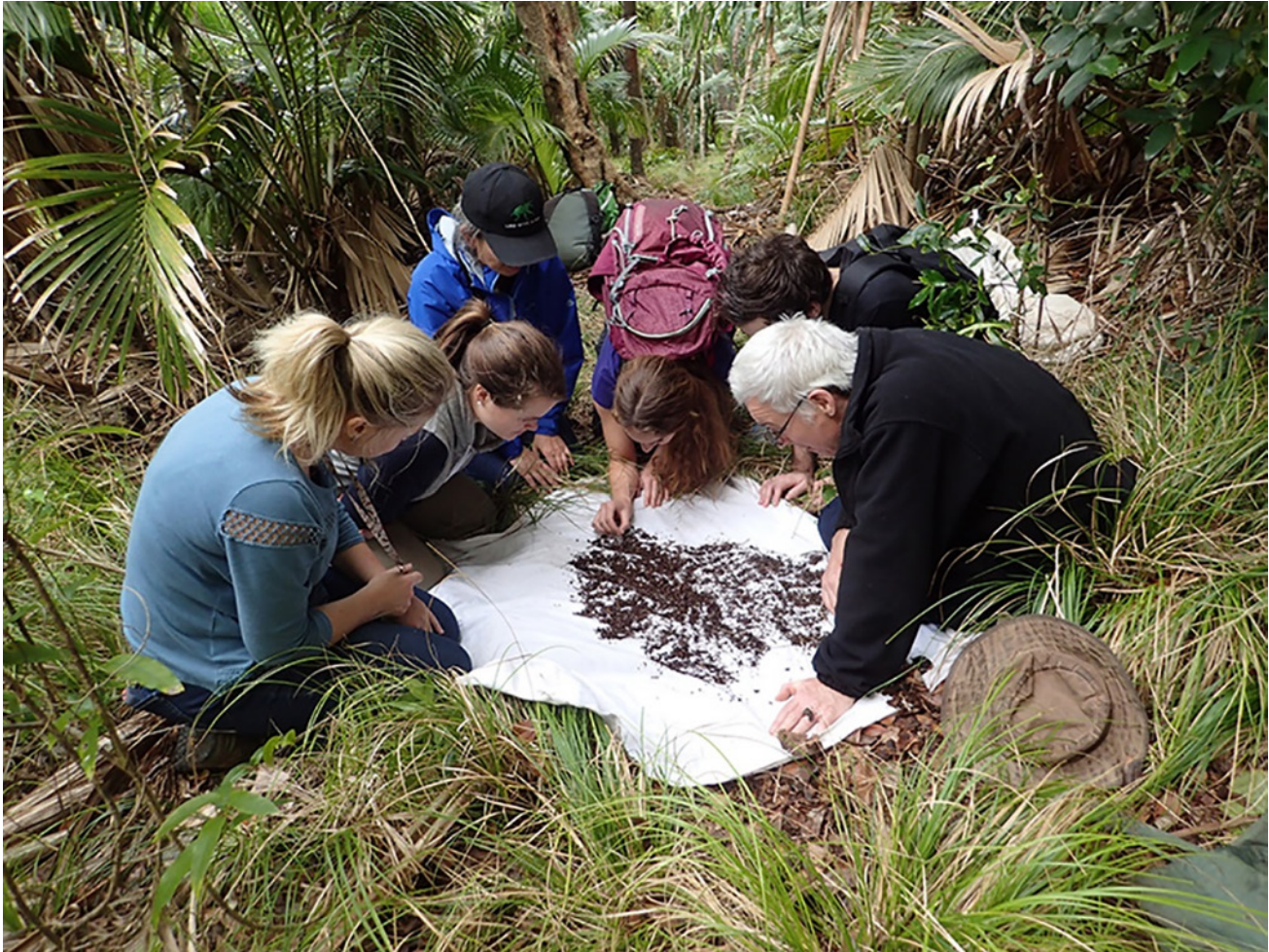
Figure 3. Citizen scientists examining the contents of a leaf litter sifter in forest.

authors as soon as they had captured something, so that they could be briefed on the significance of their find.