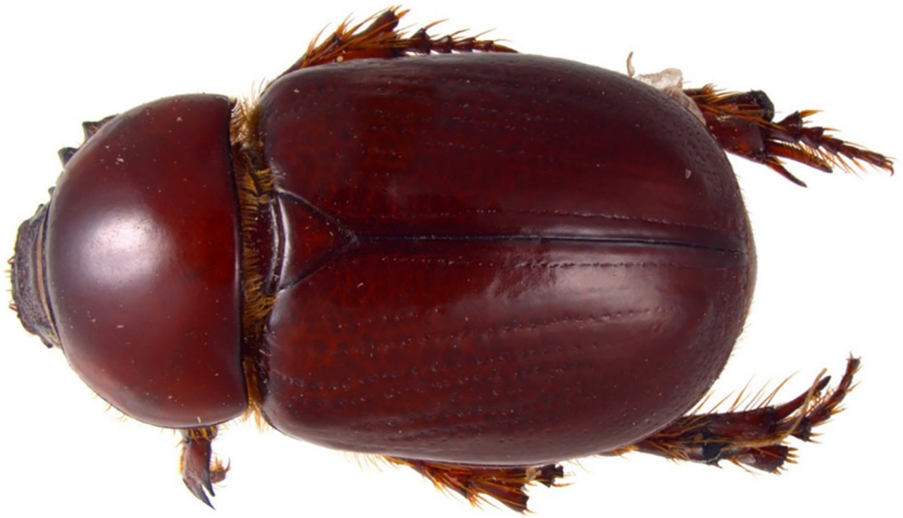
Figure 11. Pimelopus noctis (specimen collected in 2000).

Pimelopus fischeri is restricted to the southwest Pacific in New Caledonia, Norfolk Island and Lord Howe Island (Carne, 1957). It is a species in lowland forest on Lord Howe, with recent records (Reid et al. , 2018a). Length 16–20 mm.