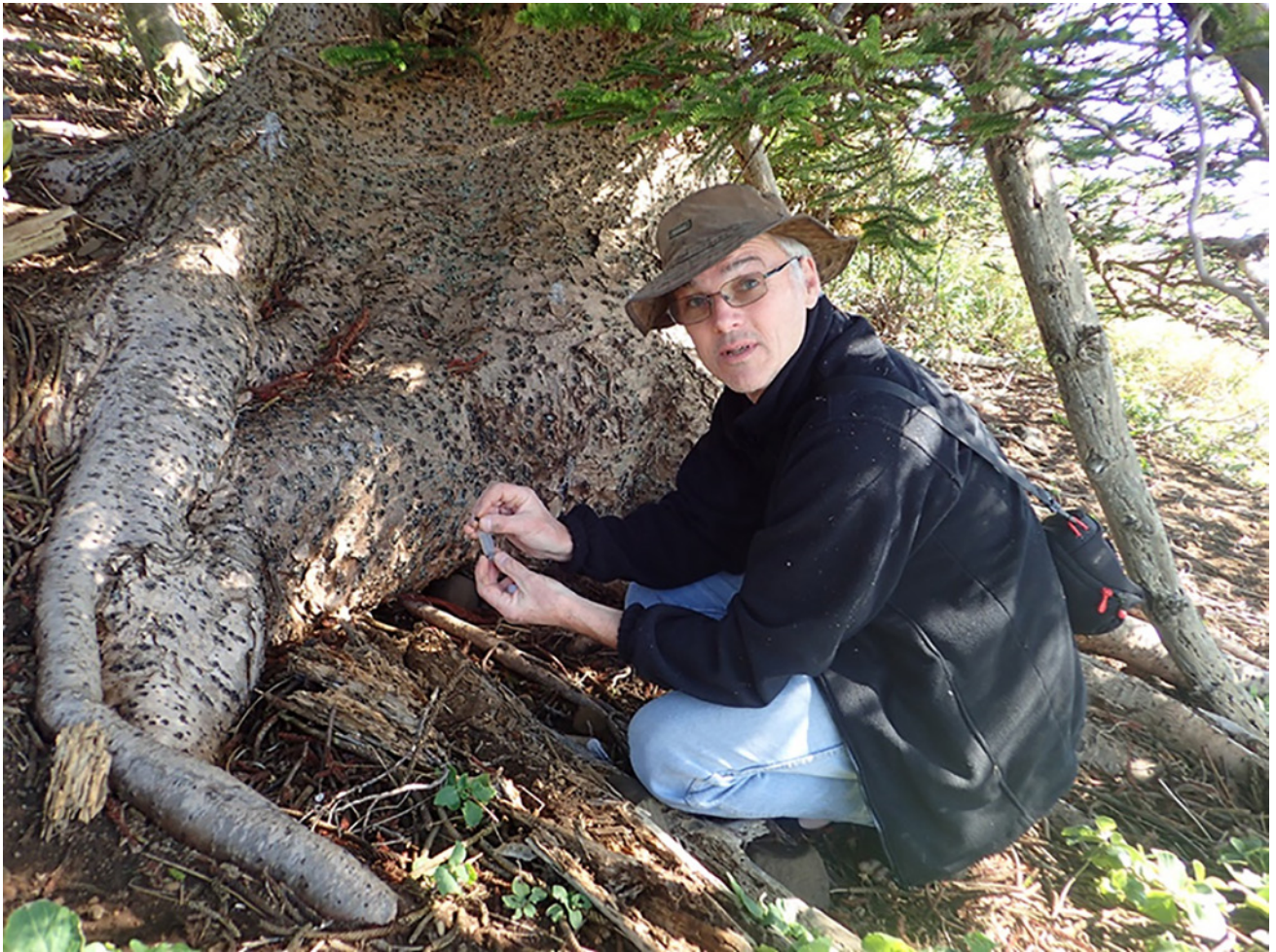
Figure 6. Cormodes darwini safely in vial at discovery site on Blackburn Island.