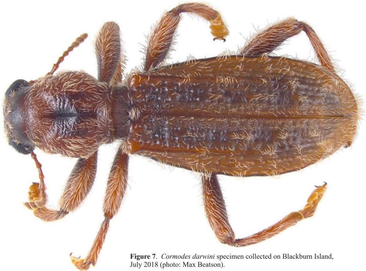
Figure 7. Cormodes darwini specimen collected on Blackburn Island, July 2018.