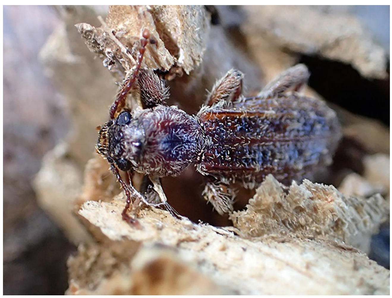
Figure 5. First live Cormodes darwini discovered since 1916.

very large, >3 cm long (A. spinicollis and Cnemoplites howei (Thomson, 1864)). However all the large prionines seen in collections from Lord Howe (dated 1880–present) belong to a single species and it is most likely that these two names are synonyms, so only one large species is recognised here. Agrianome spinicollis is the largest beetle on the island, and the mature larvae are huge and easily identifiable to this species. Similar smaller larvae may belong to the other species of prionine cerambycid on the island, Howea angulata Olliff, 1889, with 2–2.5 cm long adults, so we have only included records of large larvae. In this survey we targetted the larval habitat of A. spinicollis and larvae of the species were found at many localities. Agrianome spinicollis evidently continues to be generally common in dead wood throughout the lowland forests. Length (of adult): 35–50 mm.