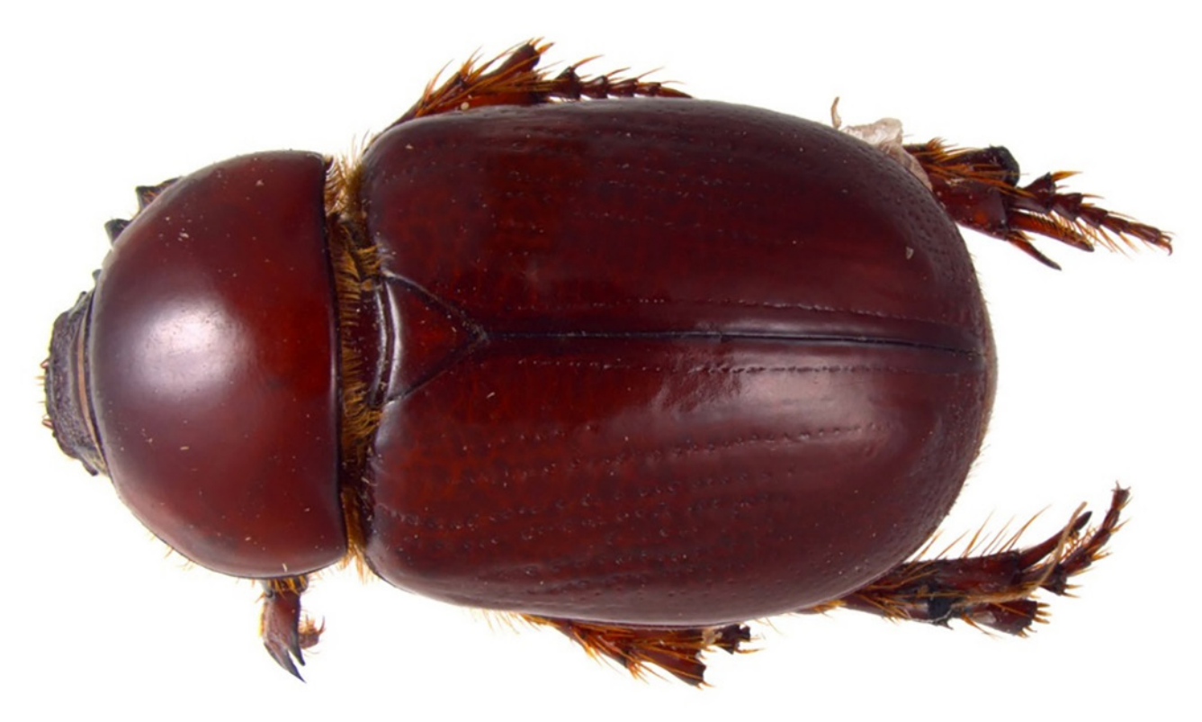
Figure 11. Pimelopus noctis (specimen collected in 2000).

Pimelopus fischeri is restricted to the southwest Pacific in New Caledonia, Norfolk Island and Lord Howe Island (Carne, 1957). It is a species in lowland forest on Lord Howe, with recent records (Reid et al. , 2018a). Length 16–20 mm.