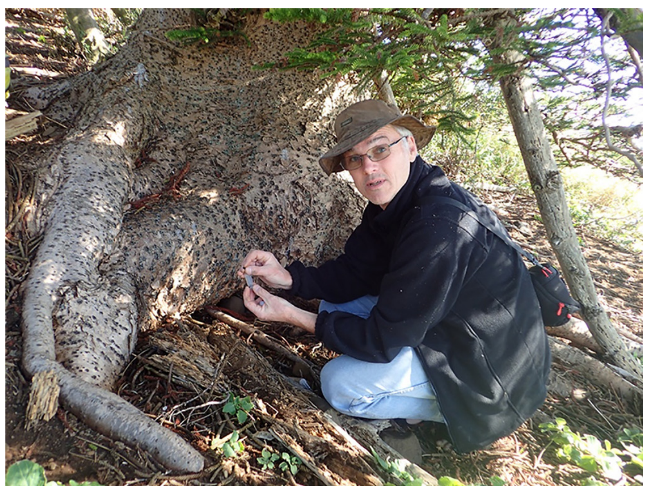
Figure 6. Cormodes darwini safely in vial at discovery site on Blackburn Island (photo, Ian Hutton).