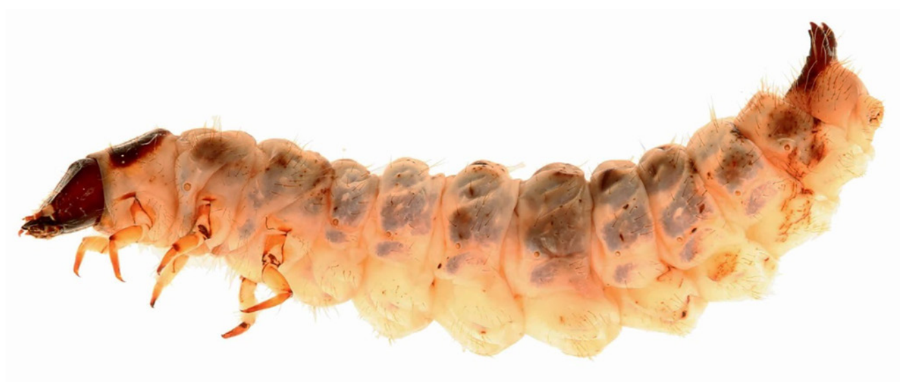
Figure 8. Cormodes darwini mature larva, collected on Blackburn Island, July 2018.