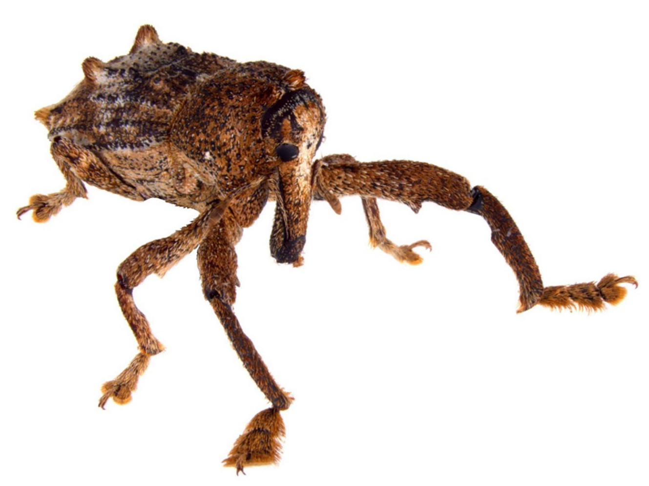
Figure 9. Orthorhinus vagans (specimen collected in 2000) (photo: Max Beatson).