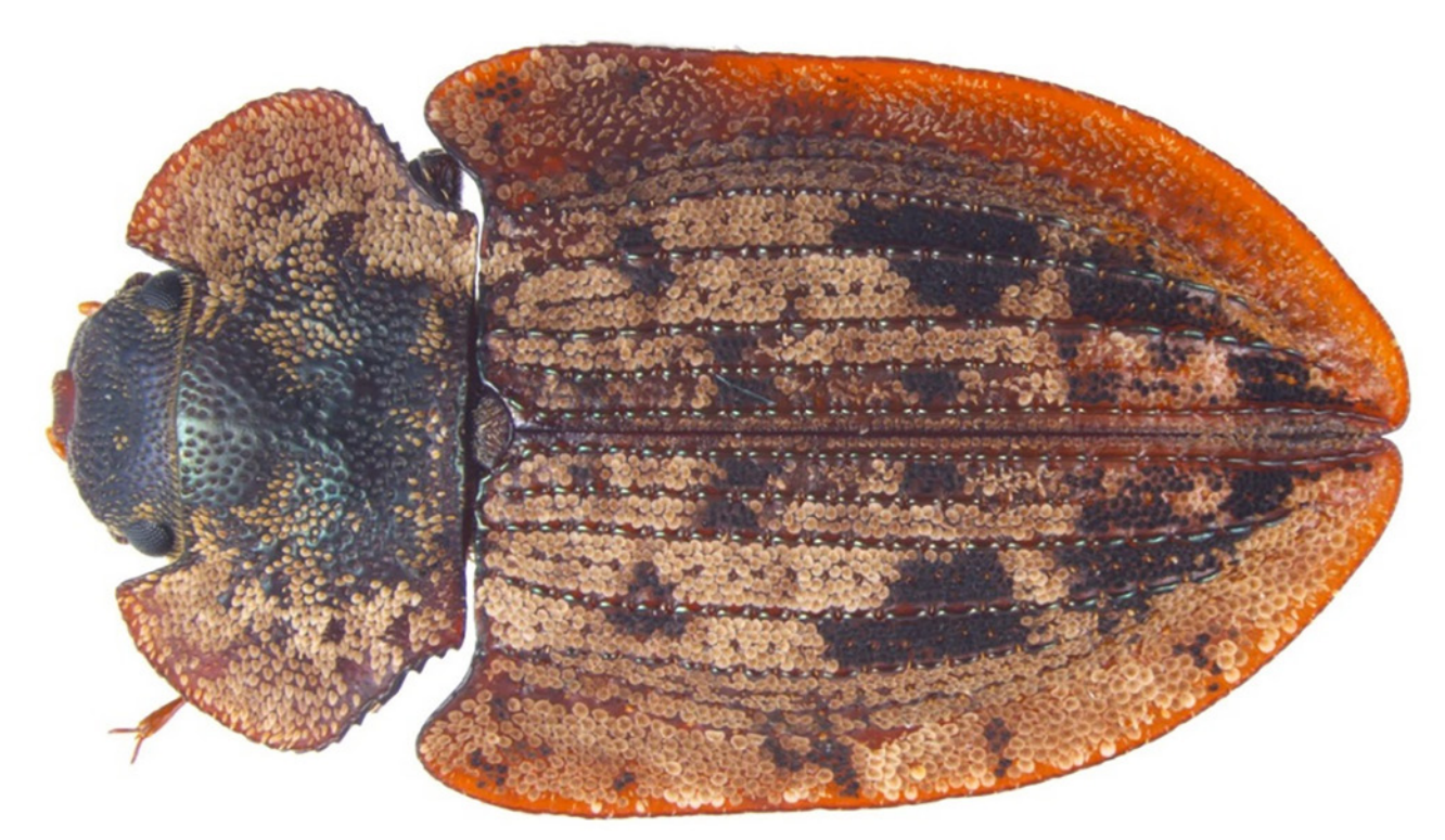
Figure 14. Phanodesta pudica, collected in Stevens Reserve, July 2018.

Hydissus vulgaris is a flightless species, endemic to Lord Howe. It is widespread in low and mid elevations, often found in rotting wood or under stones (Reid et al. , 2018a). Length 8–13 mm.