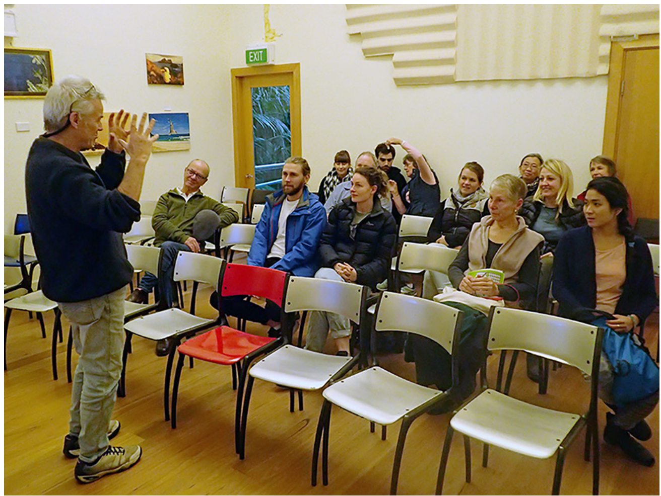
Figure 1. Introductory lecture on "large" beetles of Lord Howe.

than would otherwise be available just by the use of specialist scientists occasionally visiting to carry out observations.