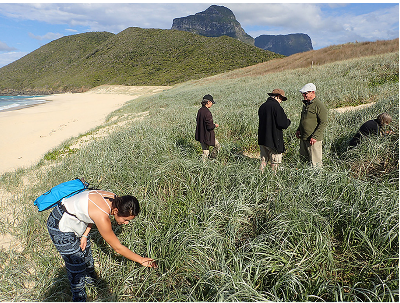
Figure 2. Looking for large beetles in the grassed dunes of Blinky Beach.