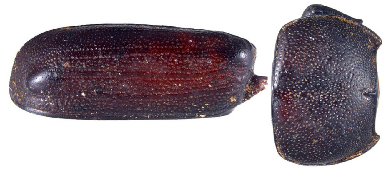
Figure 10. Fragments of an individual of Cryptodus tasmannianus, collected on Blackburn Island, July 2018 (photo: Max Beatson).

"Stevens Res, 31.5241S 159.0655E, 15 m vic fallen tree, night searching, 25.vii.2018, Reid, Hutton & volunteers". Additional material (larvae seen, not collected): "Clear Place walk (start), 31.5278S 159.0741E, 29 m, under bark/beating, 27.vii.2018, C Reid & I Hutton"; "Cobbys Corner, Sallywood Swamp, 31.5440S 159.0778E, 8 m, under bark/sifting/swept, 25.vii.2018, Reid, Hutton & volunteers"; "Soldiers Creek, vic 31.5527S 159.0823E, 22 m, in rotten wood, 25.vii.2018, Reid, Hutton & volunteers".