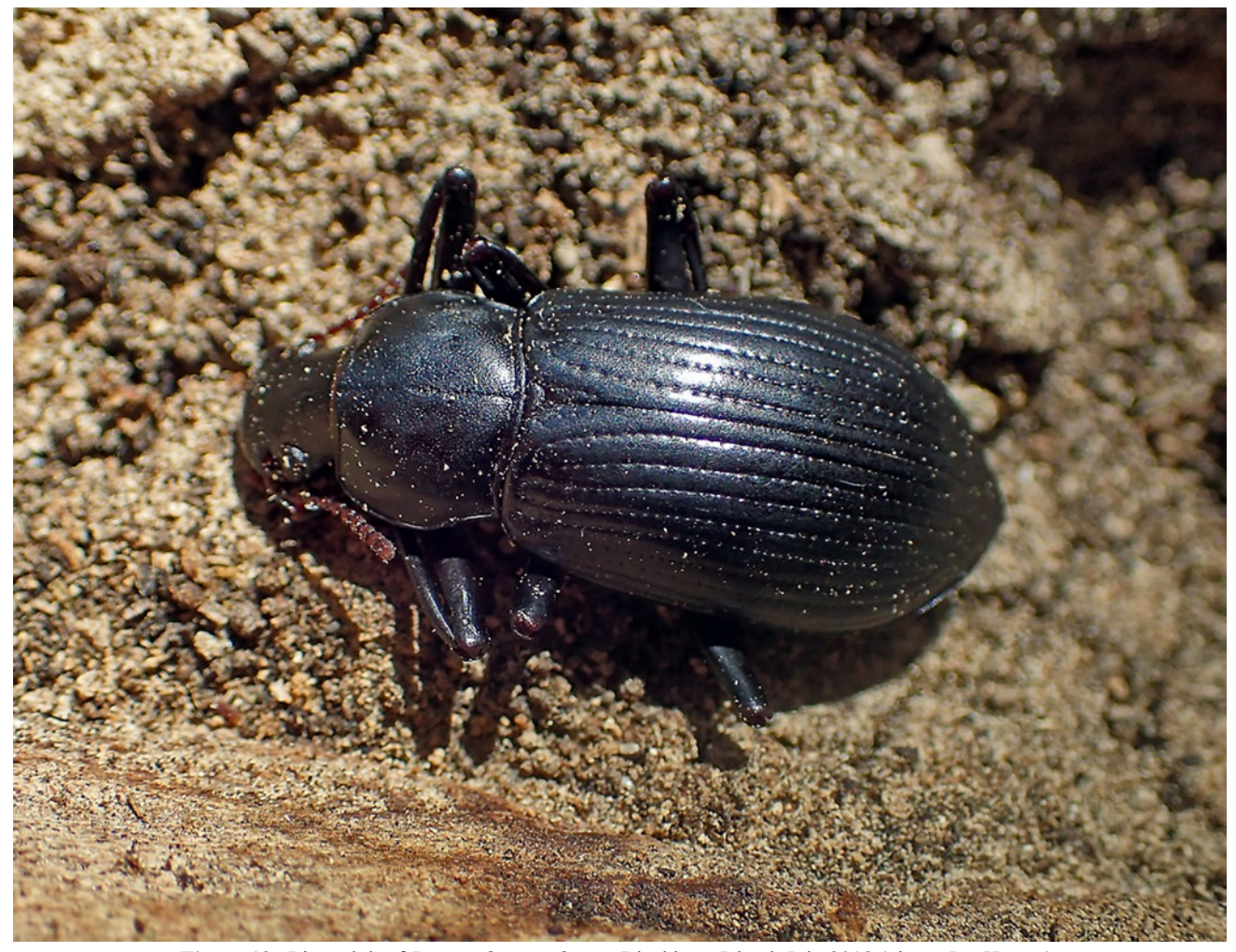
Figure 13. Live adult of Prionesthis sterrha, on Blackburn Island, July 2018

relatively recent introduction to Lord Howe. Thyreocephalus orthodoxus is a rarely collected species on Lord Howe (there is only one specimen in the Australian Museum, collected at light on the Jetty, in 1979 by Tim Kingston) but our evidence is that it is established there. Both adults and larvae are active predators of other insects and the adults are strong fliers, often flying during daylight (pers. obs. CR). Length 13–14 mm.