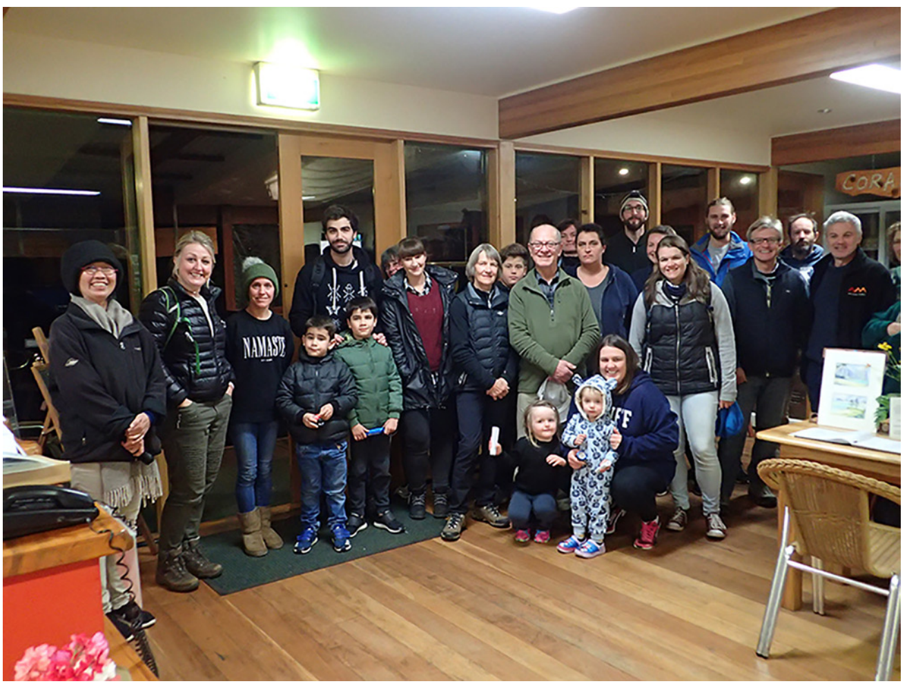
Figure 4. Citizen scientists ready for a night walk to look for large beetles.

main island of Lord Howe, where it is a lowland forest species (Reid et al. , 2018a). In 2017 only remains of a single dead specimen were found and concern was expressed that the population may have been affected by drought (Reid et al. , 2018a). We hereby confirm that the species still exists in Stevens Reserve, which seems to be its main population on the island. Length 8–10 mm.