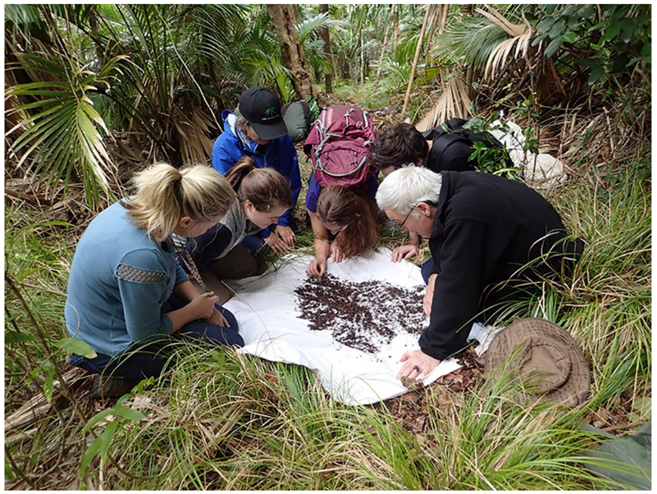
Figure 3. Citizen scientists examining the contents of a leaf litter sifter in forest.

authors as soon as they had captured something, so that they could be briefed on the significance of their find.