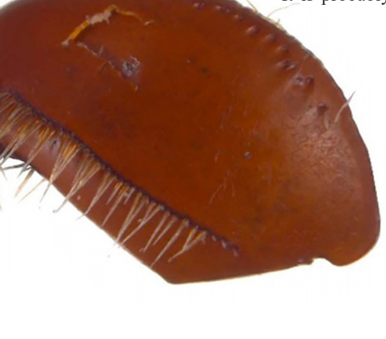
Figure 12 . Hind leg of Pimelopus noctis , collected July 2018 by a citizen scientist (photo: Max Beatson).

habitats, and has been accidentally introduced to New Zealand (Kuschel, 1990). It is probably therefore a