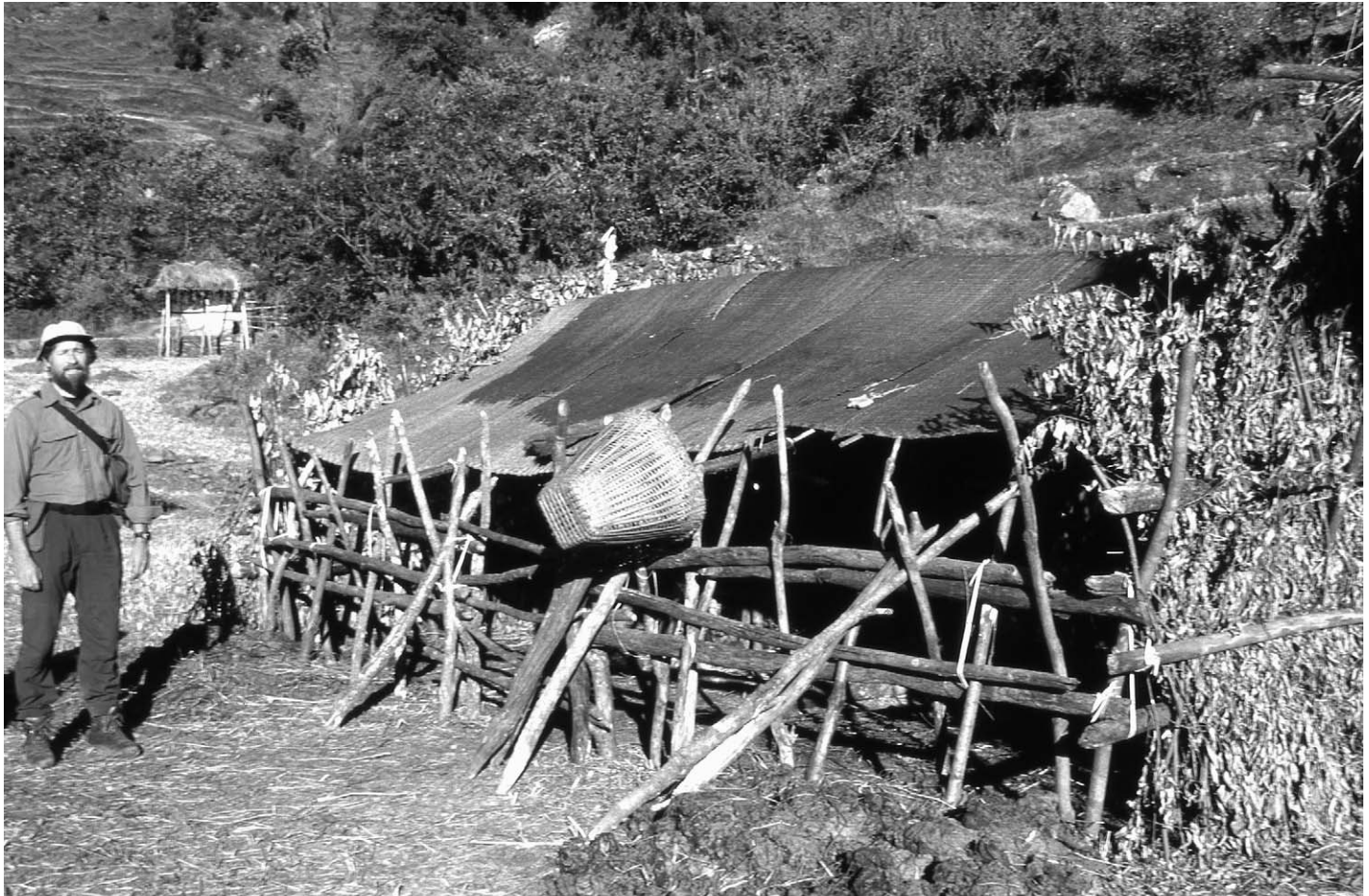
FIGURE 1 First author beside herder's shelter.