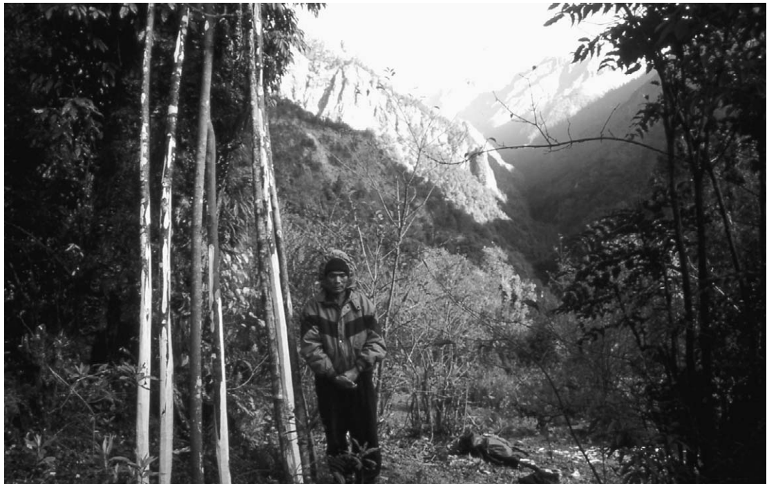
FIGURE 3 Field assistant Bo Bahadur Thapa beside harvested poles.

diameter, 2–3 m long) placed at 3 heights across the wall, and posts and beams ( kaamo and bolo ; ~8–10 cm diameter and 2–3 m long) that support the roof of woven bamboo mats. After tying crossed poles with strips of split bamboo, herders fill in the wall framework with leafy tree branchlets or the leafy tops of bamboo stems. Because the small wall and fence vertical members were harvested from the sapling size class and from coppice stump regrowth in the shrublands surrounding agricultural fields, we based our estimate of pole-size tree harvest for goTh construction on the average requirement for medium and large poles.