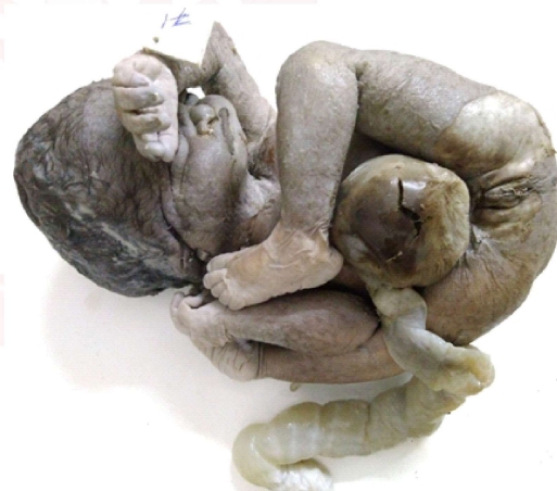
Fig. 1: Congenital Talipes Equano Varus Deformity.