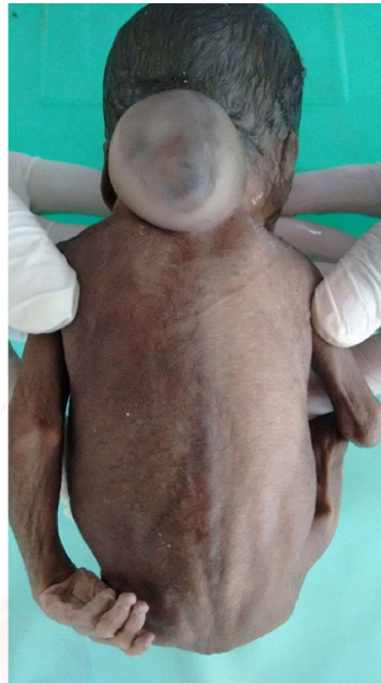
Fig. 4: Meningocele.