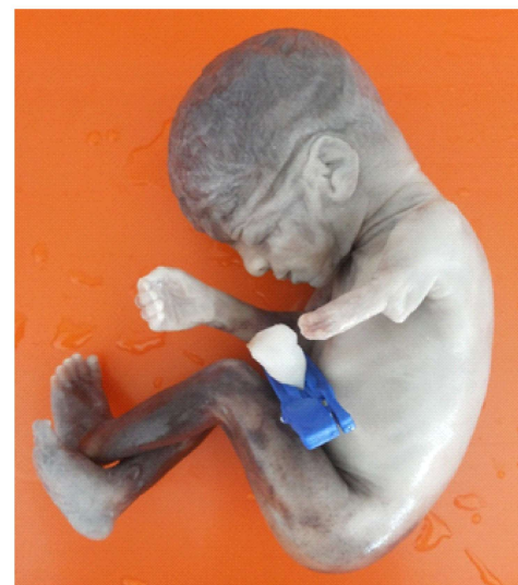
Fig. 2: Phocomelia.