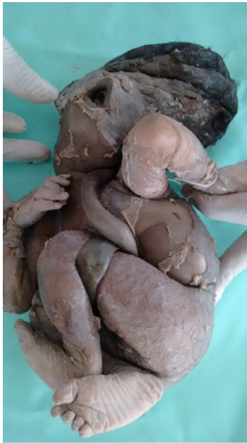
Fig. 3: Congenital Hydrocephalus.