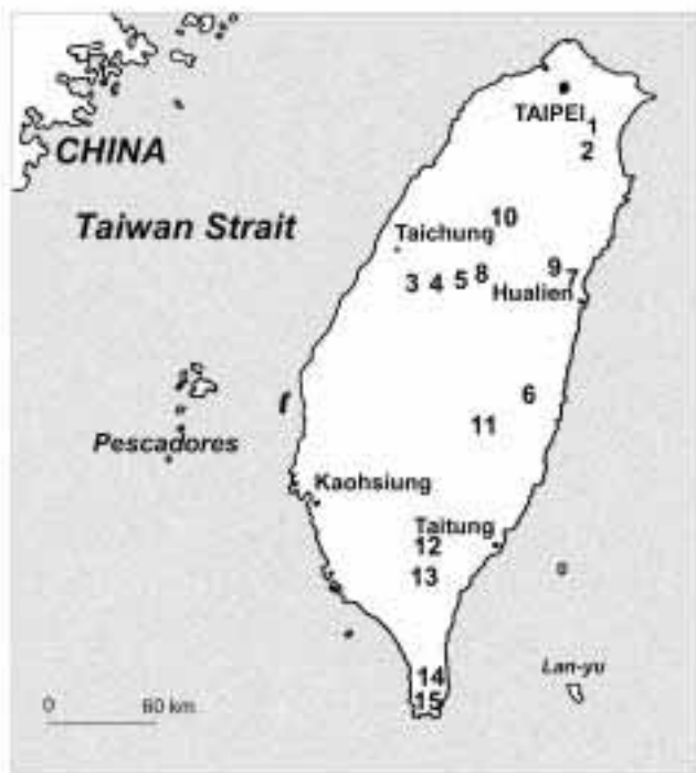
Fig. 1. Map of Taiwan with new millipede collecting localities. 1. Ilan County, Taipenshan, 2. Ilan County, Ming Chyr, Forest Recreation Area, 3. Nantou County, Meifeng, 4. Nantou County, Tzuchung, 5. Nantou County, Rinnei Nature Conservation Area, between Meifeng and Tsuifeng, 6. Hualien County, Rei Suei, 7. Hualien County, Taroko NP, Visitor Centre, 8. Hualien County, Taroko NP, Hsipan, 9. Hualien County, Tienshiang, Bailyang Trail, 10. Taichung County, Anmashan, Tahsueh-shan Forest Recreation Area, 11. Taitung County, above Liyuan, 12. Taitung County, Hsiangyang, 13. Taitung County, Chihpen, 14. Pingtung County, Mutan, 15. Pingtung County, Kenting.

Localities. Because of the political history of Taiwan (e.g. most villages and mountains had different names during the Japanese occupation) and the difficulty of transcribing Chinese characters into English or another language with Latin letters, names of Taiwanese (and Chinese) localities appear in several different manners. Pronunciation, unfortunately, cannot be a guideline either because Chinese vowels and consonants are difficult to reproduce in European-based languages. At the moment, an accepted standard for transcription of Chinese names does not exist; and despite several uniforming trials one can still find printed varieties of a single geographical name.