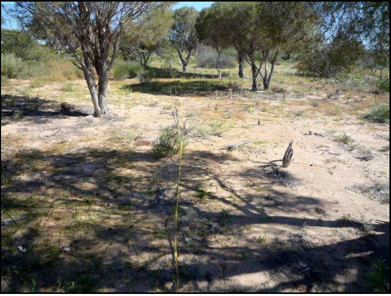
Figure 4 – Muggon Lake vegetation transect RCM020-R1.