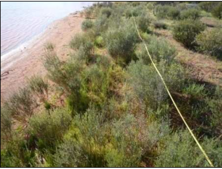
Figure 7 – Muggon Claypan vegetation transect RCM020b-R1.

The shrubs comprising the dominant stratum were all young plants compared with surrounding vegetation. This vegetation zone was clearly impacted by intermittent flooding. Three species of weeds were recorded along the transect. Despite some grazing pressure from feral goats and rabbits, the overall community condition was considered 'natural' (Table 11 in Appendix 1).