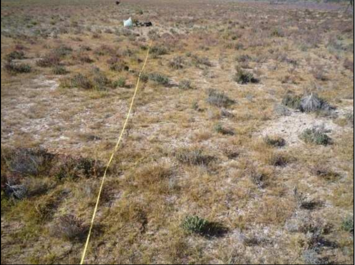
Figure 5 – Muggon Lake vegetation transect RCM020-R2.

No weeds were recorded along this transect. The community condition was considered 'natural' (Table 11 in Appendix 1) despite the area's history of grazing.