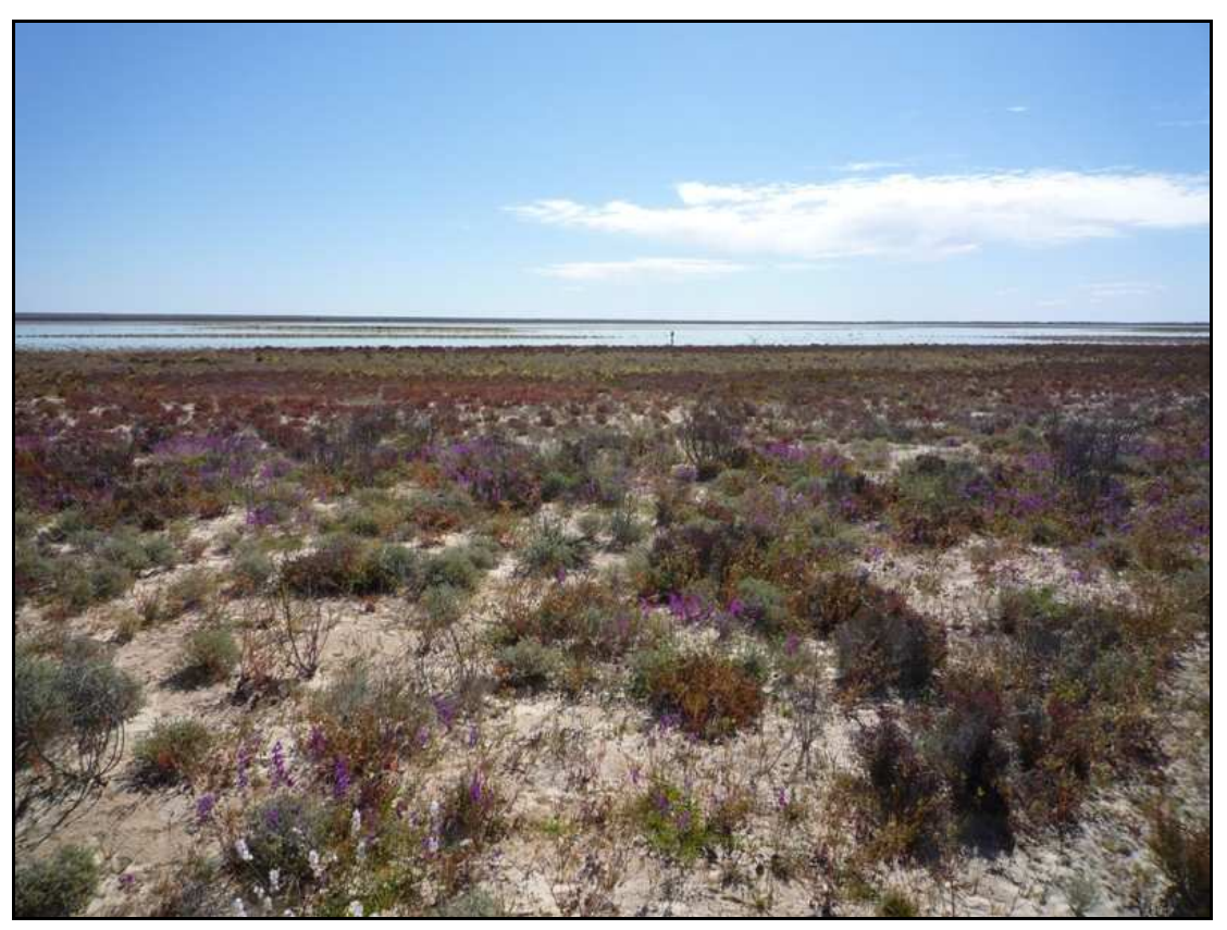
Figure 1 – Muggon Lake.