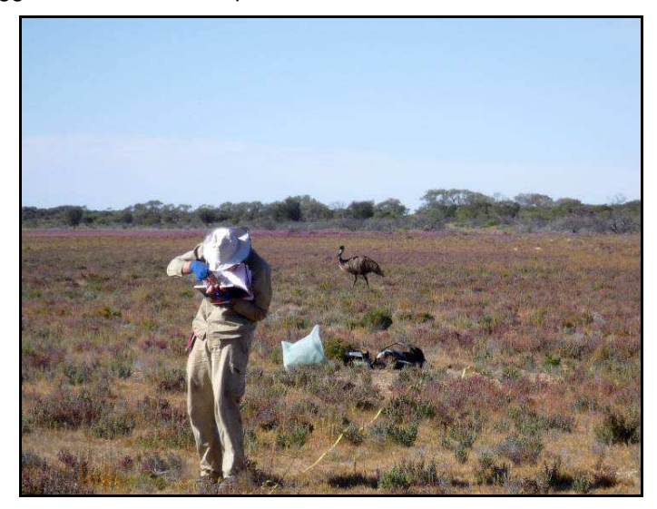
Figure 8 – An emu keeps a close eye on the flora survey at Muggon Lake.

Six species of mammal and thirty-one species of reptile have been recorded in the general vicinity of the Muggon wetlands. The importance of the wetlands to these taxa is not known.