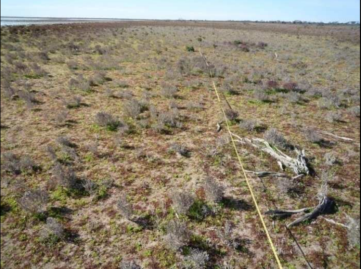
Figure 6 – Muggon Lake vegetation transect RCM020-R3.

Mimulus repens is a species of conservation significance, currently listed as 'Priority Three' (Atkins 2008). This species was abundant along transect RCM020-R3. Table 5 provides a complete list of taxa recorded along the transect RCM020-R3.