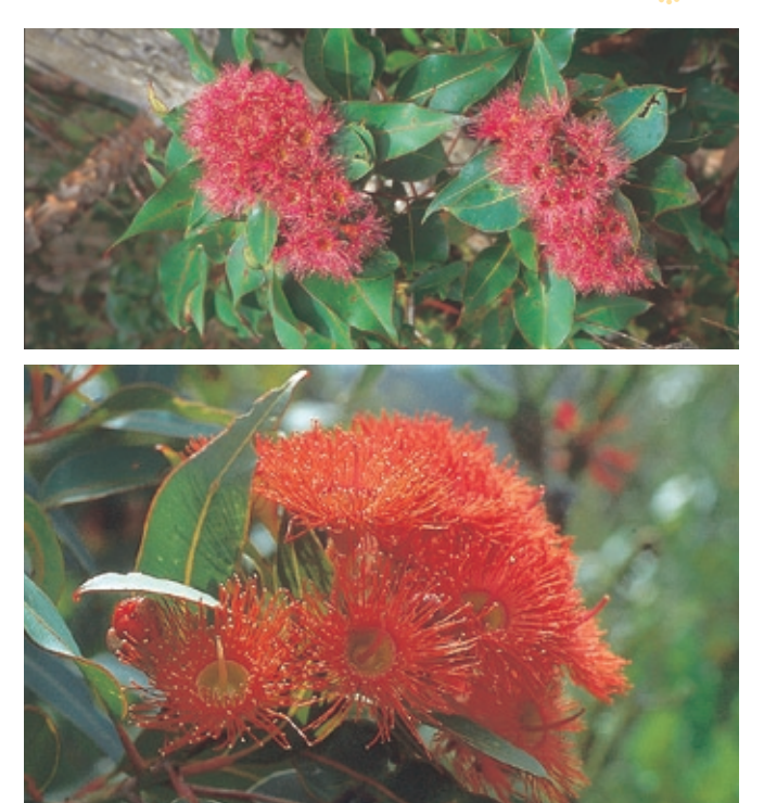
Variations in flower colours in Eucalyptus ficifolia.