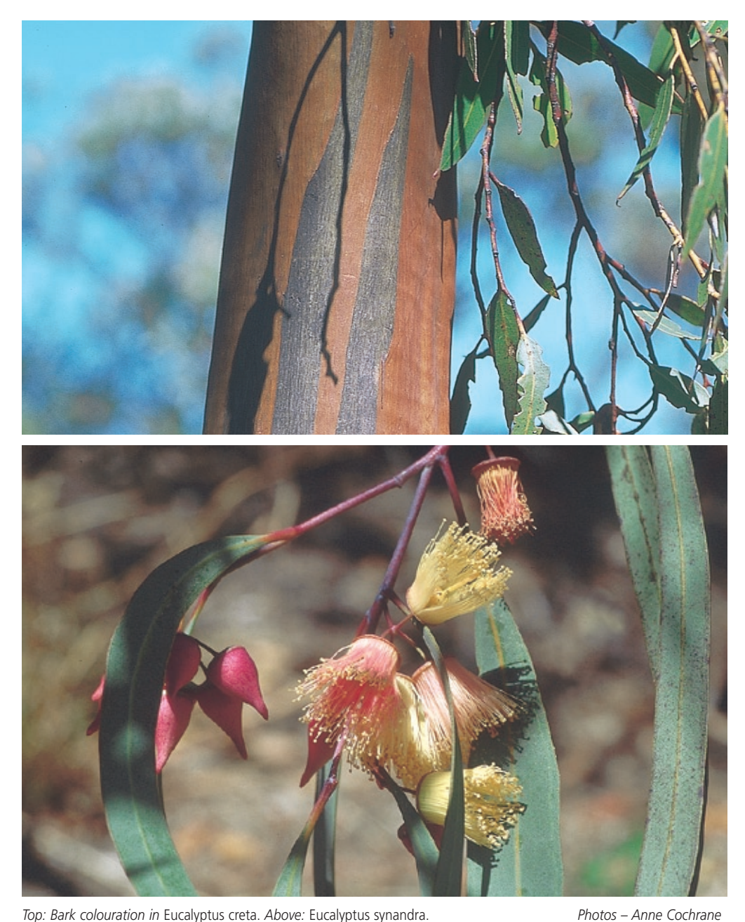
Top: Bark colouration in Eucalyptus creta. Above: Eucalyptus synandra.