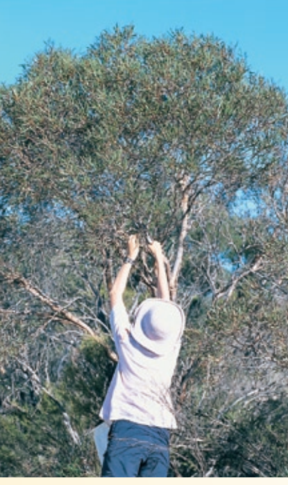
Collecting Eucalyptus dolichorryncha.

Eucalyptus species generally produce copious quantities of seed annually and the fruits may take a year to mature from flowering. The capsules are mainly woody, hard and may be brown when mature, and located on older wood. Check to see that seed is ripe by cutting the capsule carefully with a pair of secateurs. The endosperm should be white and firm, with a brown to black seed coat. The fruits should not be green, and if the valves on the capsule look as if they are beginning to open then the fruit should be ripe enough to collect. The seed of most species of Eucalyptus are easy to collect, although seed from tall trees can only be reached