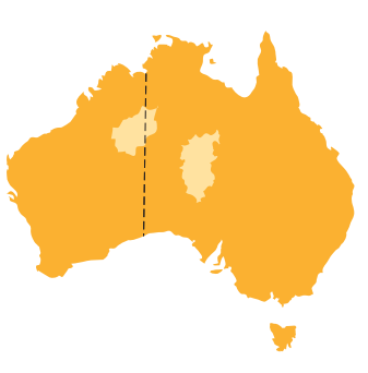
Approximate distribution of Eucalyptus in Australia.

Eucalyptus is the second largest genus in Australia and all but about eight species are endemic. Members of the genus occur throughout Australia, from sea level to over 2000 metres in height. They occur in a variety of habitats from exposed coastal sites to closed forests to dry inland regions. Most occur in dry or wet sclerophyll forests and woodlands with a few found in the rainforests of the tropics.