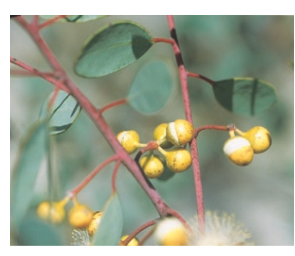
Above: Eucalyptus buds. Right from top: Eucalyptus synandra, Eucalyptus petila, Eucalyptus argutifolia.

Many species produce copious guantities of nectar that attracts insects, birds and small mammals such as honey possums. Plants may be insect, bird and sometimes animal pollinated. Sawflies and native bees are implicated in pollination. The genus is renowned for its ability to hybridise between species, giving rise to a range of variable combinations. Some species do not flower every year and may have years when flowering is phenomenal. Eucalypts are divided between those that are killed by fire, regenerating from seed and those that have a lignotuber, a below or partiallybelow ground root swelling that allows them to resprout after disturbance, such as fire. Seed is dispersed by gravity and by wind.