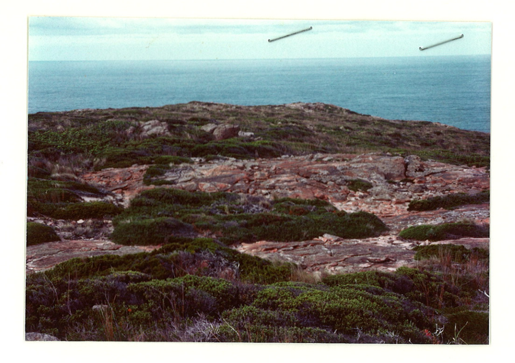
Plate 1. Migmatite area, looking south from southern peak.