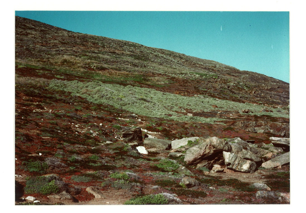
Plate 4. "Meadow" area on north-west side of island at junction of limestone and migmatite. <u>Atriplex</u> in middle distance.

Plate 3. Looking north-east from campsite : migmatite in foreground, limestone dome in background, narrow neck to right.