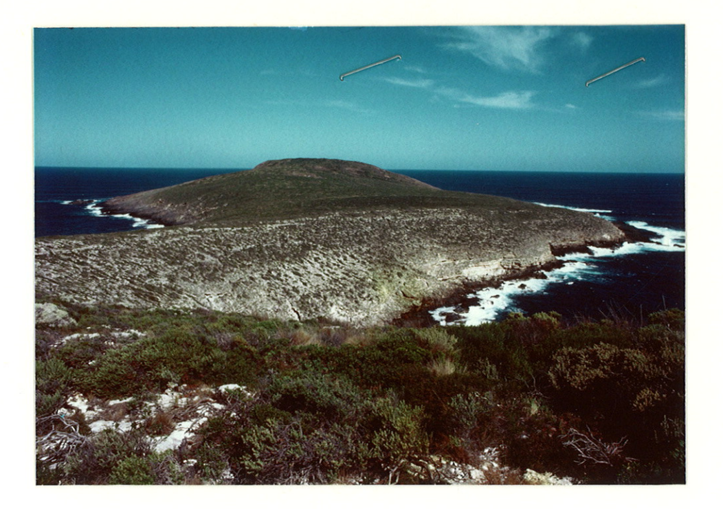
Plate 5. Looking south-west from limestone dome towards southern peak.