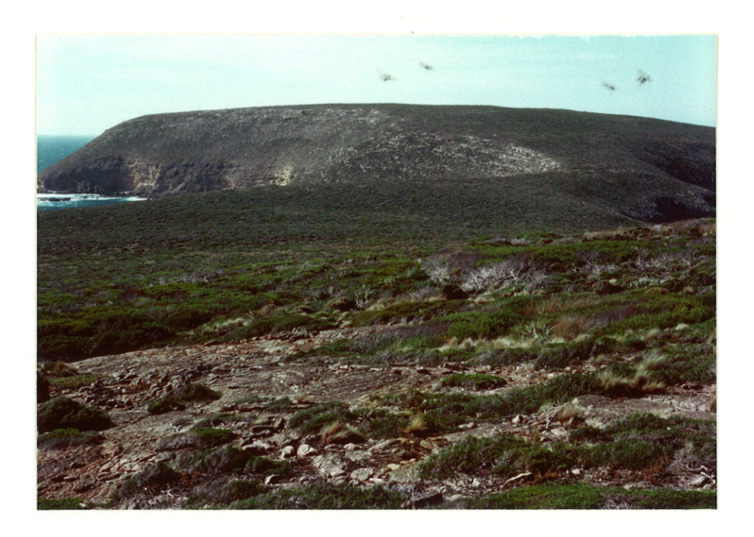
Plate 3. Looking north-east from campsite : migmatite in foreground, limestone dome in background, narrow neck to right.