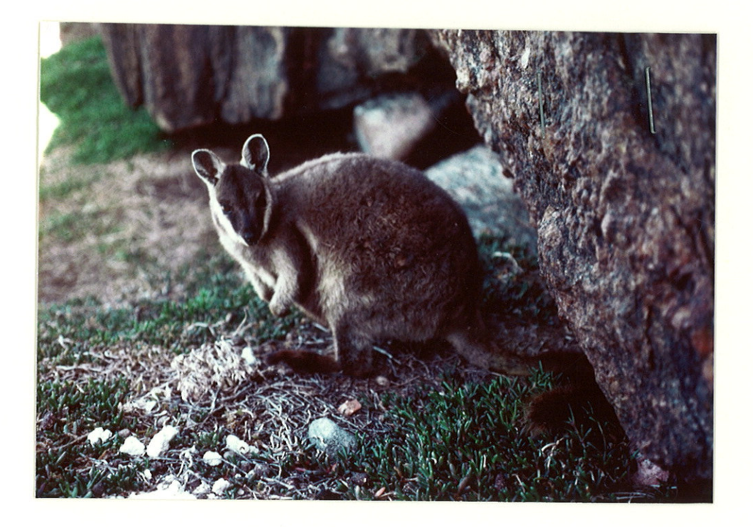
Plate 7. Black-flanked Rock-wallaby (Petrogale lateralis) on Salisbury Island.