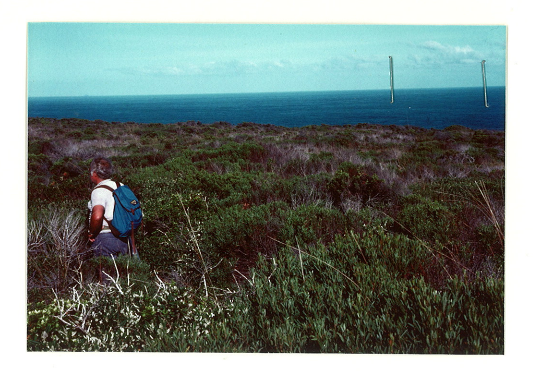
Plate 6. Vegetation on limestone dome. Dense Heath B of Acacia cyclops, Pimelea clavata, Leucopogon parviflorus, Spyridium globulosum and Boronia alata with sedge (Scirpus) leaves emergent.