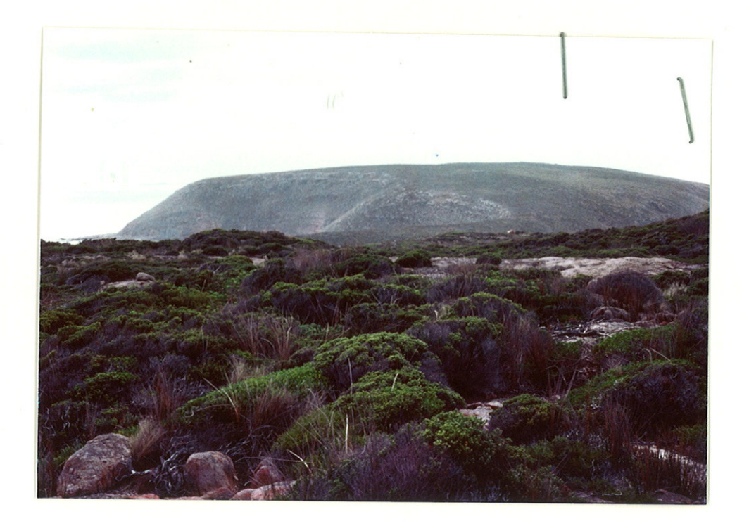
Plate 2. Looking north-east from southern peak : migmatite in foreground, limestone dome in background.