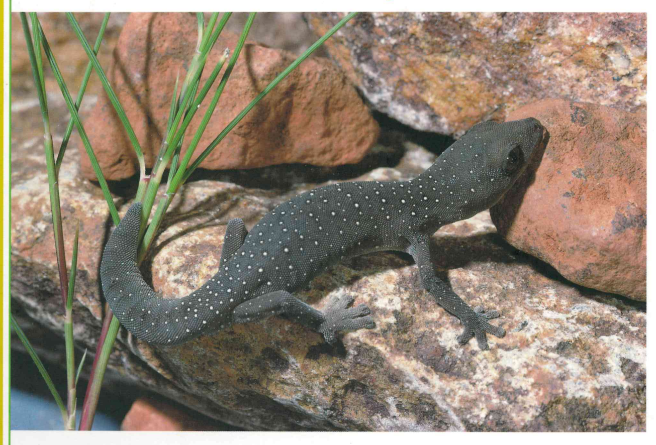
A contribution to the development of Western Australia's biodiversity conservation strategy