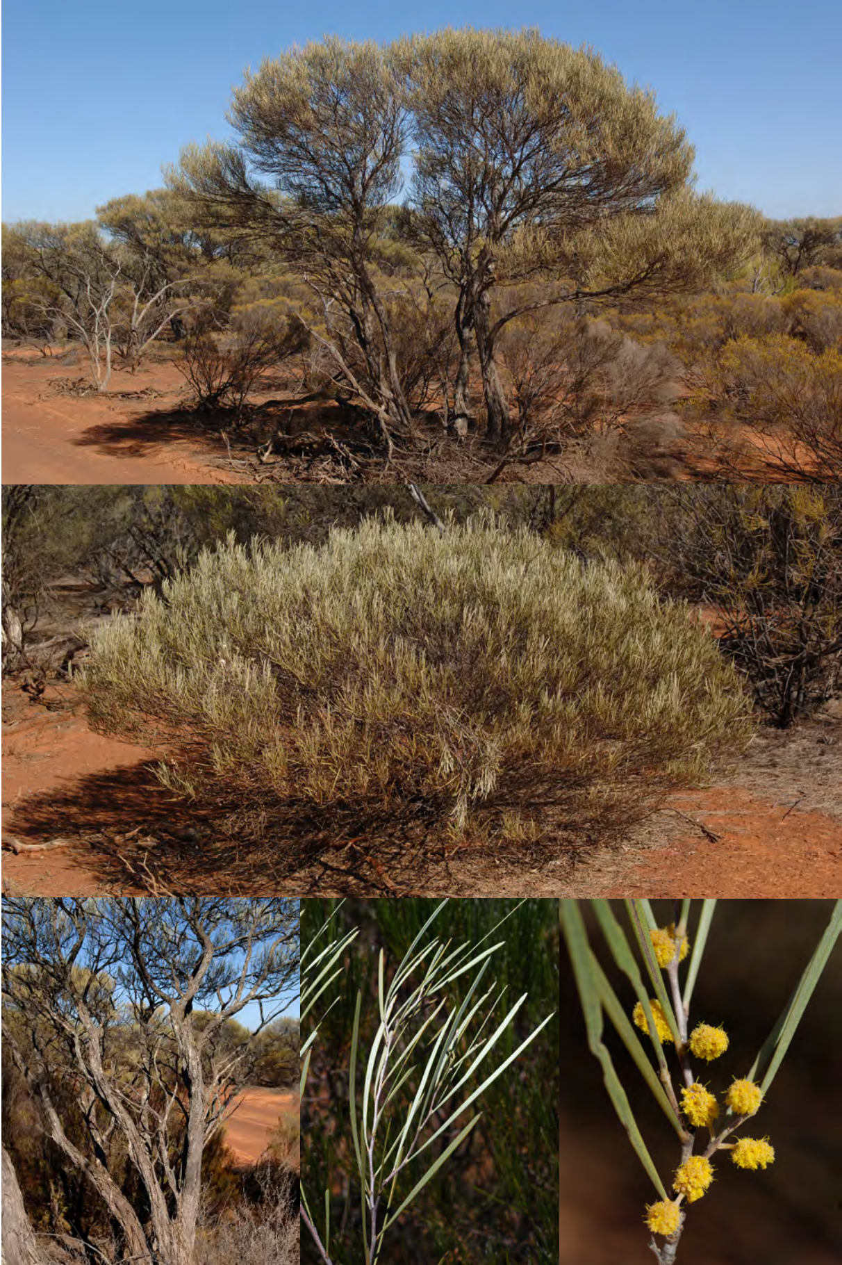
Acacia latior (Broad-leaf Sugar Brother)