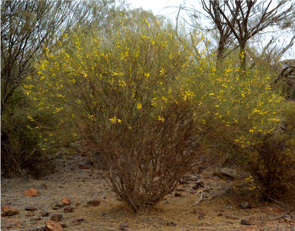
Acacia karina (Karina's Wattle)