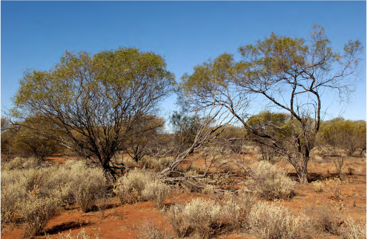
Acacia umbraculiformis (Western Umbrella Wattle)