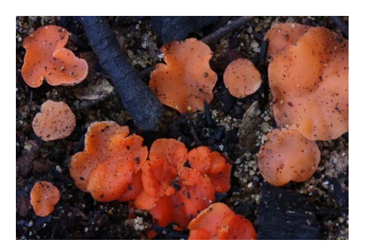
Figure 6: Pulvinula archeri (BOUGHER 573 )