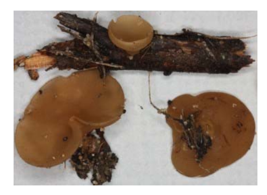
Figure 1: Peziza moravecii (E9322)