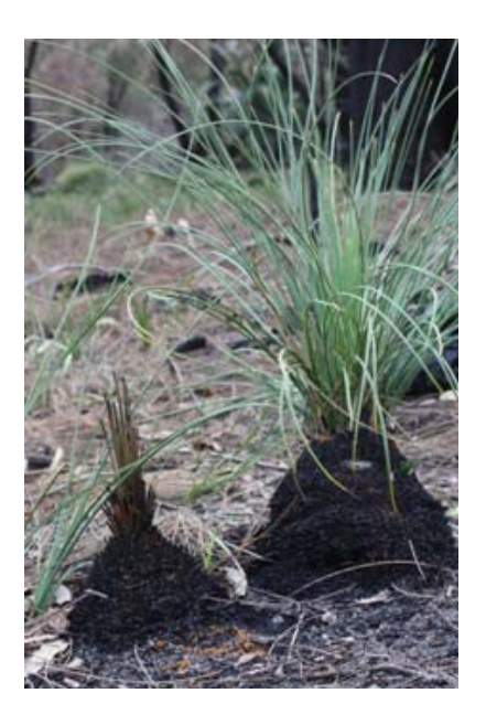
Figure 3: Anthracobia melaloma on burnt site