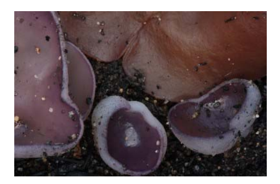
Figure 5: Peziza tenacella (BOUGHER 561)