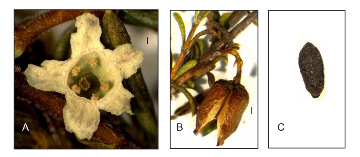
Figure 2. Logania sylvicola . A – male flower from above showing throat rim; B – dehisced capsule; C – seed. from M. Hislop 3916 (A) and R. Davis 4687 (B & C). Scale bars =1mm.