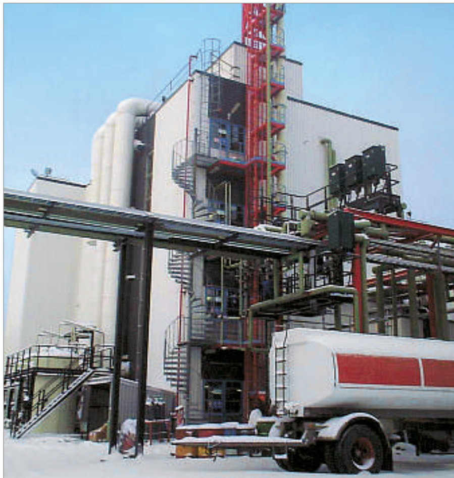
AlkyClean demonstration unit in Finland

This is now being demonstrated to potential customers at facilities in Porvoo, Finland, and has met with international recognition as runner-up in the Environment category of the Wall Street Journal Europe's 2002 innovation awards. The technology is expected to go to market by 2005.