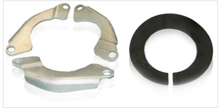
Figure 3 - Typical mounting clamp and cushion for bushings rated <2500A

Terminal connectors should be of ample size to keep the bushing terminal temperature below 70 °C at rated current. The use of even more generously sized connectors is recommended to minimize bushing overheating during possible overloads. Do not loosen the top terminals when installing the line terminal connectors.