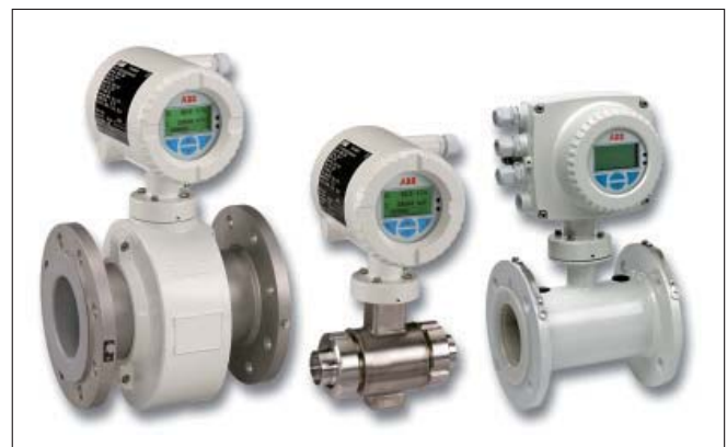
Electromagnetic flowmeters from ABB's FlowMaster product family: ProcessMaster, Hygienic Master, and WaterMaster.

The above-mentioned instruments from the FlowMaster product family are among the first devices on the market that comply with the NAMUR recommendation NE107 "Self-Monitoring and Diagnosis of Field Devices". In this recommendation, the manufacturers and users have defined the required diagnostic capabilities, described the most common instrument errors and also taken into account their conception related to diagnostics. "With our new instrument line we as a manufacturer meet the NAMUR requirements, firstly in terms of the nomenclature of the individual state signals and,