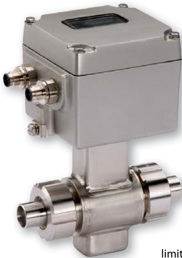
The EcoMaster Hygienic flowmeter from ABB is entirely manufactured from stainless steel. It is the world's smallest and lightest electromagnetic flowmeter in its class.

secondly, regarding clear instructions assigned to each error. "Regardless whether the error originates from the converter electronics, the sensor or the operating conditions" says Uwe Mecke proudly. The user can immediately localize an error – a special feature provided by ABB instruments which complements real additional value. Usually, the user has to cope with troubleshooting all alone. As unexpected plant downtimes represent the most critical and cost-intensive failures, both operators and maintenance personnel should be enabled to solve the problem as quickly as possible. With their integrated online help system ABB instruments feature clear user benefits. "Although other instruments on the market signal errors via electrical contacts, they do not provide any help or instructions for isolating the cause of the error" says Uwe Mecke . "In this respect we have made a quantum leap by offering smart instruments."