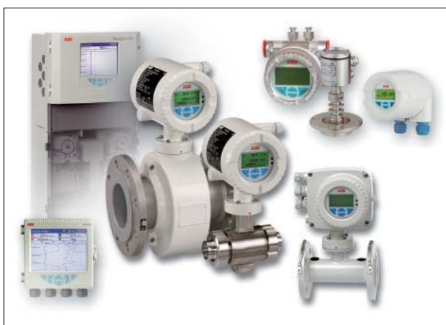
ABB's product-spanning, consistent operating concept providing, for example, uniformly designed displays for recorders, analytical instruments, electromagnetic flowmeters, pressure- and temperature transmitters.

In principle, measuring the concentration of binary mixtures is not really new. Since 10 years