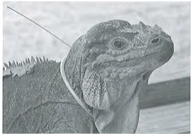
Radio transmitters used for the larger animals are enclosed in a pouch attached to a collar made out of plastic tubing.

Three different radio transmitters are used. One, for the larger animals, is enclosed in a pouch attached to a collar made out of plastic tubing, and hangs loosely around the neck. These present some risk of strangulation, and radios attached directly to iguanas without straps are generally preferred. The second type of radio is much smaller and is used for juveniles and even occasional hatchlings. Because young animals grow quickly, these transmitters are tied around the lower part of the body above the pelvis, swing loosely, and usually fall off after some time. Not only does this prevent the ties becoming too tight over time, but also the transmitters can be recovered and re-used. The third type of