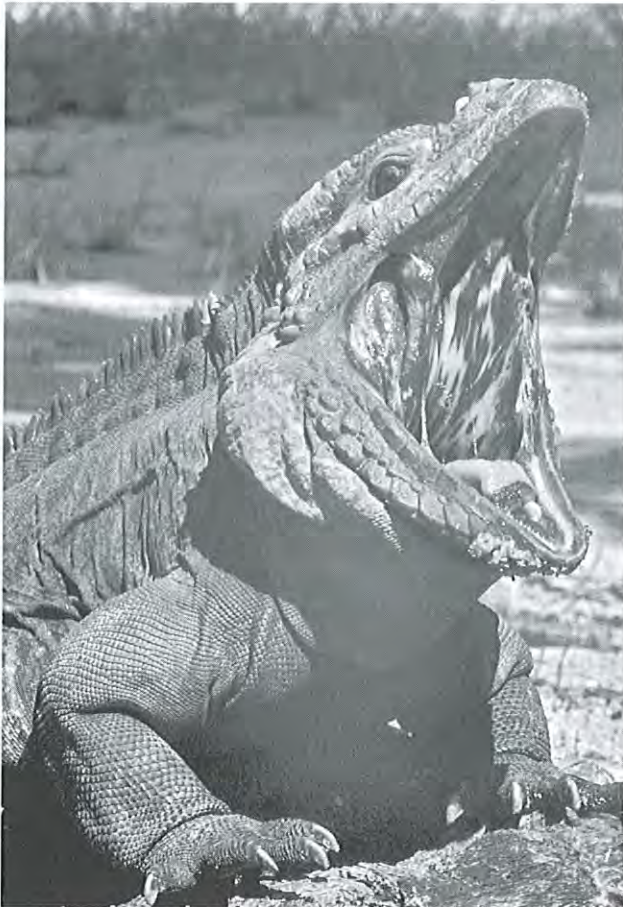
This individual is one of the largest iguanas on the island.

The very next morning, I was in the bathroom brushing my teeth when, as an afterthought, I removed the light to see what was going on in our incubator. There, poking up like dark, wet pebbles on a beach, were four heads. The first hatchlings had started to come out of their eggs. This continued for four days. Every so often, I would go into the bathroom and another head would have popped up like a crocus in spring. I kept them warm and watered them, just as one would with delicate flowers — and