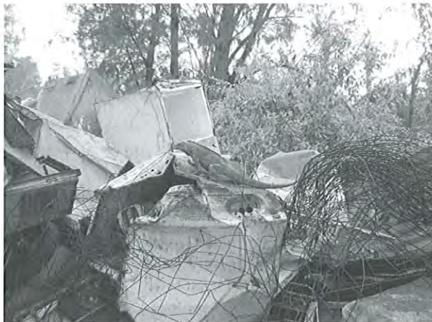
Many of the headstarted iguanas don't stray very far after they are released. Several have taken up residence, along with wild animals, in the dump, which supports a total population of about 20 lizards.

We didn't think much more about that encounter until a few days later. Female #27 seemed to be minding her own business under the watchful gaze of Tough Guy 21, when, out of nowhere, came the new Tough Guy. He sidled up to her and, from where we stood, appeared to be chatting to her amiably. Tough Guy 21 approached, the female backed off, and, like jousting knights, the two males rose up on their haunches, tipped