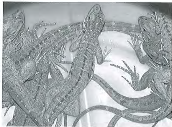
Hatchling iguanas at the headstart facility in 2003.

By the end of November 2002, all the signals from transmitters implanted in August 2002 were lost. Two signals from transmitters implanted in April 2002 were still detectable, but one was lost in December and the other