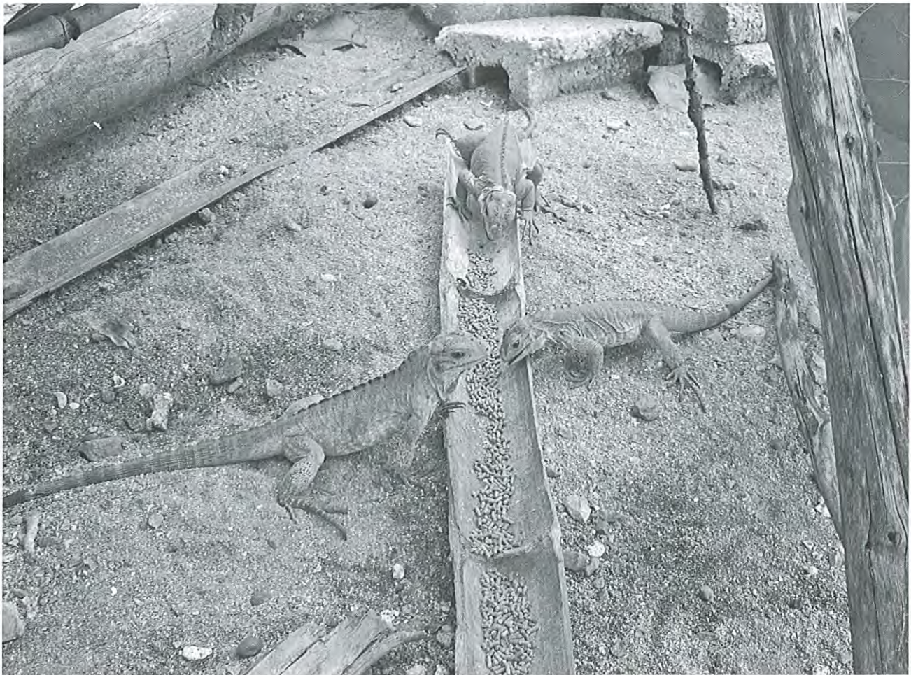
Mash is placed daily in split-bamboo feeding “stations” for young Mona Island Iguanas ( Cyclura cornuta stejnegeri ) at the headstarting facility.