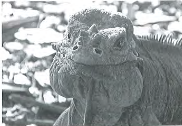
This large male was about to shed its skin.