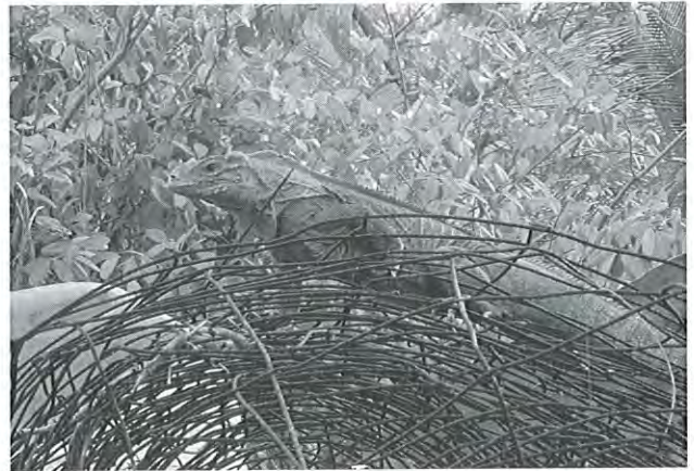
This occupant of Ciudad Lagarto monopolizes a prized basking site.

transmitter, about the size of an AA battery, is implanted in the body cavity of larger animals. Although a longer recovery period might be preferable, animals are usually released after three days due to space and time constraints. Once transmitters are fitted, animals are individually tracked using a VHF receiver. Radio transmitters usually last three months to three years, depending on type.