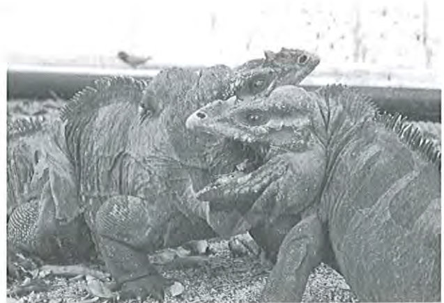
Fights between adult males can be vicious.

A couple of hardened old hands lived near the research station. One was iguana #21, who I called “Tough Guy 21,” and the other was just “Tough Guy.” Both were aggressive. Tough Guy 21 had been around for a long time and was the uncrowned king of the area. He would swagger around and chase lesser males