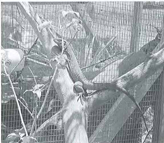
Juvenile Rhinoceros Iguana at the headstarting facility on Moná.