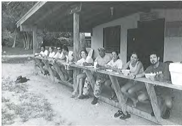
The entire human population of Mona Island taking a lunch break.

Alighting from the aircraft, I was immediately struck by the grand tropical aspect of the place, the cacti growing at the airstrip, unusual birds, and strange noises. That night, I was amazed by the innumerable stars bright against the black sky, and by an immense silence that covered us like a cloak and was interrupted only occasionally by the bark of a Night Heron. Lying in bed, knowing I was on an island in the middle of nowhere, no one walking down the street, and hearing no cars or other sounds of a modern metropolis was a strange and wonderful sensation.