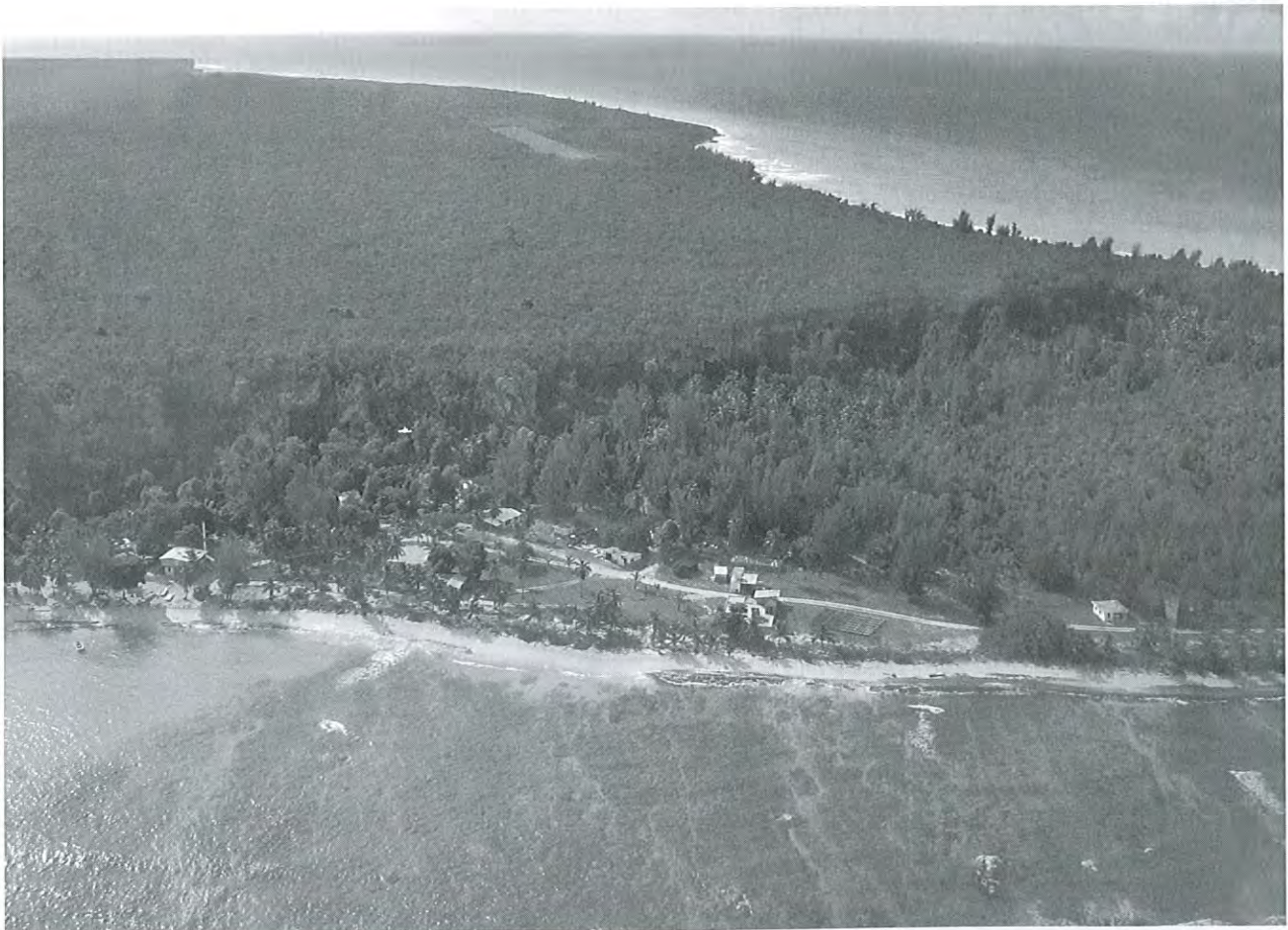
Aerial view of Isla Mona.

I stepped off the plane exhausted and excited, about 7000 miles and 31 hours away from where my journey began. The time in Puerto Rico was 9:30 pm, but my body told me that it was really 2:30 am the next morning. This trip was very special; I had volunteered to be a field assistant on a research project currently underway on Mona Island, the home of Cyclura cornuta stejnegeri , the Mona Island Rhinoceros Iguana. This magnificent creature has lived untouched on this island, separated from other large iguanines, for thousands of years, although an alternative school of thought suggests that the lack of substantial genetic differentiation from Cyclura cornuta of Hispaniola speaks to a recent, possibly even human-mediated, arrival on the island.