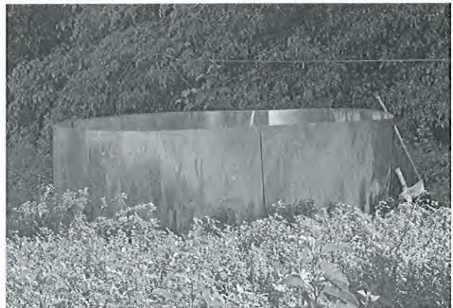
Twelve carefully monitored nests were surrounded by zinc fences.

Nestor's study uses nest monitoring, radiotracking, and individual identity numbers in an effort to determine sex ratios, paternity information, size of home ranges and territories, movements, survival rates, and total population size. Mona Island covers about 65 km 2 and much of it is very difficult terrain. Nesting sites are scattered widely and some are almost inaccessible. Twelve nests have been carefully monitored and surrounded by zinc fences. These are visited daily during the expected time of hatching. Hatchlings are trapped inside the fences, collected, and taken to the research station for processing. Each is measured and weighed, blood samples are taken, and transponders inserted. This year, 121 hatchlings were processed. At about 30 minutes per lizard, this entailed 60 hours of work for each of two people.