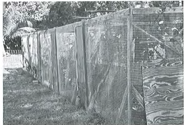
Headstarted iguanas spend the first months of their lives in one of ten contiguous units.

A fairly large iguana lived near the front by a pile of old doors. She was beaded and tagged and had made a “nest” of dead grass under one of the doors. She was the largest and obviously