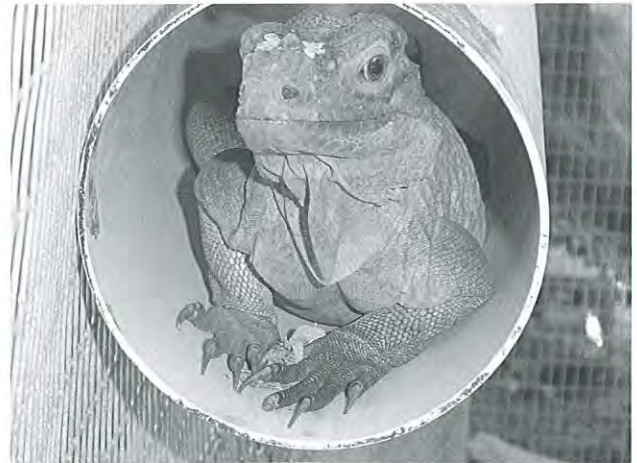
A young Rhinoceros Iguana peers out from the safety of a PVC pipe within the headstarting cages.