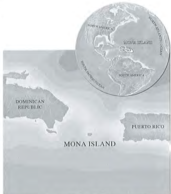
Moná Island lies between Puerto Rico and the Dominican Republic.