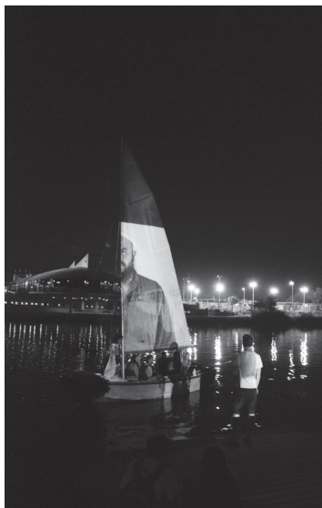
Fig. 1. Maayan Amir & Ruti Sela, Exterritory Project , preview 2010.