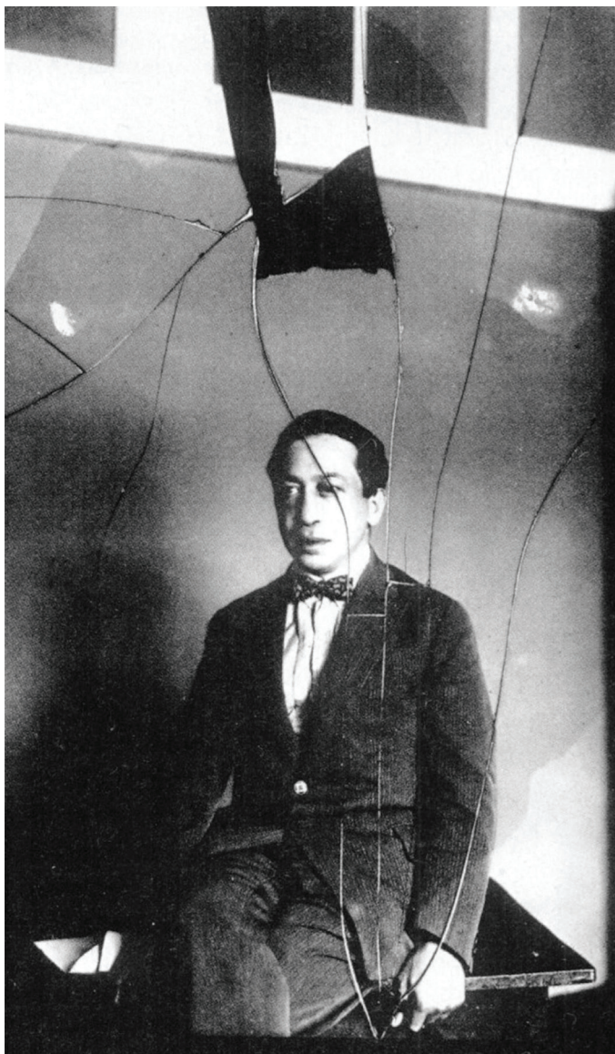
Fig. 1. Siegfried Kracauer. Photographic print of the surviving shards from the original glass plate (1930).