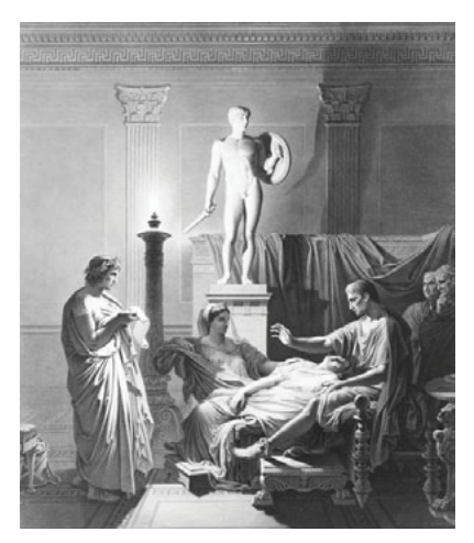
Figure 2. Virgil Reading the Aeneid to Augustus by Charles-Simon Pradier

Reading" would thus be a copy of a painting that preceded it. But there's a Nabokovian twist – readily apparent if one is on the lookout for it given the painting's implicit references to both a double and a ghost,<sup>79</sup> not to mention the drama of the scene itself, which depicts an interrupted scene of reading. Pradier's imitation , it seems, served as the 'original' for Ingres' subsequent recreation of his painting in 1864. Ingres evidently reworked his painting by tracing over Pradier's engraving, whose lines are partially left visible in the finished canvas.