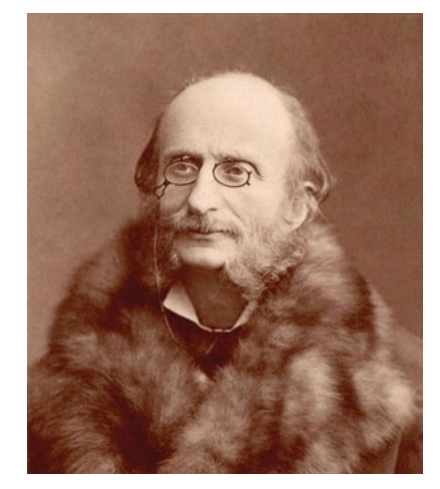
Figure 3. Jacques Offenbach by Nadar circa 1860s (a.k.a. Gaspard-Félix Tournachon, 1820–1910). Public domain, via Wikimedia Commons.

in "The Cast of Amontillado," imposing the idea of some kind of literary "Fortunato" being unsuccessfully contained.<sup>82</sup> Thus the tools – rusty with disuse – could be for digging into textual riddles. Each of these visual and aural cryptonymic figures point back to the counter-anachronization of the Pradier image that appeared to spawn them: purporting merely to imitate, a copyist etches inscriptions which the official historical record paints over but whose off-cuts and shavings remain discernible as the detritus of another representational agency that chews through the Book of History, leaving its waste in "black lumps of various sizes" – letters .