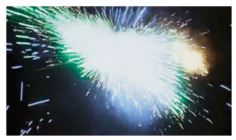
Figure 3: "Fighting fire with fire" – echoing Mother's cigarette to the eye, the pyrotechnics ("fireworks") of To Catch a Thief 's sex-deflating "seduction" scene (with the cinematic Grant interested only in the diamond's reflected light), mocks Joyce's equating fireworks with ejaculation or simjouissance ( To Catch a Thief , Hitchcock 1955).

putting out her embers by blinding the eye, putting out the "sun," cancelling the organic promise of her eggs. Hitchcock hated eggs . What does the text mean, however, by the phrase it elsewhere deploys, of "fighting fire with fire "? (see Figure 3).