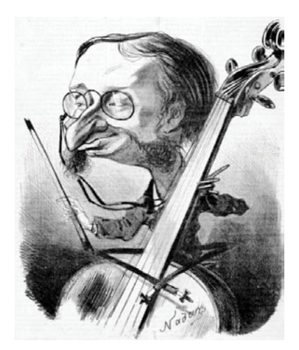
Figure 4. Jacques Offenbach by Edouard Riou and Nadar. 1858 Public domain, via Wikimedia Commons.

to his right, his enormous fur collar seeming to blend with his dappled "whiskers" like an extension of his body. The fur's viscous textures initially seem to recall the brushstrokes of oil paints, but another complication of representation's technological history enters into play once one recalls that painting's "wretched oils" have also long harbored the chemicals also used in film processing: silver halide's iodine.