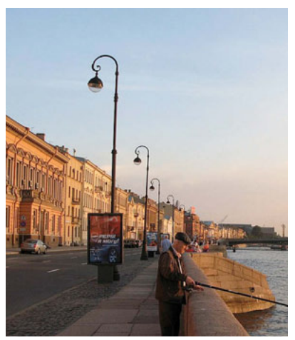
Figure 7. English Embankment, St Petersburg, (cropped) CC-BY-SA 3.0 2009 YKatrina.

Russian alphabet. Yet as one can see in Figure 7, the hard sign merely went underground or, rather, overground. With a breath-taking insouciance