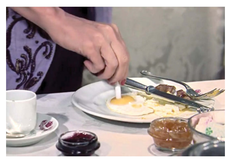
Figure 2: "A light touch" – Mrs. Stevens (Mother) extinguishes cigarette ember into a sunny-side up egg, at once egg ("Mother" extinguishing in advance organic generation), eye (a blinding), and sun itself (the premise of natural "light," the Platonic sun as father) ( To Catch A Thief , Hitchcock 1955).

also background to what I will call the "post"-pandemic anomie and, if one likes, an open parenthesis of sorts. That general hiatus glistens as the temporal and energetic imperatives collide like continental masses.