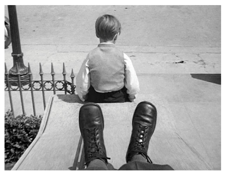
Figure 1: The syncopated "bar-series" in Spellbound as the impaling fence of John Ballantine's (Gregory Peck's) discrete fratricide from behind. The "bar-series" through Hitchcock situates the alternating lines of temporal spacing, interval, celluloid partitions, the techno-premise of the visual and perceptibility and exosomatization ( Spellbound , Hitchcock 1945).

the multiple logics of a biospheric "endgame" underway, which is not dissociable from legacy reading models or complicit hermeneutic regimes. (One may suggest this is where Nabokov's "Referential Maniac" might suicide to escape from and assume.) But if one acknowledges Jöttkandt's implication, that all this biomaterial re-arranging is not unconnected to the reading models we've been stuck within – call them, Anthropic? – then bringing into contact a certain "Hitchcock" and a similarly distinct "Nabokov" produces a curious frisson when the two briefly interact at Hitchcock's instigation.