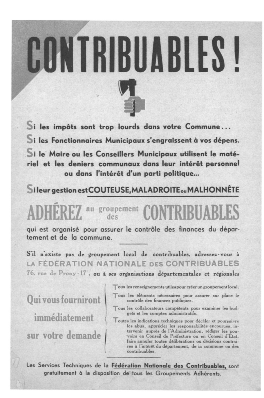
Plate 2 'Contribuables!', 1936.