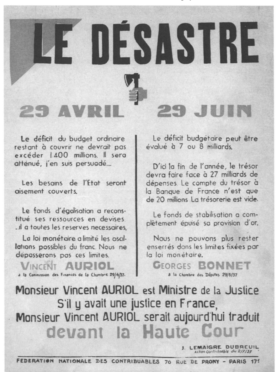
Plate 3 'Le désastre,' July-August 1937.

socialists.<sup>171</sup> In July Pierre Fournier replaced Labeyrie as governor of the Bank of France. Lemaigre Dubreuil welcomed him as 'a great and eminent civil servant,' 'a man of authority and of perfect courtesy who combines expert financial knowledge with a remarkable gift of clear exposition.'<sup>172</sup> And in time the conservative press hailed Fournier as 'an objective and lucid technician' whose credo was