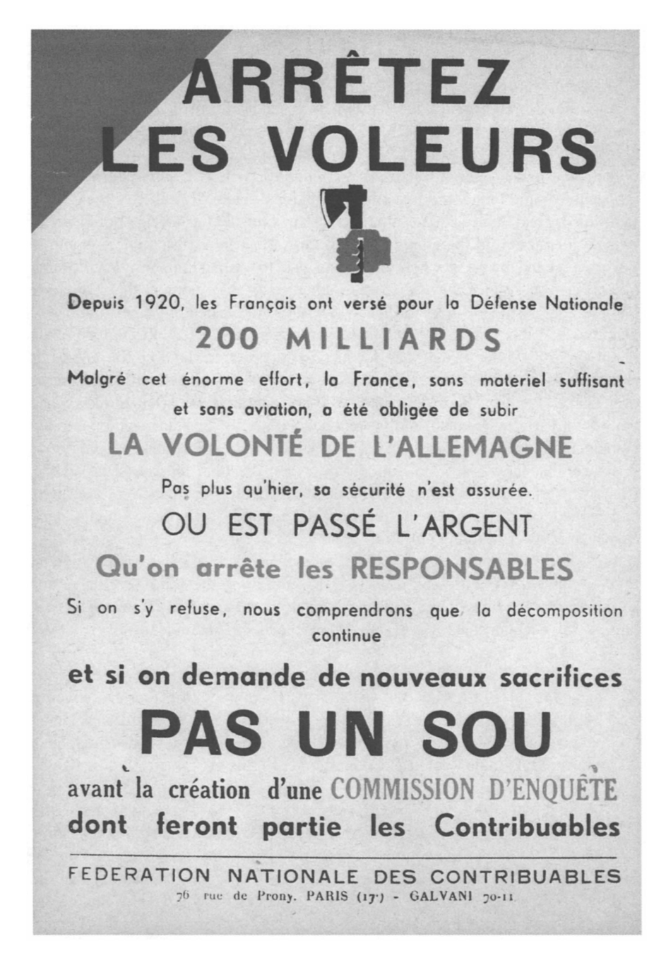
Plate 7 'Arrêtez les voleurs,' October-November 1938, author's collection.